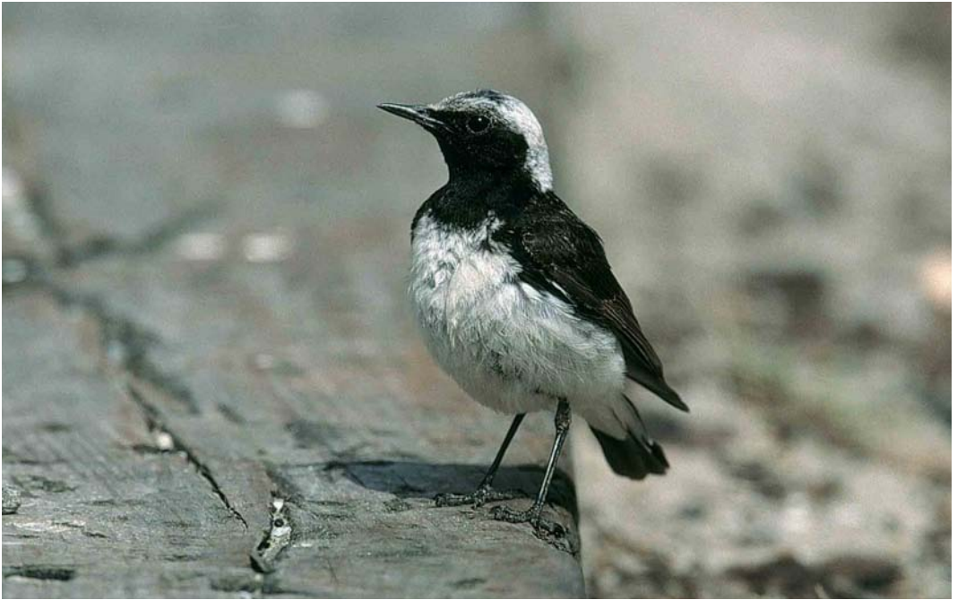
246 Bonte Tapuit / Pied Wheatear Oenanthe pleschanka , mannetje, Formerum, Terschelling, Friesland, 27 juni 2000 cf Dutch Birding 22: 182, 2000