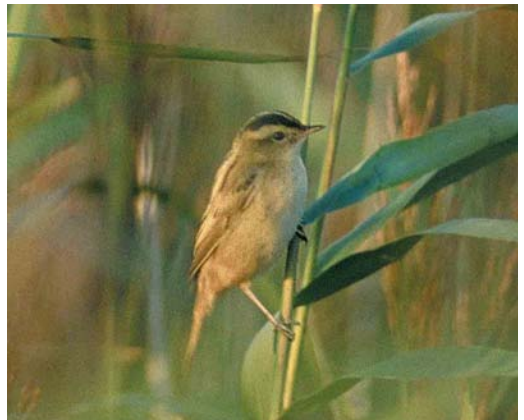
240 Ralreiger / Squacco Heron Ardeola ralloides , Egmond-Binnen, Noord-Holland, 8 juni 2000 (Cees Baart) cf Dutch Birding 22: 174, 2000 241 Steppiekievit / Sociable Lapwing Vanellus gregarius , Oosterwolde, Gelderland, 6 augustus 2000 (Eric Koops) 242-243 Steltstrandloper / Stilt Sandpiper Micropalama himantopus , adult, Sint Maartenszee, Noord-Holland, 23 juli 2000 (Teus J C Luijendijk) 244 Grasvanger / Zitting Cisticola Cisticola juncidis , Ooltgensplaat, Zuid-Holland, 27 juni 2000 (Marten van Dijl) 245 Waterrietzanger / Aquatic Warbler Acrocephalus paludicola , Westplaat, Zuid-Holland, 8 augustus 2000 (Marten van Dijl)