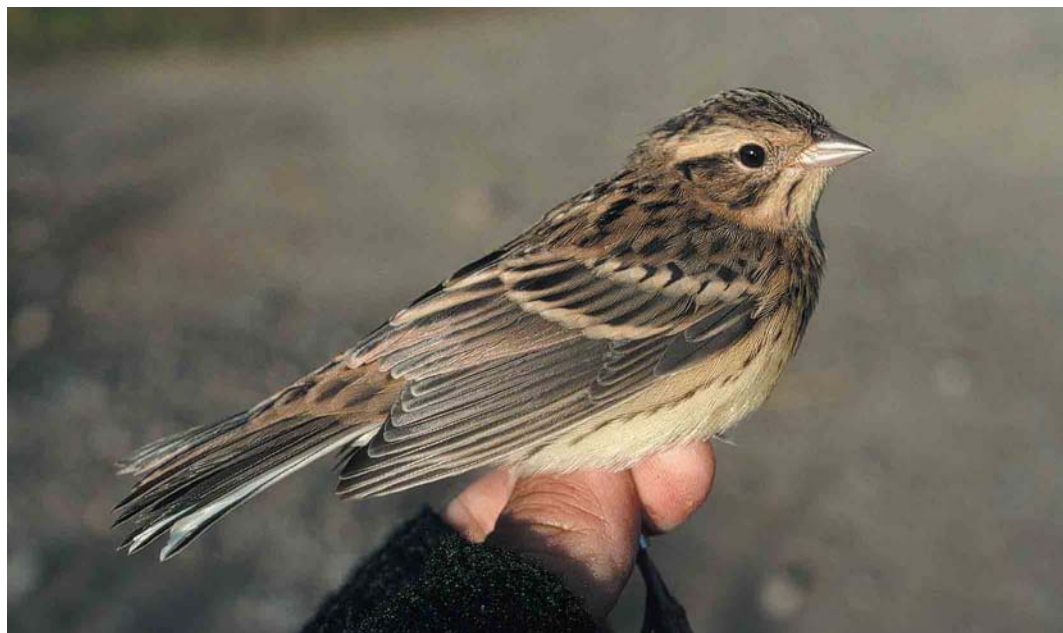
179 Yellow-breasted Bunting / Wilgengors Emberiza aureola aureola , juvenile, Liminka, Finland, July 1993 ( Jari Peltomäki ). Sometimes presence of buffish colour on tip to median and greater wing-coverts making wing-bars less distinctive. Note white outer rectrices 180 Chestnut Bunting / Rosse Gors Emberiza rutila , juvenile, Beidaihe, Hebei, China, September 1992 ( Jari Peltomäki ). Compare with juvenile Yellowhammer E. citrinella in plate 184