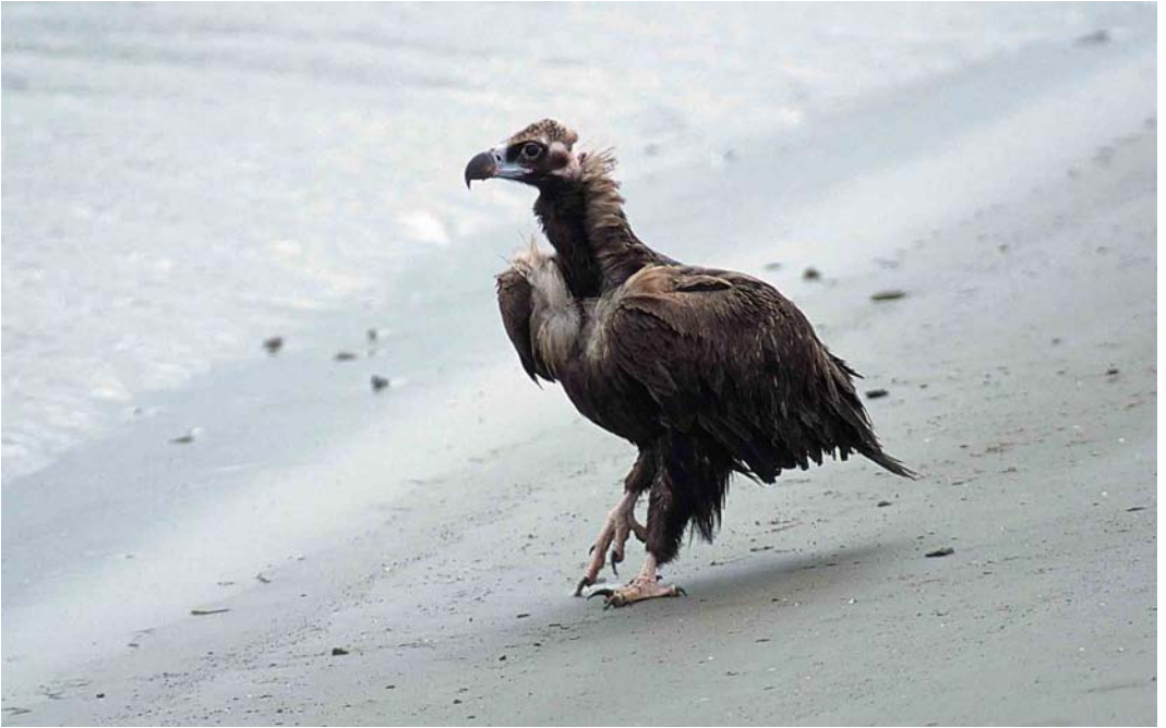
230 Eurasian Black Vulture / Monniksgier Aegypius monachus , immature, Maasvlakte, Zuid-Holland, Netherlands, 15 August 2000 231 Citrine Wagtail / Citroenkwikstaart Motacilla citreola , adult male, Kaarina, Finland, June 2000 232 Pale-faced Sheathbill / Zuidpoolkip Chionis alba , The Boulders, Simon's Town, Cape Province, South Africa, 13 August 2000