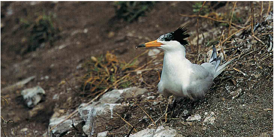
249 Chinese Crested Tern / Chinese Kuifstern Sterna bernsteini , Matsu, Taiwan, summer 2000

Op 4 september ontdekte Enno Ebels een exemplaar in de Kobbeduinen op Schiermonnikoog, Friesland. De volgende ochtend werden al vroeg twee vogels ontdekt: één door Sander Bot op de westpunt van de Stuifdijk van de Maasvlakte, Zuid-Holland, en één door Roy Slaterus in de Kunstenaarsduintjes bij IJmuiden, Noord-Holland. Beide vogels riepen niet alleen maar zongen ook met enige regelmaat. Rond de middag bleek ook de vogel op Schiermonnikoog nog aanwezig te zijn. Later in de middag maakte Arie Ouwerkerk het kwartet voor die dag vol met de waarneming van een exemplaar bij Oosterend op Terschelling, Friesland. Deze laatste vogel was naar