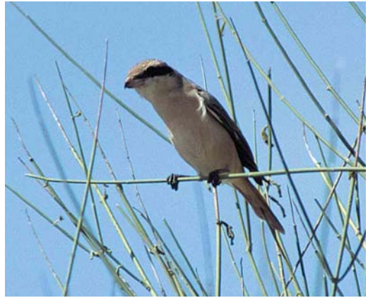
221 Daurian Shrike / Daurische Klauwier Lanius speculigerus , adult male, Dubai, United Arab Emirates, 25 February 1999 (Nils van Duivendijk)

fortunately dealing with an adult male, since birds in adult male plumage are less difficult to separate than birds in other plumages.