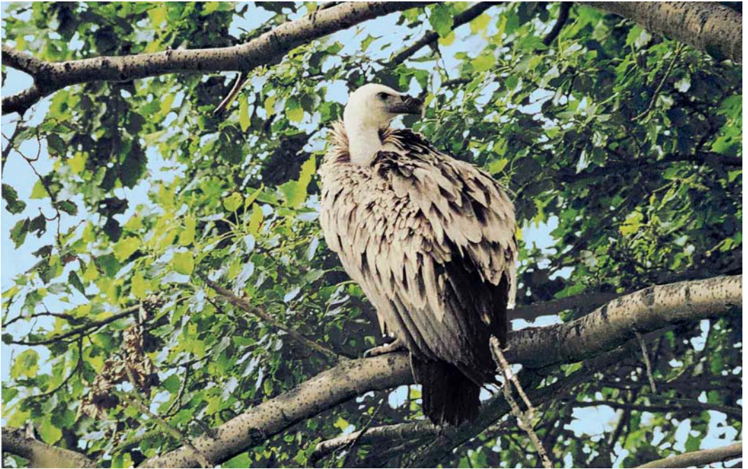
235 Vale Gier / Eurasian Griffon Vulture Gyps fulvus , Schagen, Noord-Holland, 2 augustus 2000 (Ruud E Brouwer)

de Boschplaat naar Vlieland; en op 12 augustus van Vlieland over Texel terug naar Noord-Holland, waar hij boven Het Zwanenwater en Petten werd gezien. Op 13 augustus kon hij langs de Zuid-Hollandse kust gevolgd worden via Katwijk, Meyendel, Den Haag, Monster en Hoek van Holland tot op de Maasvlakte, waar hij tot 18 augustus werd gezien. Daarna zijn er nog meldingen in Noord-Brabant op 20 augustus over Mariaheide en Hapert. Op 30 juli werd een Schreeuwarend Aquila pomarina gemeld boven de Akerdijkse Plassen, Zuid-Holland. De Dwergarend Hieraetus pennatus van Rheden, Utrecht, bleef in deze omgeving tot 8 juli. Verder waren er meldingen van deze soort op 1 en 2 juli bij de Praamweg, Flevoland, en op 7 juli bij Paterswolde, Drenthe. Een Roodpootvalk Falco vespertinus werd gemeld op 31 juli bij Amsterdam, Noord-Holland.