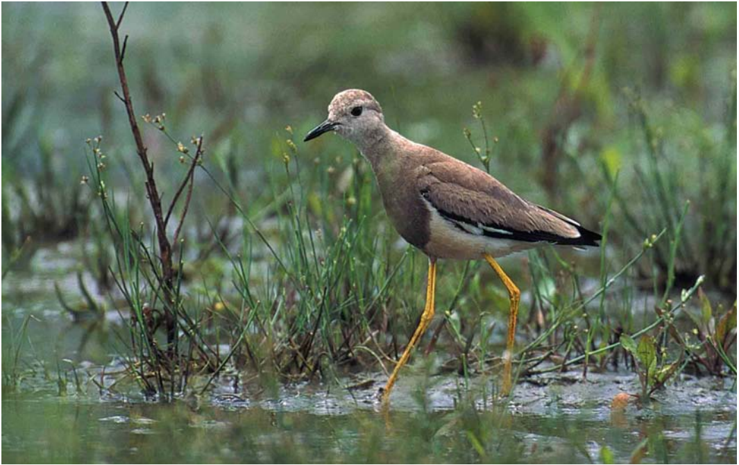
225 White-tailed Lapwing / Witstaartkievit Vanellus leucurus , adult, Polder Maltha, Werkendam, Noord-Brabant, Netherlands, 10 August 2000

had been ringed at the same site on 9 August 1997. A Madeiran Storm-petrel O castro was seen c 250 km west of Scilly, England, on 14 July. On 11 September, a Pygmy Cormorant Microcarbo pygmeus was discovered at Unterer Knappensee, Hessen, Germany.