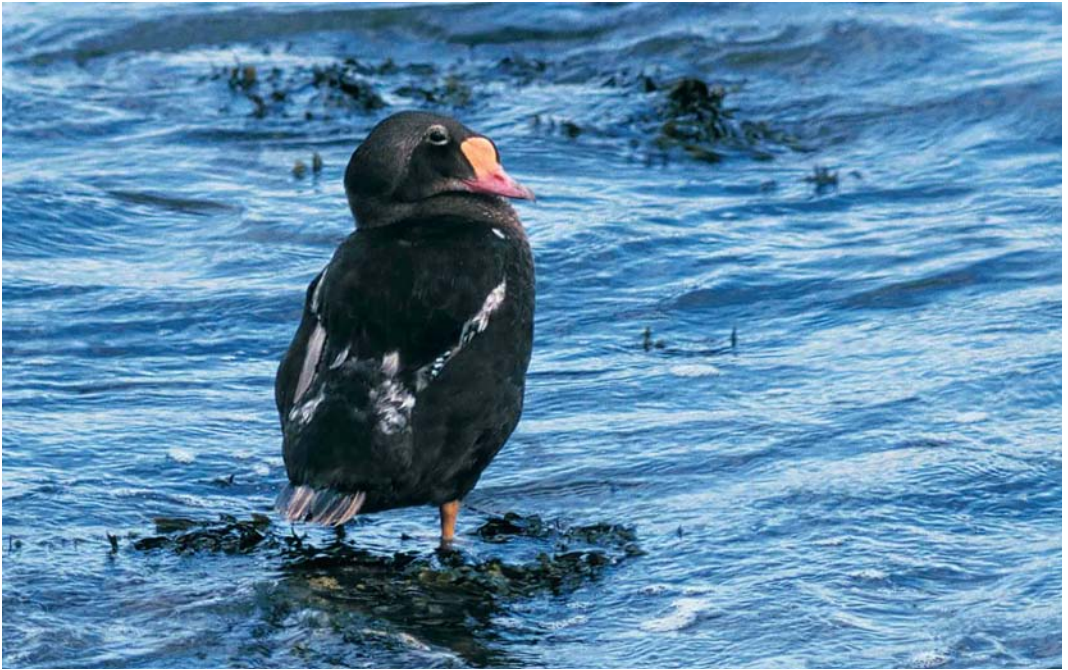
233 Koningseider / King Eider Somateria spectabilis , adult mannetje eclips, Oudeschild, Texel, Noord-Holland, 28 augustus 2000