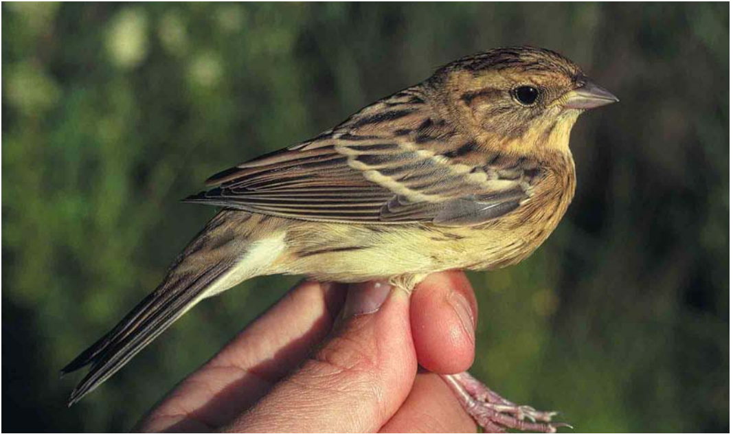
176 Yellow-breasted Bunting / Wilgengors Emberiza aureola aureola , juvenile, Liminka, Finland, July 1993 ( Jari Peltomäki ). Poorly marked individual with dark eye-stripe just behind eye and no moustachial stripe, giving plain-faced look to ear-covert area. Differs from adult female primarily by fresh plumage (adult female has worn plumage at this time of year) and by pointed dark centre of median wing-coverts 176 Chestnut Bunting / Rosse Gors Emberiza rutila , juvenile, Beidaihe, Hebei, China, September 1992 ( Jari Peltomäki ). Ear-coverts without dark framing and supercilium and sides of neck streaked. Wing-bars brownish, less obvious than in Yellow-breasted Bunting E aureola . Note also some chestnut colour on crown and ear-coverts