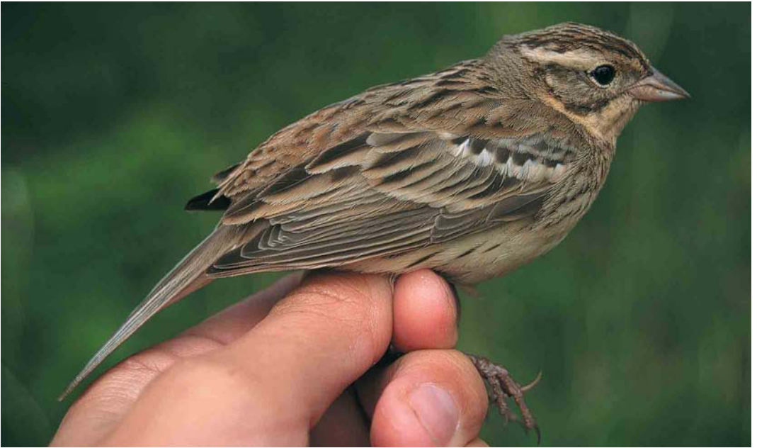
169 Yellow-breasted Bunting / Wilgengors Emberiza aureola aureola , adult female, Liminka, Finland, June 1993. Adult females can be quite brightly coloured. There is some chestnut colour on rump and sides of breast and median wing-coverts show prominent white tips. Note relatively fresh remiges, especially tertials. Short primary projection typical of Yellow-breasted Bunting 170 Chestnut Bunting / Rosse Gors Emberiza rutila , adult male, Happy Island, Beidaihe, Hebei, China, May 1993. Males on spring migration are unmistakable