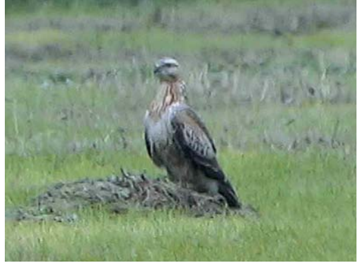
250-251 Arendbuizerd / Long-legged Buzzard Buteo rufinus , juveniel, Praamweg, Flevoland, 9 september 2000 (Marc Plomp)

verluidt al vanaf 1 september aanwezig. Overigens werd deze laatste in zeldzaamheid overtroefd door de eveneens die dag nabij Oosterend aanwezige Kleine Spotvogel Acrocephalus caligatus . De Grauwe Fitis van IJmuiden was op 10 september nog steeds aanwezig en die van Schiermonnikoog werd op 11 september – nadat er een aantral dagen niet op de plek gezocht was – opnieuw gemeld door Justin Jansen, ditmaal ook zingend.