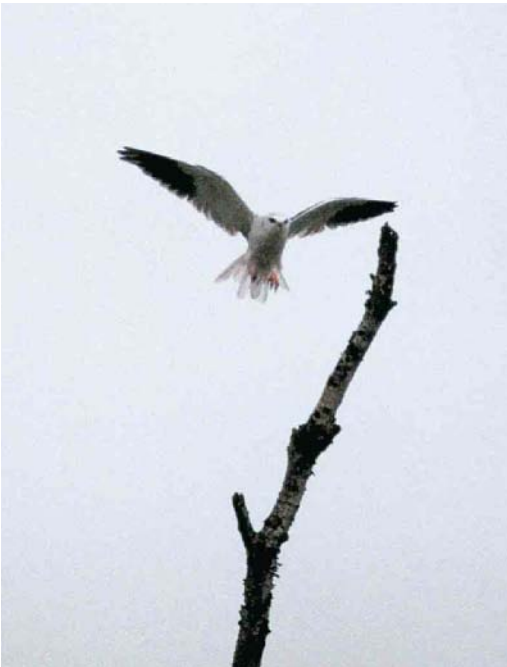
223 Black-winged Kite / Grijze Wouw Elanus caeruleus , Meerstalblok, Drenthe, Netherlands, 28 July 2000 (Arian van Dam)