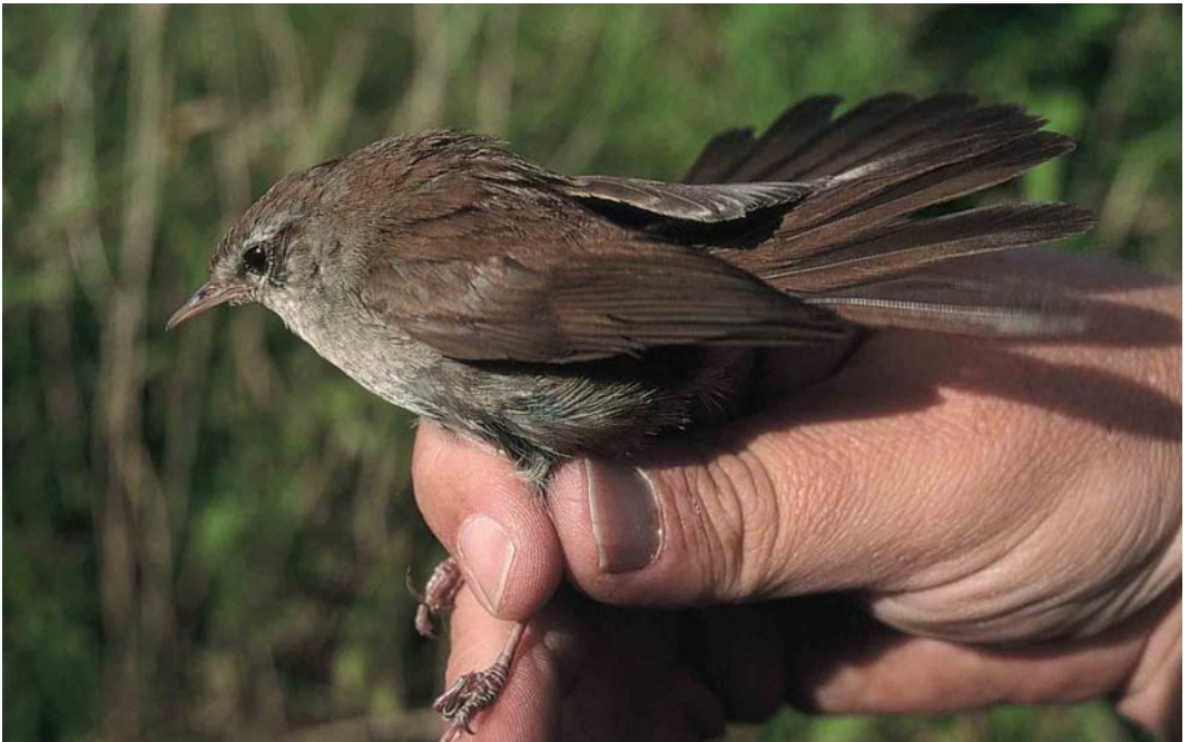
247 Cetti's Zanger / Cetti's Warbler Cettia cetti , Oostvoornse Meer, Zuid-Holland, 28 juni 2000