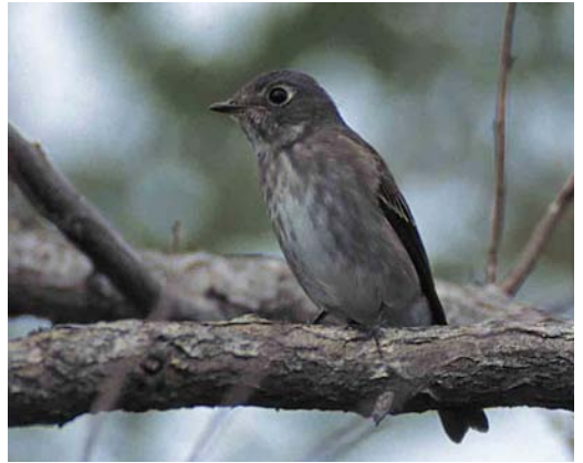
204 Yellow-rumped Flycatcher / Driekleurenvliegenvanger Ficedula zanthopygia , male, Chilbal Island, South Cholla Province, South Korea, May 2000 ( Jeong-Hwa Seo ) 205 Yellow-rumped Flycatcher / Driekleurenvliegenvanger Ficedula zanthopygia , female, Baekryong Island, Kyunggi Province, South Korea, May 1992 ( Jin-Young Park ) 206 Mugimaki Flycatcher / Mugimakivliegenvanger Ficedula mugimaki , female, Chilbal Island, South Cholla Province, South Korea, May 1999 ( Jeong-Hwa Seo ) 207 Dark-sided Flycatcher / Roetvliegenvanger Muscicapa sibirica , Kanghwa Island, South Korea, late September 1996 ( Nick Lethaby )

star attraction. This flock feeds just after dawn in the rice fields but typically spends much of the day in the salt-marsh or on the tidal flats. The mudflats hold over 1000 Saunders's Gulls and 15 000 Common Shelducks. The reedbeds and rice fields hold Chinese Penduline Tits and numerous buntings including Pallas's Reed, Common Reed, Yellow-throated, Little E pusilla , Rustic, Black-faced E spodocephala and Chestnut-eared Buntings E fucata .