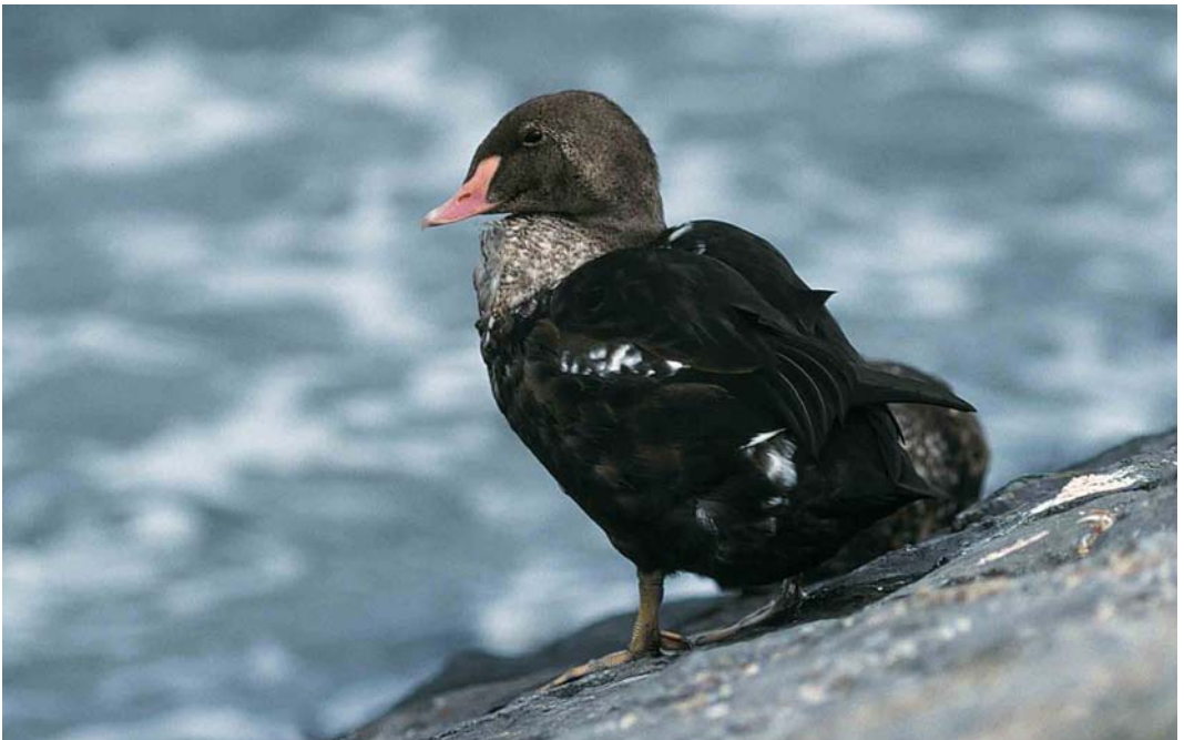
234 Koningseider / King Eider Somateria spectabilis , tweedejaars mannetje, Oudeschild, Texel, Noord-Holland, 3 september 2000 (Ruud E Brouwer)