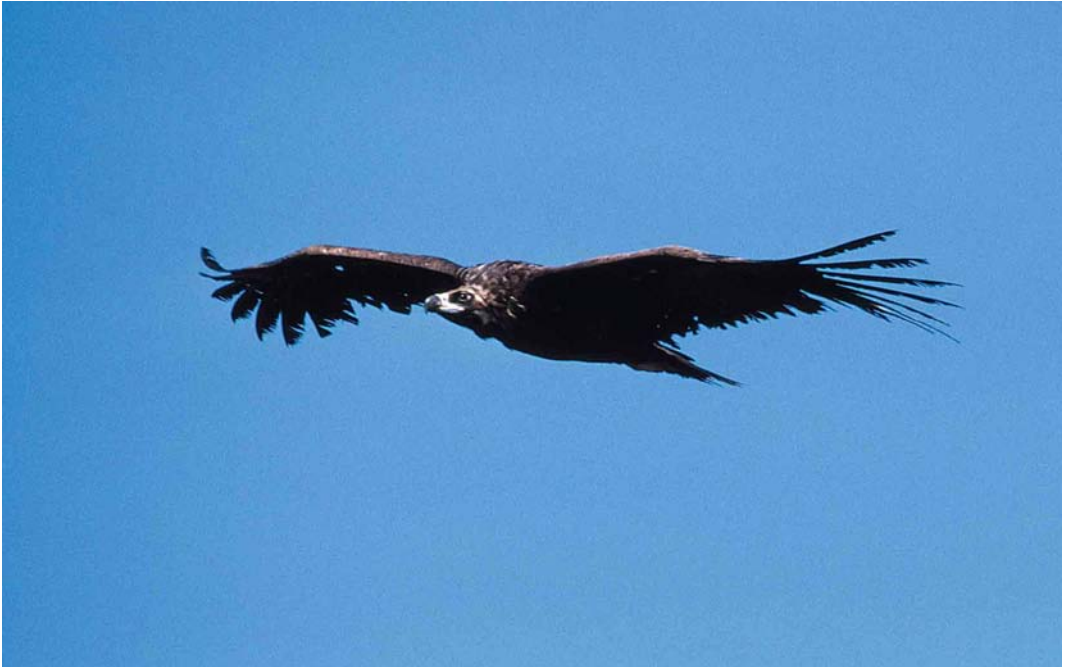
236 Monniksgier / Eurasian Black Vulture Aegypius monachus , onvolwassen, Maasvlakte, Zuid-Holland, 16 augustus 2000