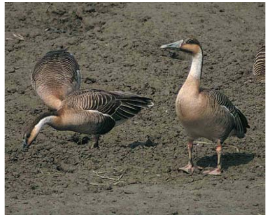
192 Black-faced Spoonbills / Kleine Lepelaars Platalea minor , Kanghwa Island, Kyunggi Province, South Korea, September 1998 ( Jeong-Hwa Seo ) 193 Oriental Storks / Zwartsnavelooievaars Ciconia boyciana , Ch'ŏn-su Bay, South Chungcheong Province, South Korea, December 1995 ( Jeong-Hwa Seo ) 194 Nordmann's Greenshanks / Nordmanns Groenpootruiters Tringa guttifer , Yongjong Island, Kyunggi Province, South Korea, September 1994 ( Jin-Young Park ) 195 Chinese Egret / Chinese Zilverreiger Egretta eulophotes , Yeonpyung Island, Kyunggi Province, South Korea, May 2000 ( Jeong-Hwa Seo ) 196 Swan Geese / Zwaanganzen Anser cygnoides , Imjin River, Kyunggi Province, South Korea, November 1995 ( Jin-Young Park )