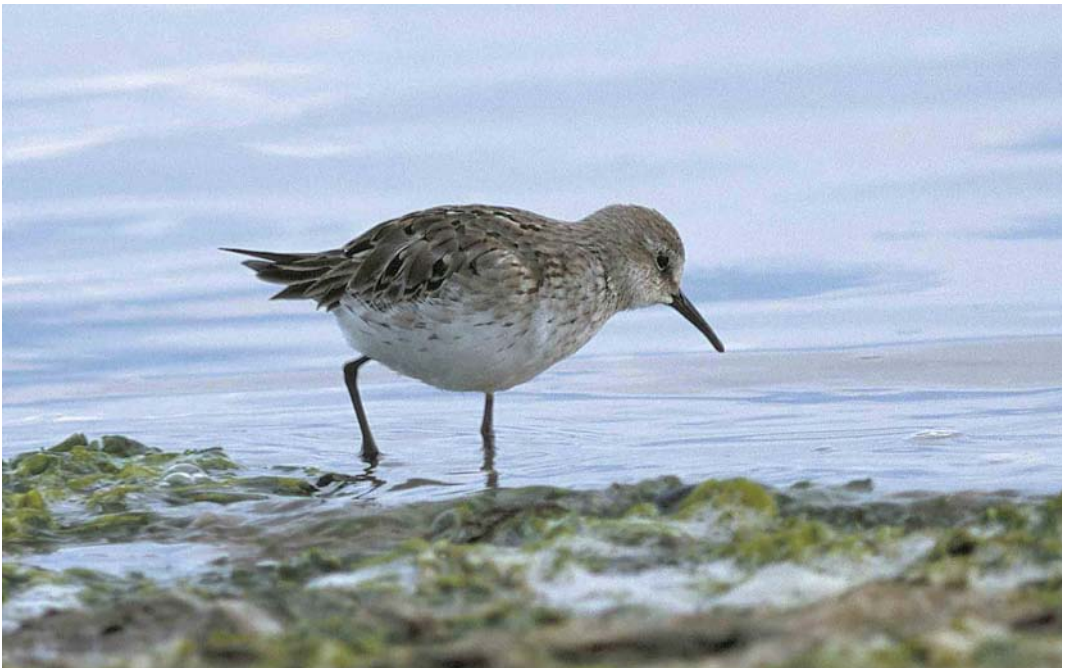
239 Bonapartes Strandloper / White-rumped Sandpiper Calidris fuscicollis , adult, Zeeburg, Texel, Noord-Holland, 2 september 2000 (Ruud E Brouwer)