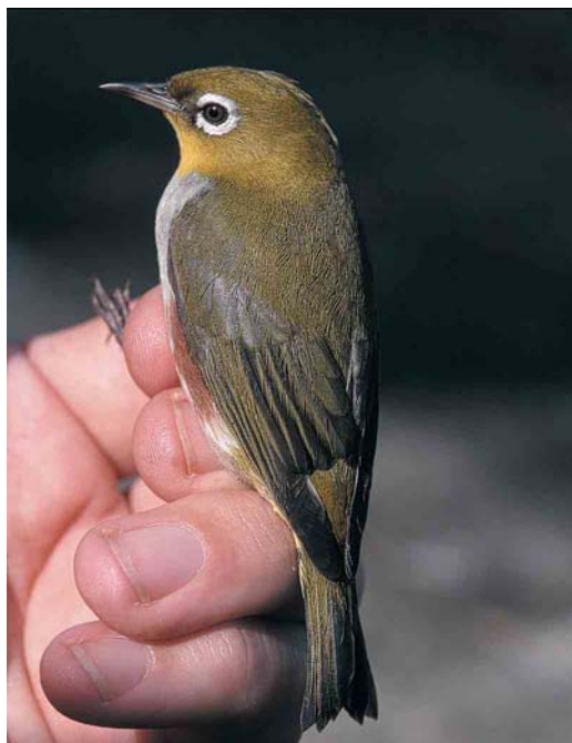
212 Chestnut-flanked White-eye / Roodflankbrilvogel Zosterops erythropleurus , Kadoorie Farm and Botanic Garden, Hong Kong, China, November 1999 (Paul J Leader). Note long primary projection and diffuse contrast between yellow throat and green side of head