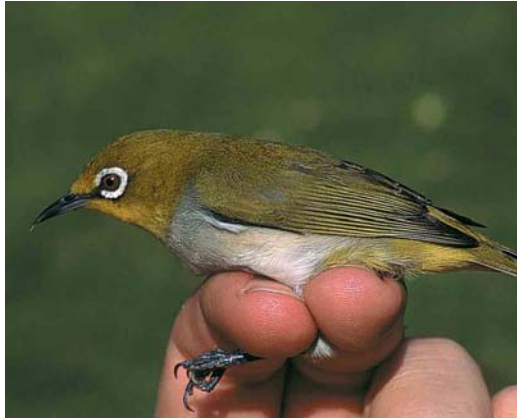
216 Chestnut-flanked White-eye / Roodflankbrilvogel Zosterops erythropleurus , Kadoorie Farm and Botanic Garden, Hong Kong, China, November 1999 (Paul J Leader). Note pale pinkish base to lower mandible, rather broad eye-ring, diffusely dark lores and relatively small throat patch 217 Japanese White-eye / Japanese Brilvogel Zosterops japonicus simplex , Mai Po, Hong Kong, China, 11 September 1999 (Paul J Leader). Note greyish-blue base to lower mandible, relatively bright iris, solid-black lores and relatively large throat patch 218 Japanese White-eye / Japanese Brilvogel Zosterops japonicus simplex , Kadoorie Farm and Botanic Garden, Hong Kong, China, 14 November 1999 (Paul J Leader). Note dull greyish-brown iris 219 Japanese White-eye / Japanese Brilvogel Zosterops japonicus simplex , Mai Po, Hong Kong, China, 11 September 1999 (Paul J Leader). Note distinctly grey side of breast, and relatively pale flank