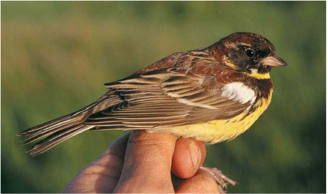
167 Yellow-breasted Bunting / Wilgengors Emberiza aureola aureola , second-summer male, Liminka, Finland, June 1996 (Jari Peltomäki). Second-summer males often have pale supercilium behind eye, black ear-coverts mixed with some brown feathers, some white feathers on black throat, buff fringes to mantle-feathers and trace of pale median crown-stripe 168 Yellow-breasted Bunting / Wilgengors Emberiza aureola aureola , first-summer male, Liminka, Finland, June 1995 (Jari Peltomäki). First-summer males can be superficially similar in plumage to adult females. Note however chestnut colour on rump, crown, nape and sides of breast and also blackish feathers on throat and ear-coverts, typical of males. Heavily worn rectrices and remiges, especially tertials, typical of first-summer birds