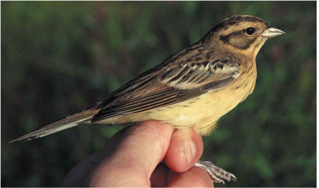
173 Yellow-breasted Bunting / Wilgengors Emberiza aureola aureola , juvenile, Liminka, Finland, July 1993 ( Jari Peltomäki ). Strongly marked individual with obvious dark framing on ear-coverts and lot of white on median wing-coverts. Strong unstreaked supercilium and yellow area on sides of neck below ear-coverts typical of Yellow-breasted Bunting 174 Chestnut Bunting / Rosse Gors Emberiza rutila , female, Mai Po, Hong Kong, China, November 1992 ( Jari Peltomäki ). Note really plain looking face with pale eye-ring standing out obviously. Wing-bars indistinct and unstreaked rump showing obvious deep chestnut colour