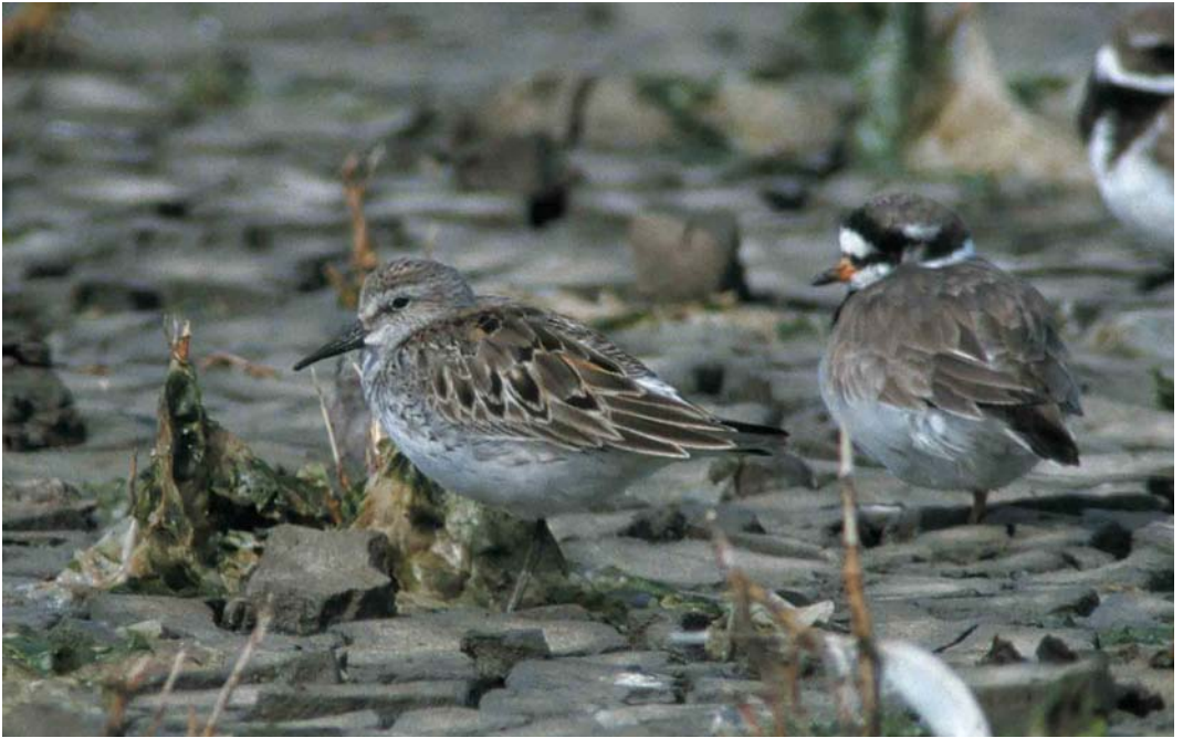
238 Bonapartes Strandloper / White-rumped Sandpiper Calidris fuscicollis , adult, met Bontbekplevier / Common Ringed Plover Charadrius hiaticula , Zwarte Haan, Friesland, 20 augustus 2000 (Roef Mulder)