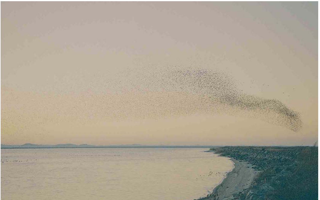
190 Baikal Teals / Siberische Talingen Anas formosa , Ch'ön-su (Lake A), South Korea, 25 November 1998