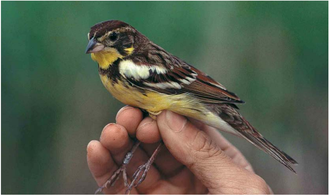
185 Yellow-breasted Bunting / Wilgengors Emberiza aureola , presumably of subspecies E a ornata , male, Mai Po, Hong Kong, China, 5 April 1988 (Ray Tipper). Black sides of breast suggesting E a ornata . Ageing difficult because of peculiar combination of adult-looking wing with lot of white and restricted black on face and chin more typical of immature 186 Yellow-breasted Bunting / Wilgengors Emberiza aureola , presumably of subspecies E a ornata , male, Tsim Bei Tsui, Hong Kong, China, 10 May 1986 (Ray Tipper). Note extensive black forehead, dark upperparts and blackish sides of breast and streaks on flanks, indicating E a ornata . Wing-bars fully covered by flank-feathers 187 Yellow-breasted Bunting / Wilgengors Emberiza aureola , presumably of subspecies E a ornata , female, Tsim Bei Tsui, Hong Kong, China, 10 May 1986 (Ray Tipper). Female E a ornata hardly separable from E a aureola but underparts slightly brighter coloured in E a ornata