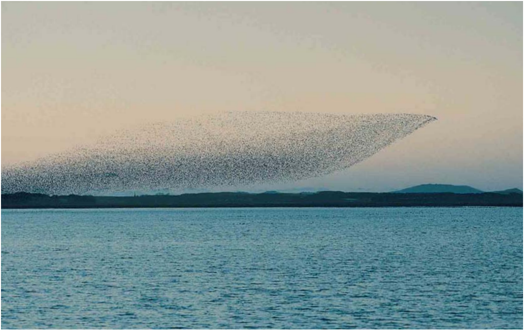
189 Baikal Teals / Siberische Talingen Anas formosa , Ch'ön-su (Lake B), South Korea, 16 December 1999 (Hyun-Tae Kim)