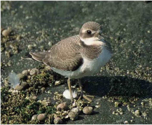
220 Common Ringed Plover / Bontbekplevier Charadrius hiaticula , juvenile, Maasvlakte, Zuid-Holland, Netherlands, 28 August 1999