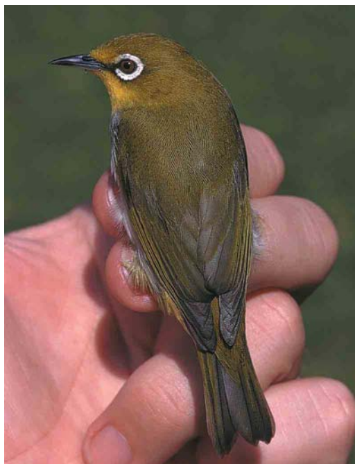
213 Japanese White-eye / Japanse Brilvogel Zosterops japonicus simplex , Mai Po, Hong Kong, China, 11 September 1999. Note short primary projection and pronounced contrast between yellow throat and green side of head