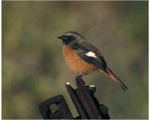
208 Pallas's Rosefinch / Pallas' Roodmus Carpodacus roseus , between Kwangnung and Imjingak, South Korea, January 1997 (Nick Lethaby) 209 Pallas's Rosefinch / Pallas' Roodmus Carpodacus roseus , male, between Kwangnung and Imjingak, South Korea, January 1997 (Nick Lethaby) 210 Amur Wagtail / Amoerkwikstaart Motacilla leucopsis , Gapyung, Kyunggi Province, South Korea, May 1998 (Jeong-Hwa Seo) 211 Daurian Redstart / Spiegelroodstaart Phoenicurus aureoreus , male, Kanghwa Island, South Korea, late September 1996 (Nick Lethaby)

flavicollis , a Japanese Night Heron Gorsachius goisagi , seven Chinese Egrets, a Saker Falcon flying over Korea's first Northern Wheatear Oenanthe oenanthe , several Blyth's Pipits A godlewskii (maximum of five together), a Rosy Pipit A roseatus (first recent record) and maximum day totals of c 50 Pale-legged Leaf Warblers P tenellipes and at least 150 Tristram's Buntings.