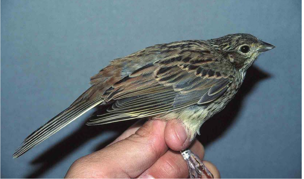
184 Yellowhammer / Geelgors Emberiza citrinella , juvenile, Liminka, Finland, August 1993. Note bluish-grey lower mandible, absence of supercilium, yellow edges to primaries and long tail with lot of white on outer rectrices

moult until halfway on autumn migration at stop-over sites in China (for details, see Byers et al 1995). E a ornata strongly resembles E a aureola in plumage but shows some subtle differences, mainly in adult male plumage. In adult male E a ornata , the black of the head covers the forehead and extends to above the eye, the upperparts are darker and the sides of the breast are streaked blackish rather than brownish; the underparts are, on average, brighter yellow. In female E a ornata , the plumage is brighter and the sides of the breast tend to be more heavily streaked in comparison with E a aureola (Cramp & Perrins 1994, Byers et al 1995).