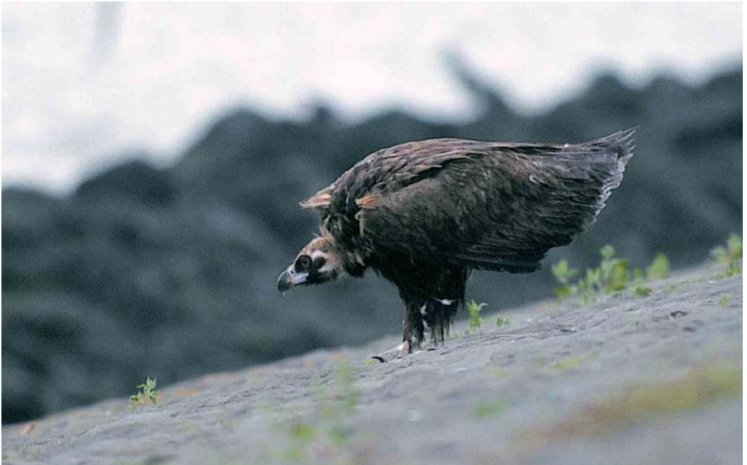
237 Monniksgier / Eurasian Black Vulture Aegypius monachus , onvolwassen, Den Oever, Noord-Holland, 26 juli 2000