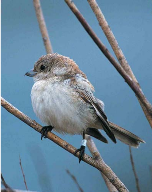
248 Roodkopklauwier / Woodchat Shrike Lanius senator , juveniel, Heist, West-Vlaanderen, 25 augustus 2000 (Erik van Bogaert)

beesten daar...? De eerste Pontische Meeuwen Larus cachinnans cachinnans doken op te Hensies-Pomeroeul van 26 juli tot 24 augustus (adult) en te Zeebrugge van 20 tot 27 augustus (eerste-winter). Op 3 augustus vloog een adulte Lachstern Gelochelidon nilotica over Het Zwin te Knokke; daar werden er op 10 augustus twee gezien. Op 11 augustus foerageerde er één boven het Kempisch Kanaal te Schoten, Antwerpen. De enige twee Reuzensterns Sterna caspia voor de periode trokken op 21 augustus langs Zeebrugge. Op 2 juli werd nog een Witwangstern Chlidonias hybridus opgemerkt te Longchamps, Namur, en op 11 juli één te Schoten. Twee juveniele Witvleugelsterns C leucopterus verbleven op 27 augustus kortstondig bij Tienen.