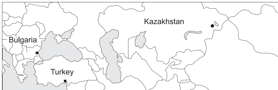
FIGURE 1 Ringing site in Kazakhstan (dot) and (possible) recovery sites in Bulgaria and Turkey (squares) of Relict Gulls / Relictmeeuwen Larus relictus

Relict Gull has been present here for a long time. E F Rodionov, when studying the egg collection of A A Sludsky, discovered two eggs of this species (labelled as ' Larus melanocephalus ') which had been collected on 21 May 1931 at Lake Alakol' near Rybal'noye (now Rybach'ye). Their measurements were 61.8 x 45.2 and 59.6 x 42.7 mm, respectively. In 1931, M D Zverev reportedly ringed four pulli of Mew Gull L canus at Lake Alakol', a species which has, however, never nested here (Dolgushin 1962). Presumably, these were pulli of Relict Gull.