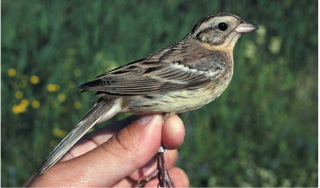
171 Yellow-breasted Bunting / Wilgengors Emberiza aureola aureola , first-summer female, Liminka, Finland, June 1994 (Jari Peltomäki). Younger females can be dull in colours. Median-covert pattern with dark-pointed centres shown here similar to that of juvenile and quite different from that of adult female. There is hardly any chestnut colour in this plumage and remiges, especially tertials, are heavily worn 172 Chestnut Bunting / Rosse Gors Emberiza rutila , male, Mai Po, Hong Kong, China, November 1992 (Jari Peltomäki). Deep chestnut colour of head just visible under pale feather-edges. Rump, median and inner greater wing-coverts showing obvious deep chestnut colour