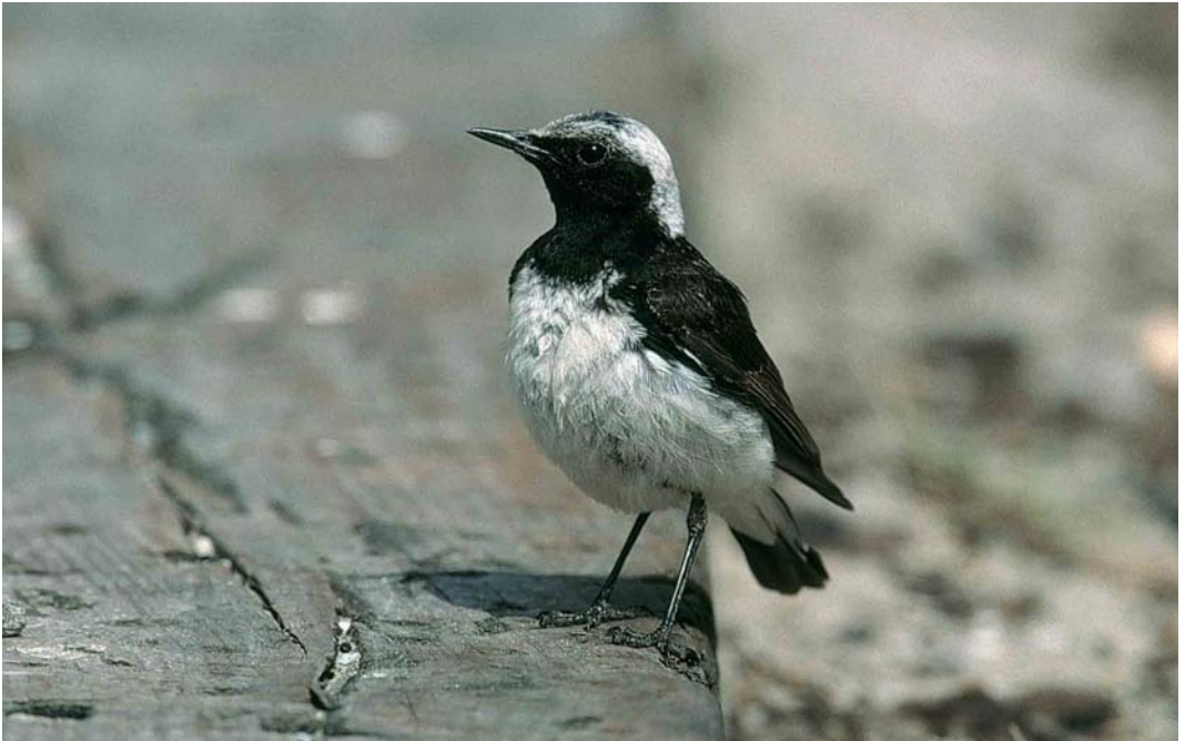
246 Bonte Tapuit / Pied Wheatear Oenanthe pleschanka , mannetje, Formerum, Terschelling, Friesland, 27 juni 2000 ( Arie Ouwerkerk ) cf Dutch Birding 22: 182, 2000