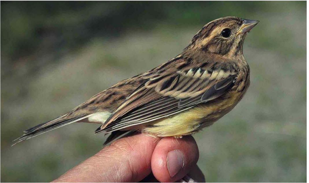
177 Yellow-breasted Bunting / Wilgengors Emberiza aureola aureola , juvenile, Liminka, Finland, July 1993 ( Jari Peltomäki ). Pale median crown-stripe and pale braces on mantle typical of Yellow-breasted Bunting. Rump streaked and with only little brown coloration. Note short primary projection 178 Chestnut Bunting / Rosse Gors Emberiza rutila , juvenile, Beidaihe, Hebei, China, September 1992 ( Jari Peltomäki ). Different individual from bird in plate 176. Rump slightly streaked and obviously reddish-brown. Buffish-brown colour on tips to median and greater wing-coverts making wing-bars indistinct. No white present in outer rectrices