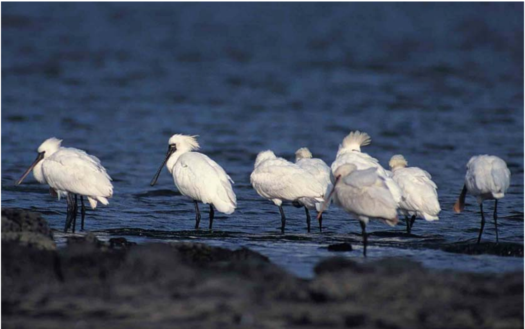
191 Black-faced Spoonbills / Kleine Lepelaars Platalea minor with Eurasian Spoonbill / Lepelaar P leucorodia , Jeju Island, South Korea, March 1997

During migration, the mudflats attract very large numbers of shorebirds. The peak periods are from mid-April to mid-May and from early August to October. These concentrations are best viewed at Yocha-ri or Sonduri or by driving along the south-west coast of the island – scanning for birds or trying out small farm roads to