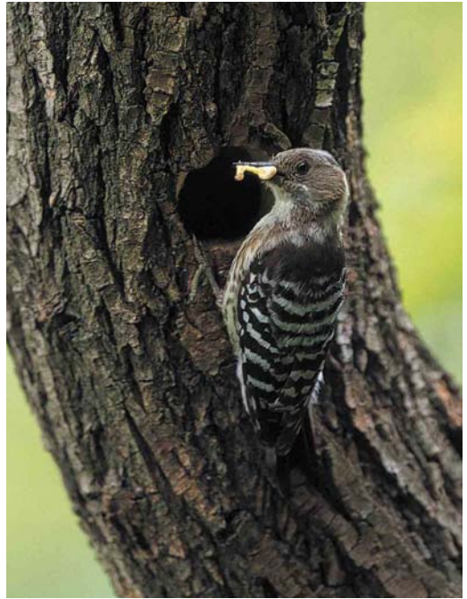
201 Chinese Penduline Tit / Chinese Buidelmees Remiz (pendulinus) consobrinus , Keum Estuary, North Cholla Province, South Korea, March 1994 ( Jin-Young Park ) 202 Japanese Pygmy Woodpecker / Kizukispecht Dendrocopos kizuki , Toechon, Kyunggi Province, South Korea, May 1995 ( Jeong-Hwa Seo ) 203 Varied Tit / Bonte Mees Parus varius , Kwangnung Forest, Kyunggi Province, South Korea, February 1994 ( Jeong-Hwa Seo )