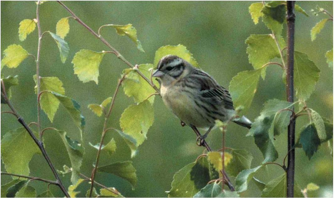
181 Yellow-breasted Bunting / Wilgengors Emberiza aureola aureola , adult female, Kajaani, Finland, June 1980 (René Pop). Note obvious pale supercilium, pale lateral crown-stripe, yellow 'half moon' below ear-coverts and absence of malar stripe. Lot of white on median wing-coverts suggesting adult female 182 Yellow-breasted Bunting / Wilgengors Emberiza aureola aureola , juvenile, Liminka, Finland, July 1993 (Jari Peltomäki). Note strong unstriated supercilium, unstriated sides of neck, yellow area below ear-coverts, unstriated lower throat and weak malar stripe 183 Chestnut Bunting / Rosse Gors Emberiza rutila , juvenile, Beidaihe, Hebei, China, September 1992 (Jari Peltomäki). Note striated supercilium and sides of neck. Malar stripe obvious and lower throat conspicuously striated