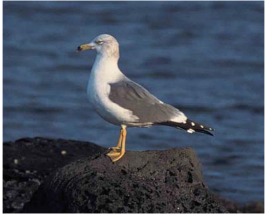
197 Saunders's Gull / Saunders' Meeuw Larus saundersi , immature, Keum Estuary, North Cholla Province, South Korea, January 1999 ( Jeong-Hwa Seo ) 198 Relict Gull / Relictmeeuw Larus relictus , Nakdong Estuary, South Kyungsang Province, South Korea, February 1993 ( Jin-Young Park ) 199 Mongolian Gull / Mongoolse Meeuw Larus cachinnans mongolicus , adult, Naksan Beach near Sokcho, Kangwon Province, South Korea, December 1998 ( Jin-Young Park ) 200 Black-tailed Gull / Japanese Meeuw Larus crassirostris , Ch'ön-su, South Korea, late September 1996 ( Nick Lethaby )

(DMZ). There is a large souvenir store and restaurant here, with an open rooftop where you can scan for birds – a telescope is essential. Since the DMZ has few inhabitants, it attracts many wintering raptors and wildfowl, along with small numbers of cranes. Imjingak and the freeway that runs south-west from here along the south side of the Imjin River and then the north bank of the Han River are good places to look for these species. Birding around here is a bit 'hit or miss' but there are usually some good birds to see on each visit.