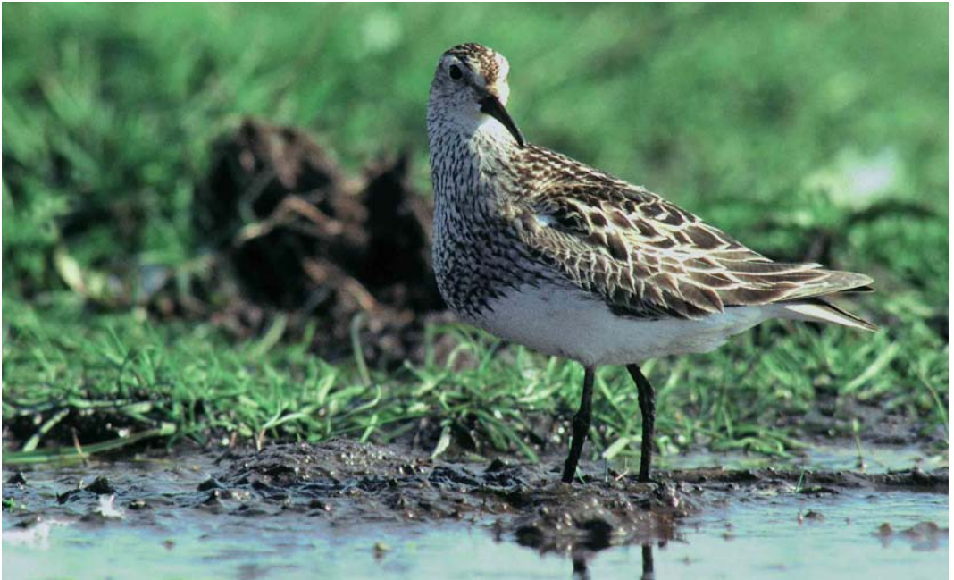
64 Pectoral Sandpiper / Gestreepte Strandloper Calidris melanotos , adult, Wormer- en Jisperveld, Noord-Holland, 10 July 1997

The first, but in retrospect the second record for the Netherlands, concerned a confiding individual which took up residence in the city of Groningen, for obvious reasons close to a McDonald's restaurant. After thorough study of the moult of the Groningen individual, several observers demanded review of the rejected 1993 record which was documented by a number of (poor-quality) photographs. One of the reasons for rejection of that record were the very short primaries, but CDNA now has decided that this can well be attributed to moult. Therefore, the Harderwijk record becomes the first.