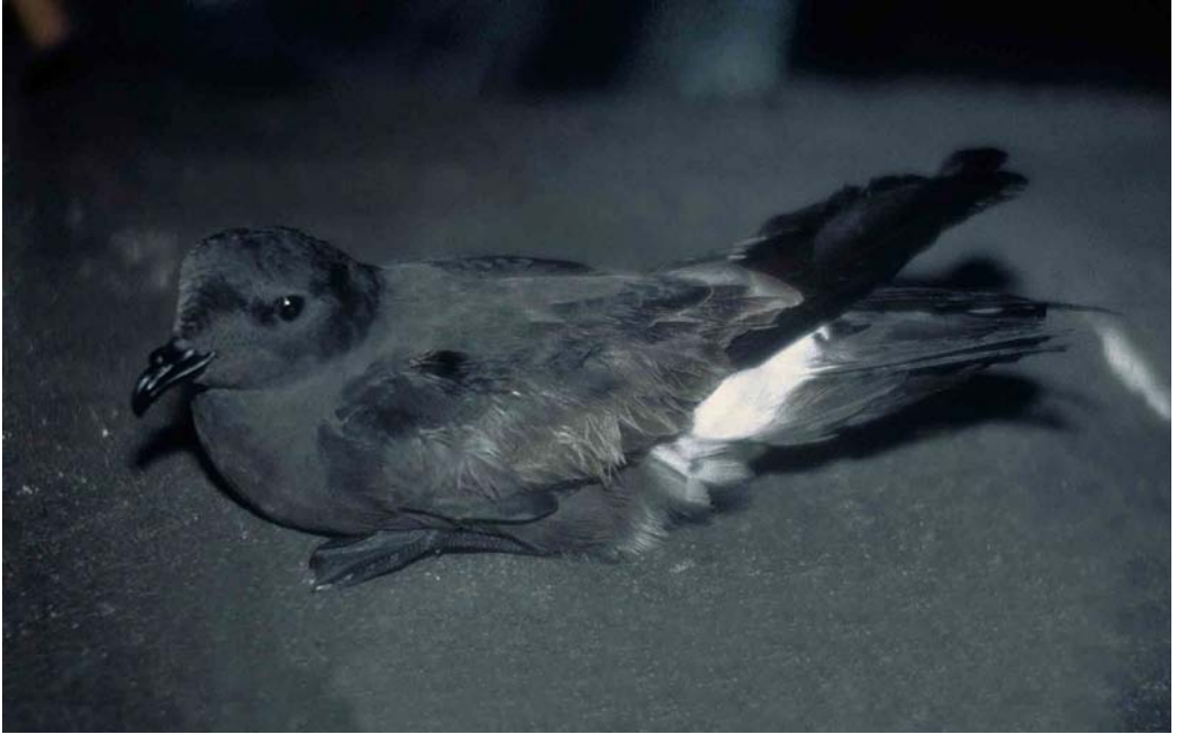
87 Madeiran Storm-petrel / Madeirastormvogeltje Oceanodroma castro , Furna Roques, Ilhas Desertas, Madeira, September 1996 (Manuela Nunes)

birds ringed in one season were recaptured in the same season in a subsequent year whereas only two possible interchanges between hot- and cool-season populations were noted. The brood-patch scores of the latter two individuals suggested that they were non-breeders (Monteiro & Furness 1998).