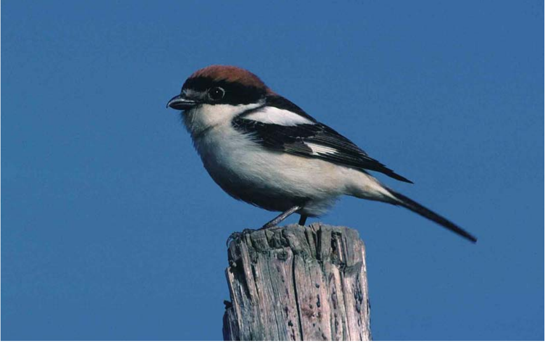
73 Woodchat Shrike / Roodkopkluwier Lanius senator , male, Hornhuizen, Groningen, 25 May 1997