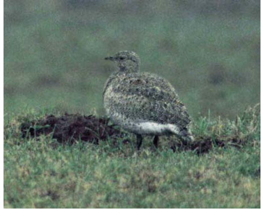
63 Little Bustard / Kleine Trap Tetrax tetrax , immature male, Etersheim, Zeevang, Noord-Holland, 8 March 1997