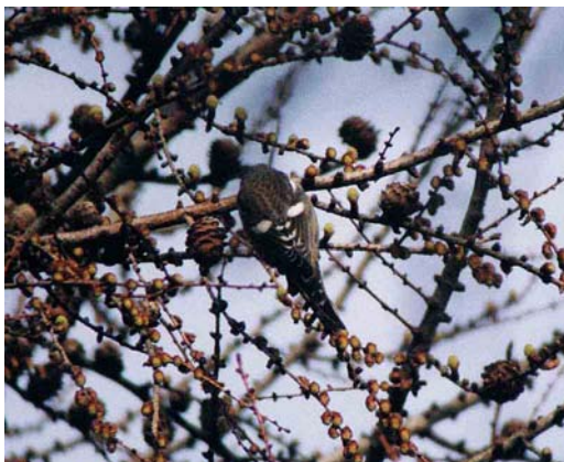
82 Two-barred Crossbill / Witbandkruisbek Loxia leucoptera bifasciata , female, Heide van Duurswoude, Friesland, 14 March 1998 (Oane Tol)