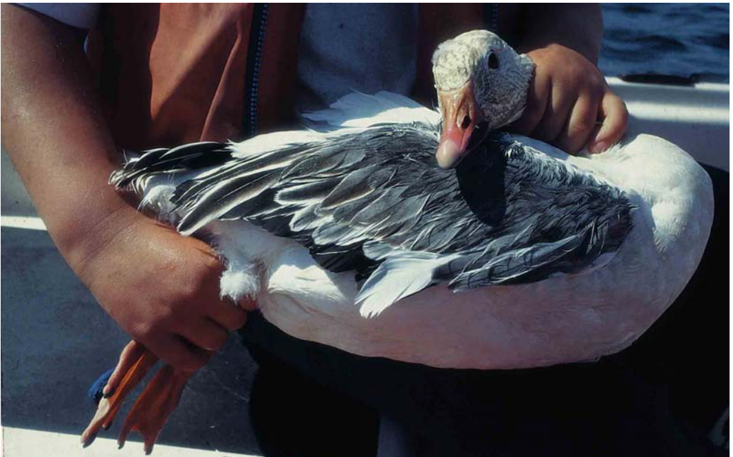
85 Sneeuwgans / Snow Goose Anser caerulescens , Smålø, Trondheim, Noorwegen, 13 juli 1997

Van 18 tot 26 april 1980 bevonden zich 18 Sneeuwgansen (13 witte en één blauwe adult en vier onvolwassen) bij Andijk, Noord-Holland. Eén van de witte vogels was geringd; deze bleek in 1977 als kuiken te zijn geringd in La Pérouse Bay, Manitoba, Canada. Het betrof een mannetje Kleine Sneeuwgans (Blankert 1980). Samen met een aantal recente terugmeldingen van in Noord-Amerika gehalsringde canadese ganzen Branta canadensis parvipes/B hutchinsii uit Ierland en