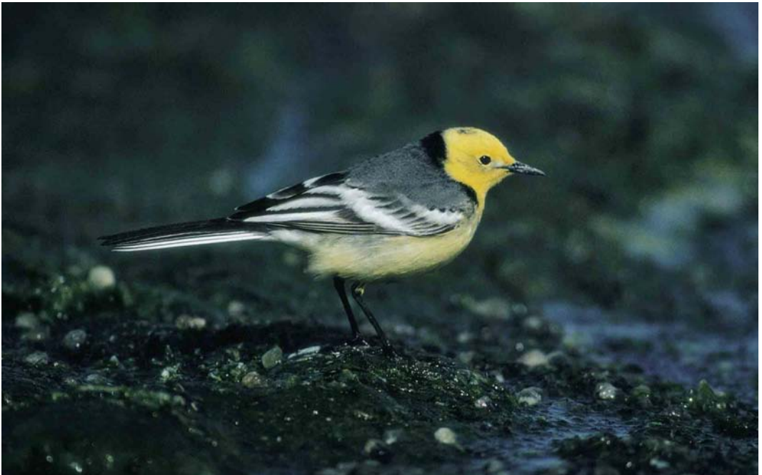
98 Citrine Wagtail / Citroenkwikstaart Motacilla citreola , male, Eilat, Israel, 12 March 1999 (Arie Ouwerkerk)

On 18 March, the first Pallas's Gull Larus ichthyaetus for Belgium was an adult photographed during its three minutes stay at Gullegem, West-Vlaanderen. The first Grey-headed Gull L cirrocephalus for Egypt was an adult winter reported on 7 February at Nabaq in the southern Sinai. If accepted, an adult Armenian Gull L armenicus at Siracusa dump, Sicily, Italy, on 2 March will be the second for Italy. In Ireland, at least three first-winter and two adult American Herring Gulls L smithsonianus were present during March at Killybegs, Donegal; also in March, at the same site, at least three Kumlien's Gulls L glaucoides kumlieni were seen. The third, fourth and fifth Caspian Terns Sterna caspia for the Cape Verde Islands were reported between 21 February and 14 March on Boavista, off Raso, and on São Vicente, respectively. A first-winter Forster's Tern