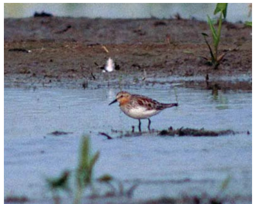
324 Black-winged Pratincole / Steppevorkstaartplevier Glareola nordmanni , adult, Hooge Zwaluwe, Noord-Brabant, 2 July 1998 ( Hans Gebuis ) 325 Black-winged Kite / Grijze Wouw Elanus caeruleus , Eierlandse Duinen, Texel, Noord-Holland, 30 March 1998 ( René van Rossum ) 326 Hutchins's Canada Goose / Hutchins' Canadese Gans Branta hutchinsii hutchinsii , Bandpolder, Friesland, 25 April 1998 ( Roef Mulder ) 327 White-headed Duck / Witkopeend Oxyura leucocephala , Nieuwe Diep, Amsterdam, Noord-Holland, 21 January 1998 ( Arnoud B van den Berg ) 328 Terek Sandpiper / Terekruiter Xenus cinereus , adult, Camperduin, Noord-Holland, 10 October 1998 ( Jan den Hertog ) 329 Red-necked Stint / Roodkeelstrandloper Calidris ruficollis , adult, Oud-Beijerland, Zuid-Holland, 4 July 1998 ( Hans Gebuis )