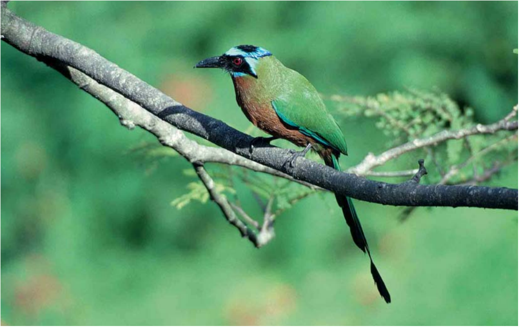
362 Blue-crowned Motmot / Blauwkapmotmot Momotus momota, Costa Rica, January