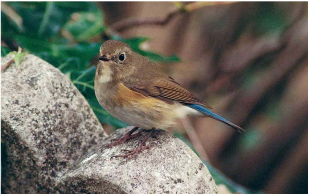
378 Red-flanked Bluetail / Blauwstaart Tarsiger cyanurus , Rame Head, Cornwall, England, October 1999 (Iain H Leach) (cf Dutch Birding 21: 292, 1999)