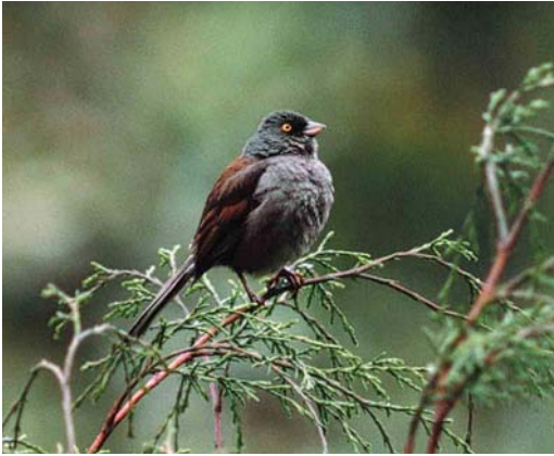
358 Yellow-eyed Junco / Geeloojuncos Junco phaeonotus, Fuentes Georginas, Guatemala, 8 August 1998