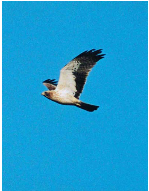
374 Yellow-billed Cuckoo / Geelsnavelkoekoek Coccyzus americanus, Tresco, Scilly, England, October 1999 (cf Dutch Birding 21: 290, 1999) 375 Booted Eagle / Dwergarend Hieraaetus pennatus, pale morph, second-winter, Drift Reservoir, Cornwall, England, November 1999 376 Desert Wheatear / Woestijntapuit Oenanthe deserti, Holkham Bay, Norfolk, England, November 1999