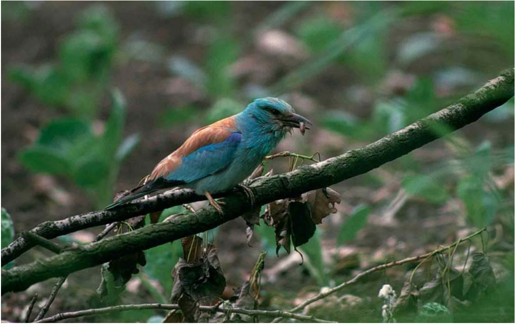
340 European Roller / Scharrelaar Coracias garrulus , Alblasserdam, Zuid-Holland, 19 June 1998 (Hans Gebuis)