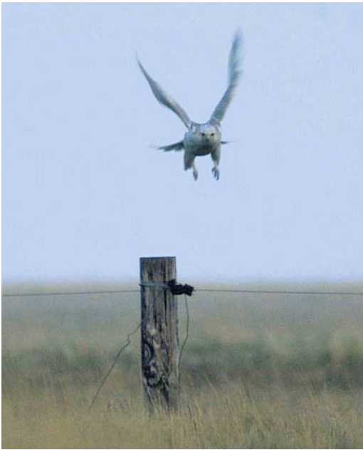
330 Gyr Falcon / Giervalk Falco rusticolus , immature, white morph, Schiermonnikoog, Friesland, 27 March 1998