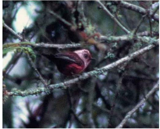
359 Pink-headed Warbler / Rozekopzanger Ergaticus versicolor , Todos Santos, Guatemala, 19 July 1995 (Hein Prinsen)

Motmot Momotus mexicanus , Turquoise-browed Motmot Eumomota superciliosa , White-lored Gnatcatcher Poliophtila albiloris , Streak-backed Oriole Icterus pustulatus and White-throated Magpie-Jay Calocitta formosa .