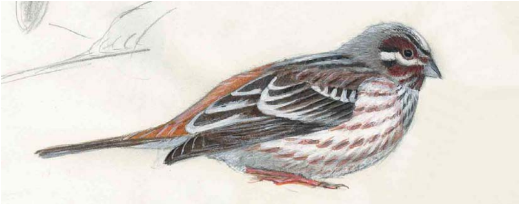
FIGURE 2 Pine Bunting / Witkopgors Emberiza leucocephalos , male, Kooioerdstuifdijk, Ameland, Friesland, March 1998

* Lammergeier / Lammergier Gypaetus barbatus 12-19 May, Den Haag , Zoetermeer , Katwijk and Noordwijk , Zuid-Holland, and Zandvoort , Bloemendaal , Julianadorp , Den Helder , Texel and Broek in Waterland , Noord-Holland, first-summer female, photographed, videoed (Dutch Birding 20: 128, plate 80, 136, plate 98, 1998; van den Berg & Bosman 1999) (identification accepted; identified as a captive-bred bird named 'Gélas' (code BG 279) released in NP Mercantour, Alpes-de-Haute-Provence/Alpes-Maritimes, France, in