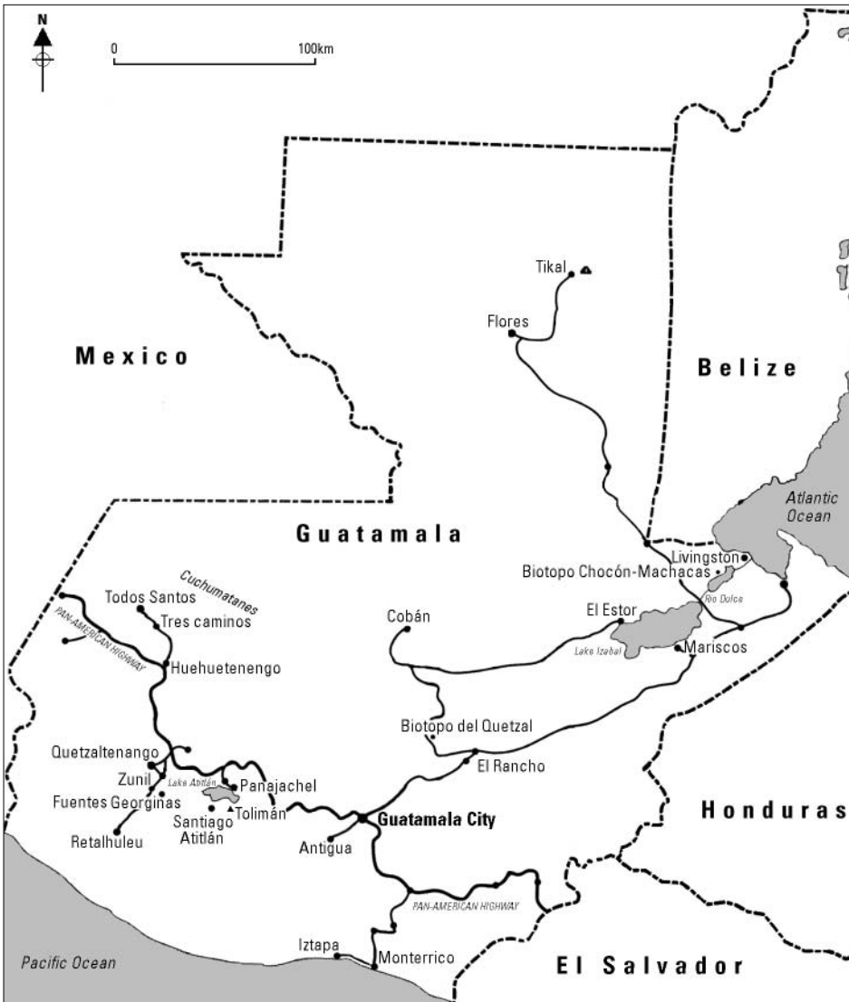
FIGURE 1 Map of Guatemala

easily be reached by bus, although it takes a long and exhausting day to reach Tikal. It takes at least 14 hours from Guatemala City to reach Flores (506 km), south of Tikal, from where it is another hour by bus to Tikal. To save time you can fly from Guatemala City to Flores. A return ticket costs about USD 110 and the flight only takes 25 minutes.