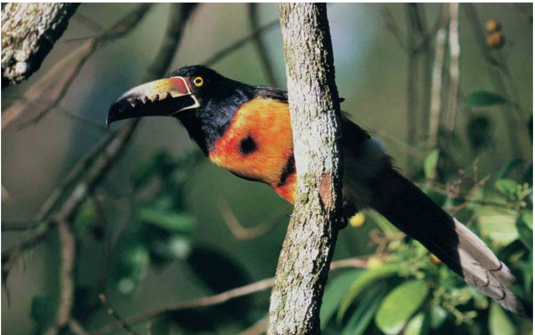
363 Collared Aracari / Halsbandarassari Pteroglossus torquatus , Tikal, Guatemala, 15 August 1998