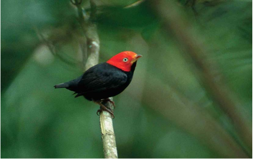
360 Red-capped Manakin / Geelbroekmanakin Pipra mentalis , Tikal, Guatemala, 2 January 1992 (Tom Heijnen)