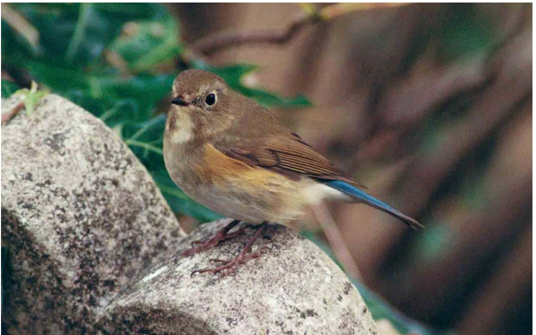
378 Red-flanked Bluetail / Blauwstaart Tarsiger cyanurus , Rame Head, Cornwall, England, October 1999 (cf Dutch Birding 21: 292, 1999)