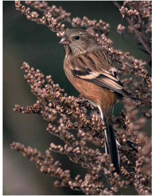
392 Blauwstaart / Red-flanked Bluetail Tarsiger cyanurus , Kroonspolders, Vlieland, Friesland, 11 oktober 1999 (Gerrit Bochem) 393 Langstaartroodmus / Long-tailed Rosefinch Uragus sibiricus , eerste-winter, Hoek van Holland, Zuid-Holland, 2 november 1999 (Peter van Rij) 394 Witkopgors / Pine Bunting Emberiza leucocephalos , eerste-winter vrouwtje, Castricum, Noord-Holland, 8 november 1999 (André J van Loon) 395 Veldrietzanger / Paddyfield Warbler Acrocephalus agricola , adult, Castricum, Noord-Holland, 16 oktober 1999 (André J van Loon)