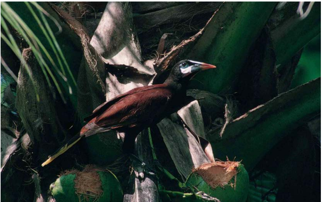
361 Montezuma Oropendola / Montezumaoropendola Gymnostinops montezuma , Costa Rica, January (Kevin Carlson)