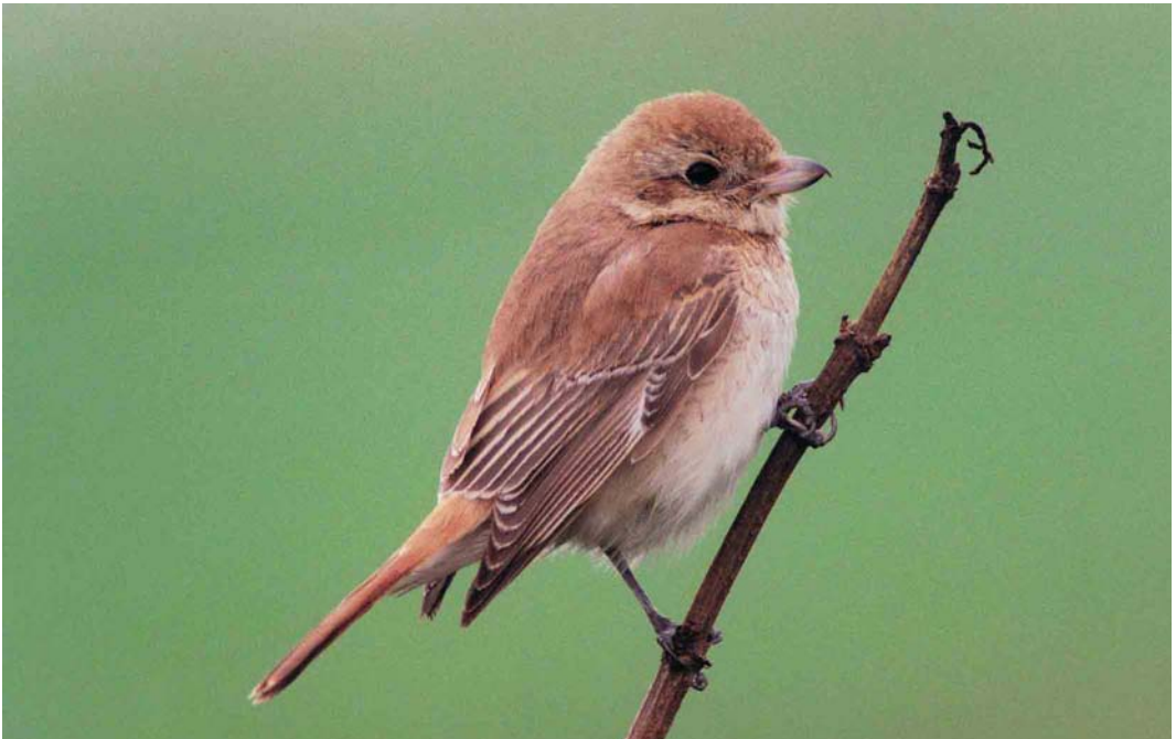
379 isabelline shrike / izabelklauwier Lanius phoenicuroides/speculigerus , first-year, Marsden, South Shields, Tyneside, England, November 1999