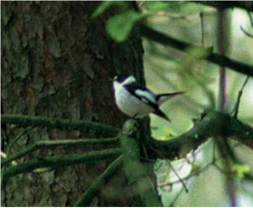
344 Collared Flycatcher / Withalsvliegenvanger Ficedula albicollis , adult male, Doorn, Utrecht, 4 May 1998 (Albert J Dees)