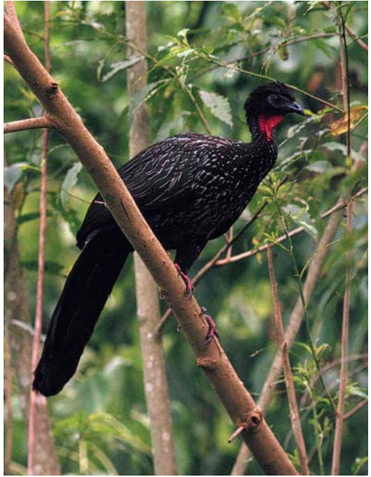
365 Crested Guan / Kuifsjakohoen Penelope purpurascens , Tikal, Guatemala, 28 August 1998 (Marc Guyt)

Now that the political situation has changed and the civil war has finally come to an end, Guatemala is a relaxed and beautiful destination for a birding holiday. It offers the enterprising birdwatcher a wealth of birds, and those with an eye for the cultural heritage of the lost Mayan empire will certainly admit that Guatemala is one of the star attractions of the Neotropics.