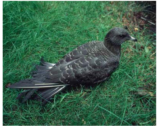
386 Hop / Hoopoe Upupa epops , Texel, Noord-Holland, 7 oktober 1999 ( Jan van Holten ) 387 Steppiekievit / Sociable Lapwing Vanellus gregarius , eerste-winter, Baarlo, IJsselham, Overijssel, 4 oktober 1999 ( Sietze Bernardus ) 388 Waterrietzanger / Aquatic Warbler Acrocephalus paludicola , Meers, Limburg, 7 oktober 1999 ( Ran Schols ) 389 Kleinste Jager / Long-tailed Jaeger Stercorarius longicaudus , eerstejaars, 's-Gravenzande, Zuid-Holland, 10 oktober 1999 ( Rob ter Ellen )

betroffen alleen ringvangsten: op 6 oktober op Schiermonnikoog en op 8 oktober op Texel. Bruine Boszangers P fuscatus lieten zich wél bekijken, namelijk op 22 oktober op Texel, op 3 november bij Westkapelle en op 11 en 12 november op Terschelling. Kleine Vliegenvangers Ficedula parva waren dit najaar goed vertegenwoordigd; op Texel twee op 5 oktober, waarvan één tot 6 oktober bleef, op Terschelling in totaal drie op 5, 8 en 23 oktober, op de Maasvlakte op 12 oktober en op 16 oktober in de Kennemerduinen, Noord-Holland. Buiten de broedlocaties in Limburg werden op acht plekken Taigaboomkruipers Certhia familiaris gezien. Notenkrakers Nucifraga caryocatactes werden gemeld op 5 oktober vliegend langs de Elterberg, op 17 oktober in de Kennemerduinen en op Vlieland en op 7 november bij Malden, Gelderland. Buiten Hoek van Holland, Zuid-Holland, waar er nog steeds minimaal twee aanwezig waren, verbleef tot half