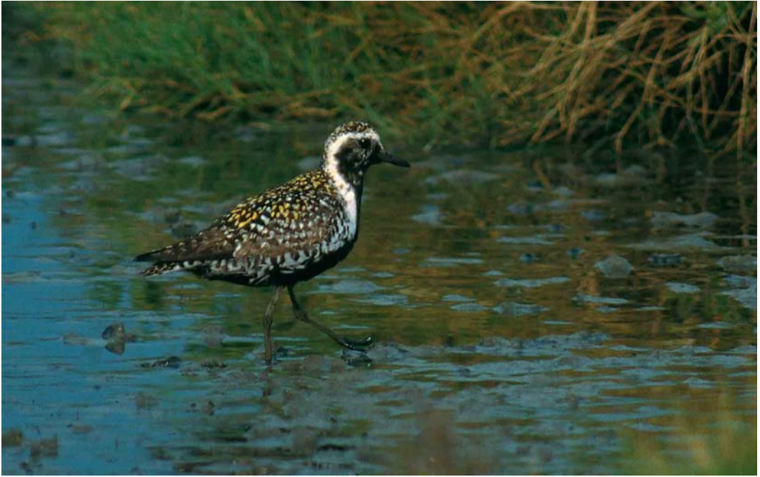
332 Pacific Golden Plover / Aziatische Goudplevier Pluvialis fulva , De Putten, Schoorl, Noord-Holland, 23 July 1998