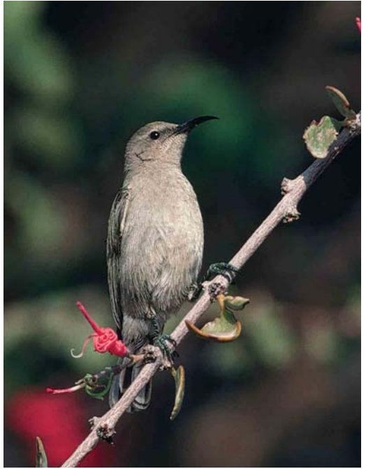
367 Palestine Sunbird / Palestijnse Honingzuiger Nectarinia osea , female, Eilat, Israel, March 1990