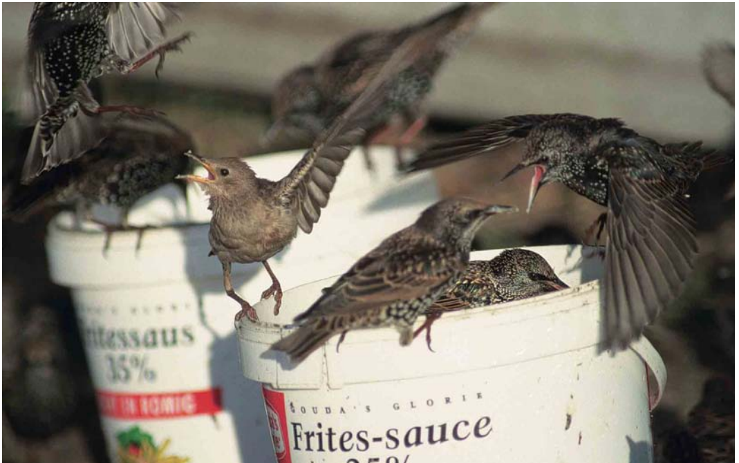
390 Roze Spreeuw / Rose-coloured Starling Sturnus roseus , juveniel, Camperduin, Noord-Holland, 12 oktober 1999