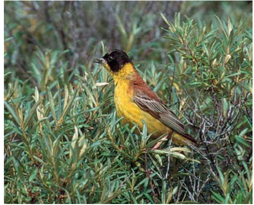
345 Black-headed Bunting / Zwartkopgors Emberiza melanocephala , adult male, Castricum aan Zee, Castricum, Noord-Holland, 21 June 1998 (Jan van Holten)

28 September, juvenile, West-Terschelling, Terschelling , Friesland (P W Logtmeijer, F Dorèl, R Vlek). 1997 10-12 October, Oost-Vlieland, Vlieland , Friesland, two (one on 10 October), juvenile, photographed (G J ter Haar, F Majoer, M Berlijn et al).