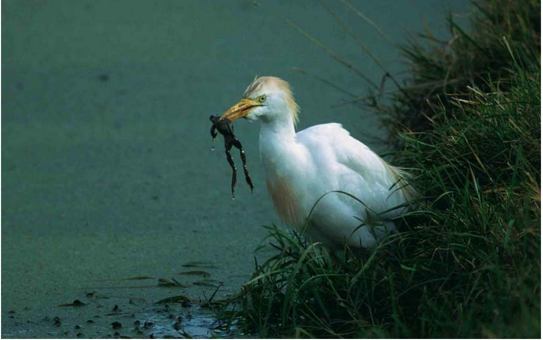
380 Koereiger / Cattle Egret Bubulcus ibis , adult, Nijkerk, Gelderland, 24 oktober 1999