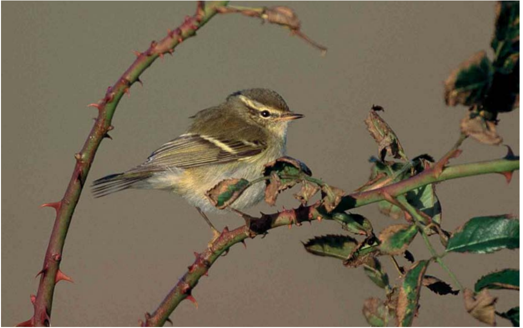
396 Bladkoning / Yellow-browed Warbler Phylloscopus inornatus , Maasvlakte, Zuid-Holland, 16 oktober 1999 (Hans Gebuis)