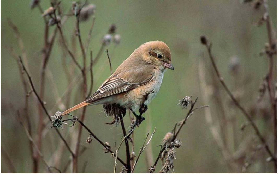
398 vermoedelijke Daurische Klauwier / presumed Daurian Shrike Lanius speculigerus , eerstejaars, Zeebrugge, West-Vlaanderen, 14 november 1999

plaats. In schril contrast was de enkele waarneming in november, op 11 november te Lommel, Antwerpen. Er werden juveniele Zeearenden Haliaeetus albicilla gezien in Het Zwin op 20, 22 en 26 oktober; over Heverlee, Vlaams-Brabant, op 24 oktober; te Willebroek, Antwerpen, op 26 oktober; te Angre op 30 oktober; te Lapscheure, West-Vlaanderen, op 14 november; over Lier-Duffel op 21 november; te Zevergem, Oost-Vlaanderen, op 23 november; in de Uitkerkse Polders op 26 november; en te Escanaffles, Hainaut, op 27 november. Op 17 oktober was er massale trek van Buizerds Buteo buteo . Zo werden maxima geteld van 550 over Turnhout, Antwerpen; 410 over Oud-Turnhout, Antwerpen; en 222 over Lier, Antwerpen. Op 28 november verbleef een juveniele Ruigpootbuizerd B lagopus bij Doel, Oost-Vlaanderen. Er werden in oktober nog 15 Visarenden Pandion haliaetus opgemerkt. De laatste trokken op 1 november over Zonhoven, op 7 november over Tienen, Vlaams-Brabant, en op 12 november over Lier. Een grote valk Falco te Tienen op 3 oktober werd als Sakervalk F cherrug gedetermineerd.