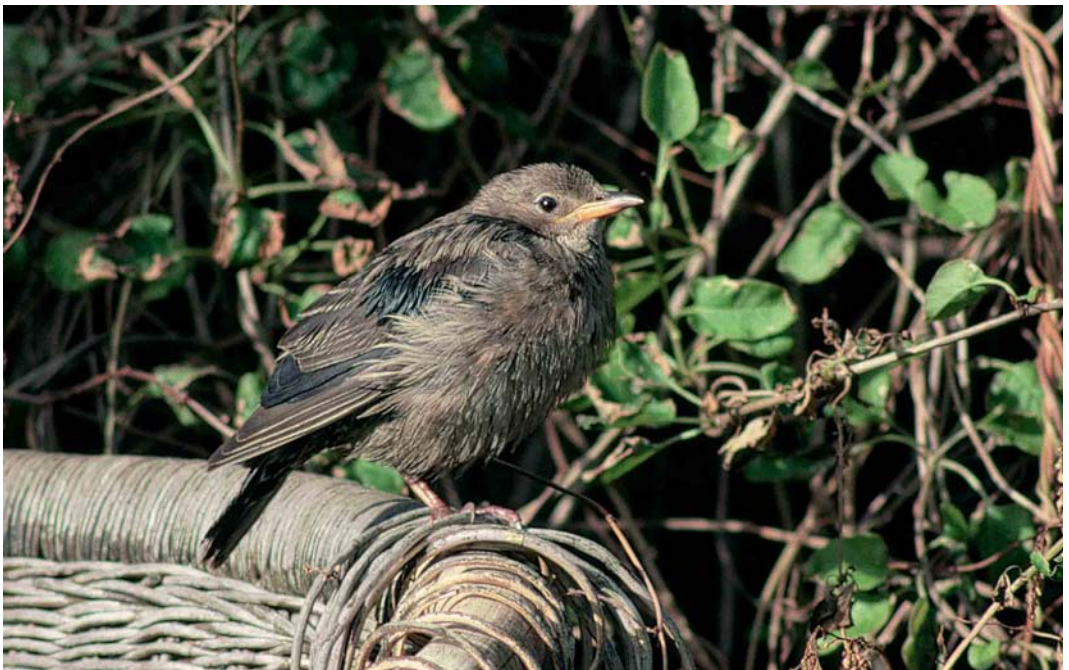
391 Roze Spreeuw / Rose-coloured Starling Sturnus roseus , juveniel ruiend naar eerste-winter, Camperduin, Noord-Holland, 12 november 1999