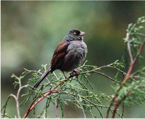
358 Yellow-eyed Junco / Geeloojuncus Junco phaeonotus, Fuentes Georginas, Guatemala, 8 August 1998