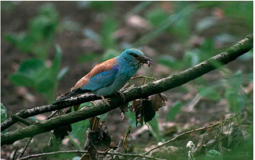
340 European Roller / Scharrelaar Coracias garrulus , Alblasserdam, Zuid-Holland, 19 June 1998 (Hans Gebuis)