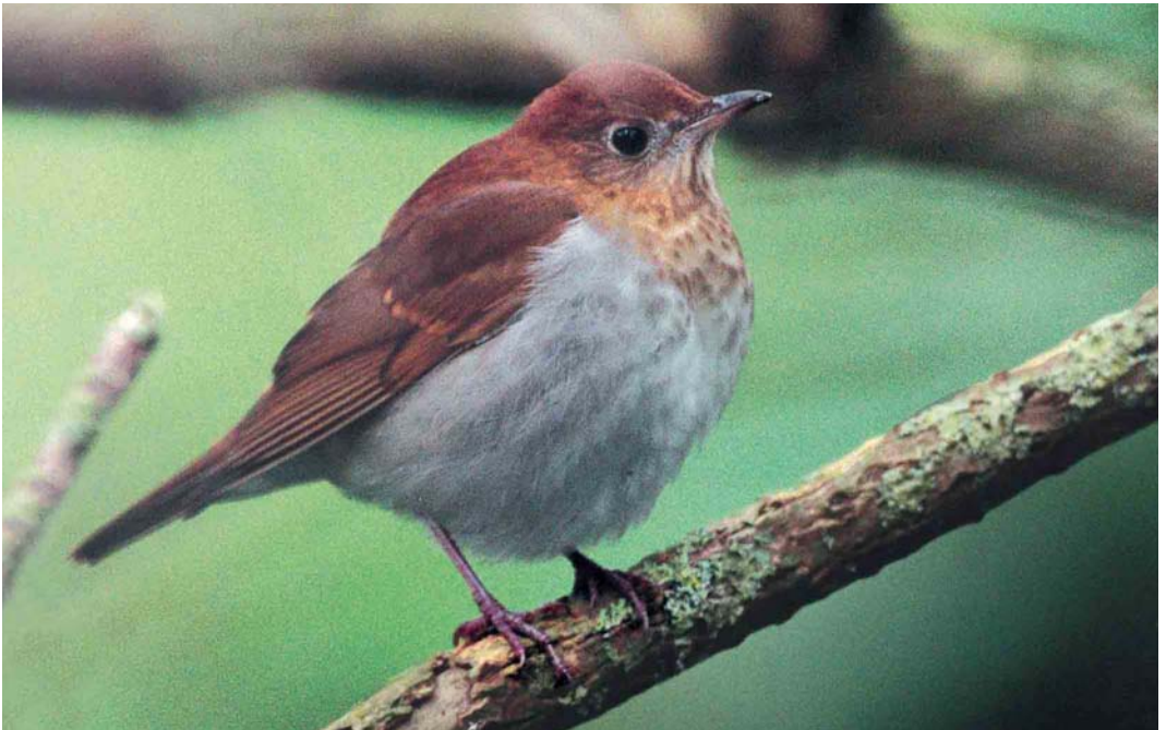
377 Veery / Veery Catharus fuscescens , St Levan, Cornwall, England, 13 October 1999 (Rob Wilson) (cf Dutch Birding 21: 293, 1999)