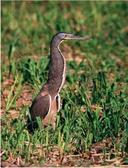
364 Bare-throated Tiger-heron / Mexicaanse Tijger-roerdomp Tigrisoma mexicanum , Tikal, Guatemala, 17 August 1998 (Marc Guyt)