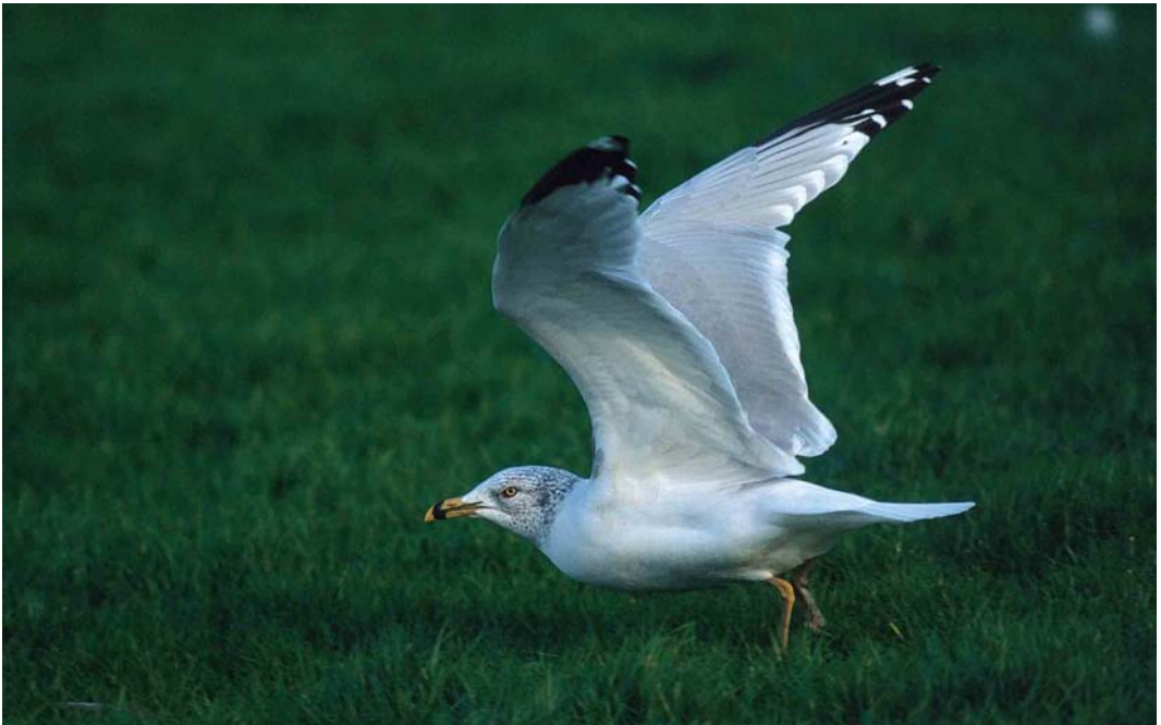
333 Ring-billed Gull / Ringsnavelmeeuw Larus delawarensis , adult male, Goes, Zeeland, 20 January 1998 (Hans Gebuis)