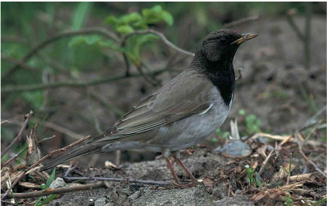
341 Black-throated Thrush / Zwartkeellijster Turdus ruficollis atrogularis , adult male, West-Terschelling, Terschelling, Friesland, 13 April 1998 (Eric Koops)