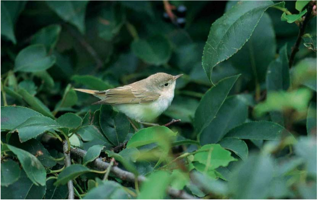
342 Western Bonelli's Warbler / Bergfluit Phylloscopus bonelli , De Cocksdoorp, Texel, Noord-Holland, 15 September 1998