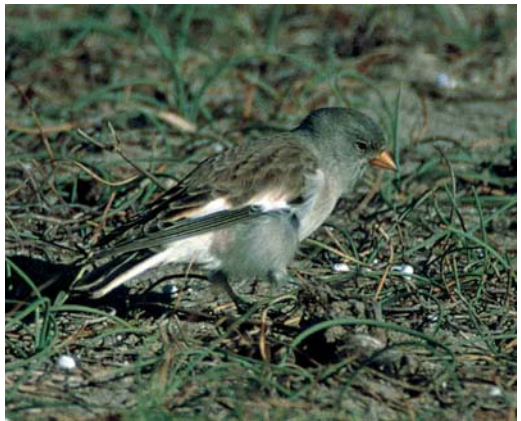
368 Lesser Crested Tern / Bengaalse Stern Sterna bengalensis , Sebkhha Sidi Garous, Jerba, Tunisia, 1 October 1999 ( Niels L M Gilissen ) 369 Chimney Swift / Schoorsteengierzwaluw Chaetura pelagica , St Mary's, Scilly, England, October 1999 ( Rob Wilson ) 370 isabel-line shrike / izabelklauwier Lanius phoenicuroides/speculigerus , Betoncourt-sur-Mance, Haute-Saône, France, 27 October 1999 ( Danny Dujardin ) 371 Ivory Gull / Ivoormeeuw Pagophila eburnea , first-winter, Aldeburgh, Suffolk, England, December 1999 ( David Rimes ) 372 White's Thrush / Goudlijster Zoothera aurea , St Agnes, Scilly, England, October 1999 ( Rob Wilson ) 373 White-winged Snowfinch / Sneeuwvink Montifringilla nivalis , Llobregat delta, Catalonia, Spain, 23 November 1999 ( Ferran Lopez )