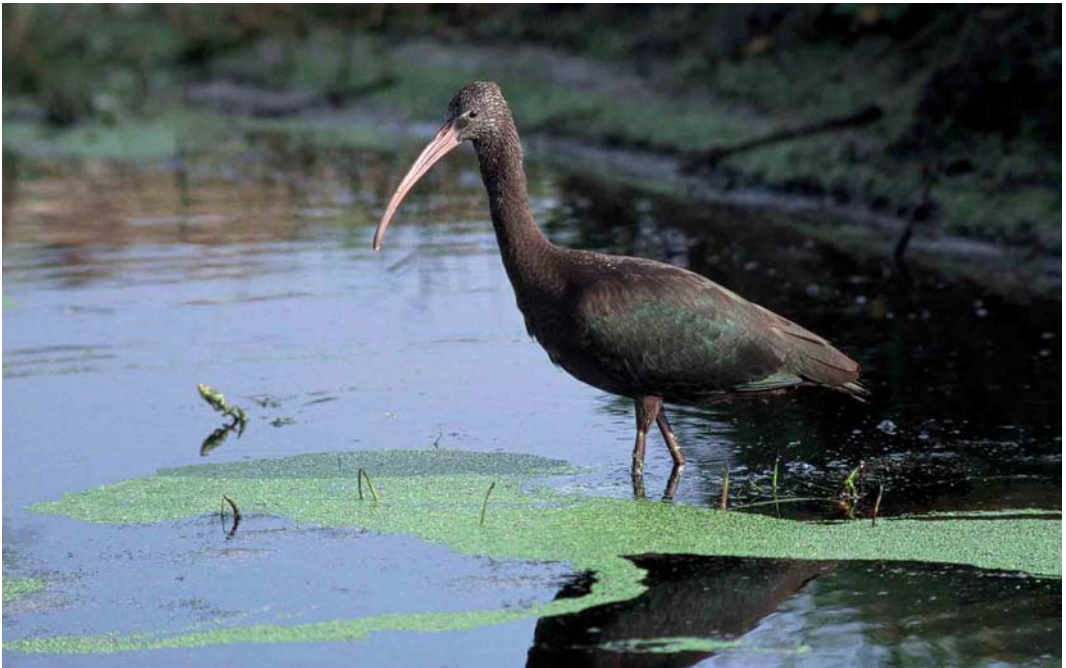
381 Zwarte Ibis / Glossy Ibis Plegadis falcinellus , eerste-winter, Petten, Noord-Holland, 29 oktober 1999