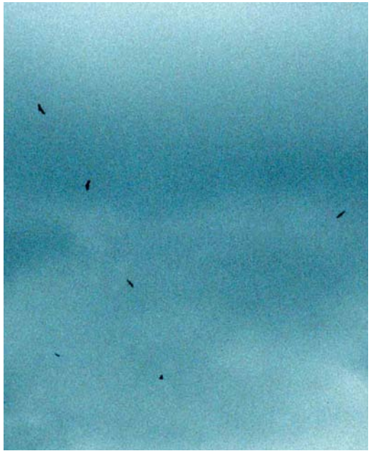
331 Eurasian Griffon Vultures / Vale Gieren Gyps fulvus , Draaibrug, Zeeland, 25 June 1998 (M Renes)