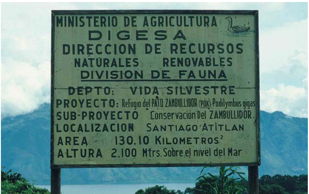
357 Historic information board on Atitlán Grebe Podilymbus gigas , Lake Atitlán, Guatemala, May 1981

A trip through the aforementioned areas takes at least three weeks for reasonable coverage. If there is time left, a visit to some other locations can be recommended. While on the way to Biotopo del Quetzal, a brief visit to the semi-desert area of the Rio Motagua, near El Rancho, may produce Lesser Roadrunner, Russet-crowned