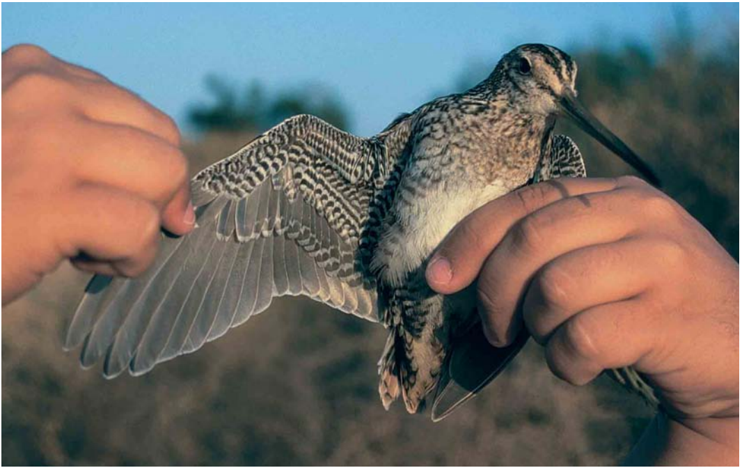
348-349 Pintail Snipe / Stekelstaartsnip Gallinago stenura , Kefar Rupin, Israel, 23 November 1998