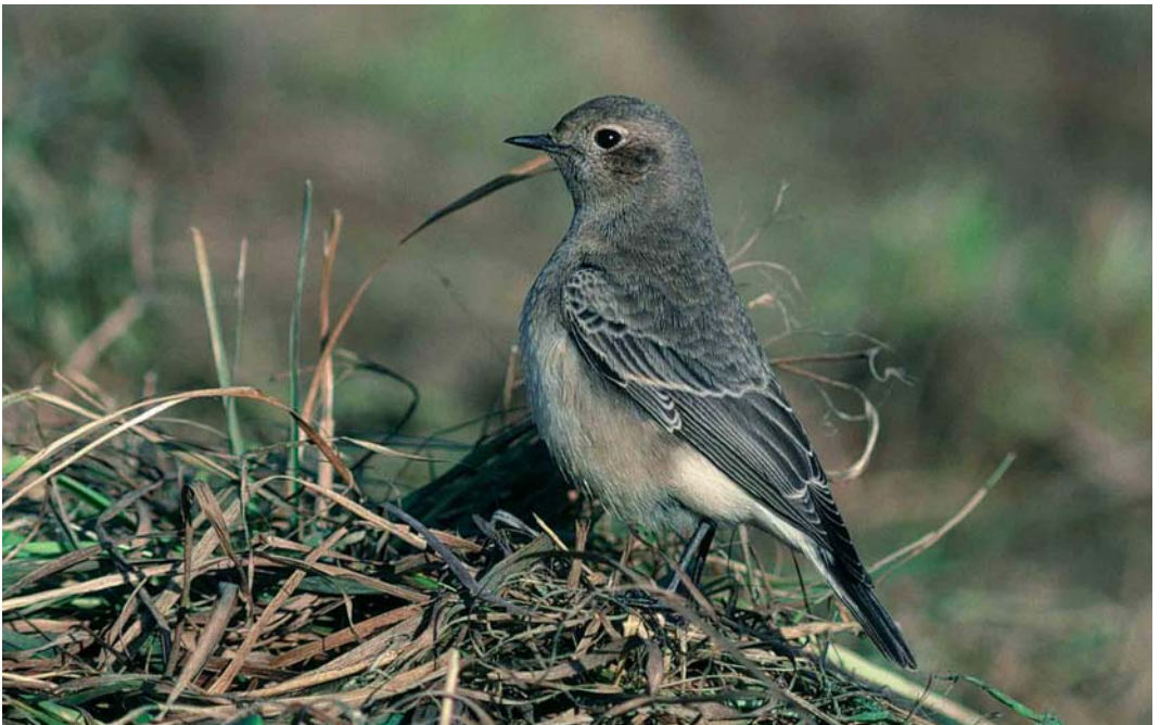
397 Bonte Tapuit / Pied Wheatear Oenanthe pleschanka , eerste-winter vrouwtje, Nederweert, Limburg, 10 november 1999