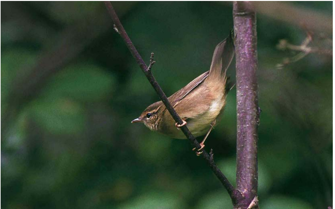
343 Radde's Warbler / Raddes Boszanger Phylloscopus schwarzi , Bomenland, Vlieland, Friesland, 11 October 1998 ( Lucien Davids )