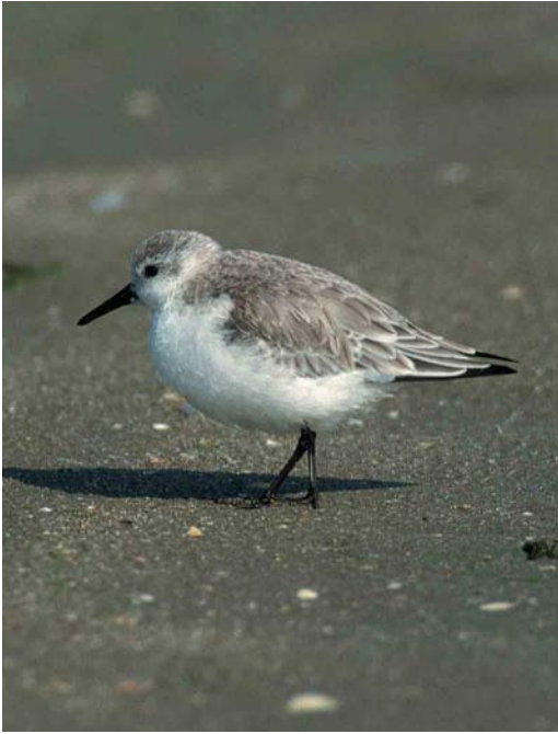
366 Sanderling / Drieteenstrandloper Calidris alba , Ijmuiden, Noord-Holland, Netherlands, 27 March 1999 (Diederik Kok)