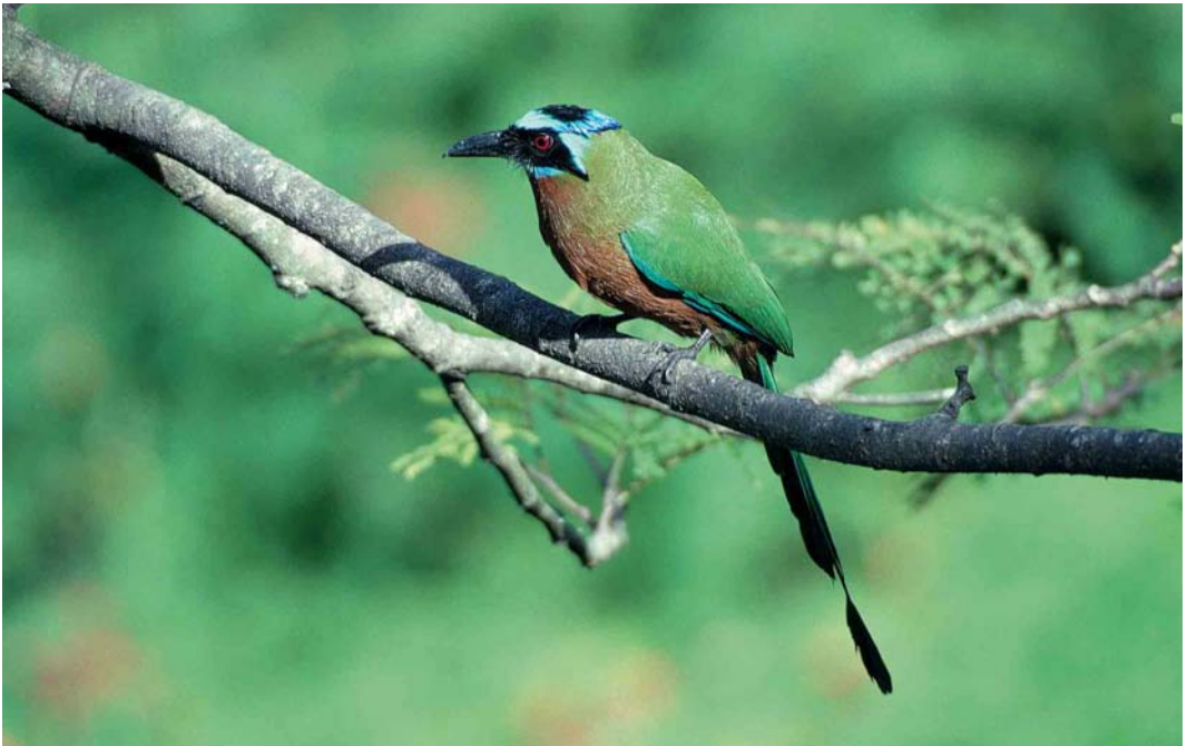
362 Blue-crowned Motmot / Blauwkapmotmot Momotus momota, Costa Rica, January