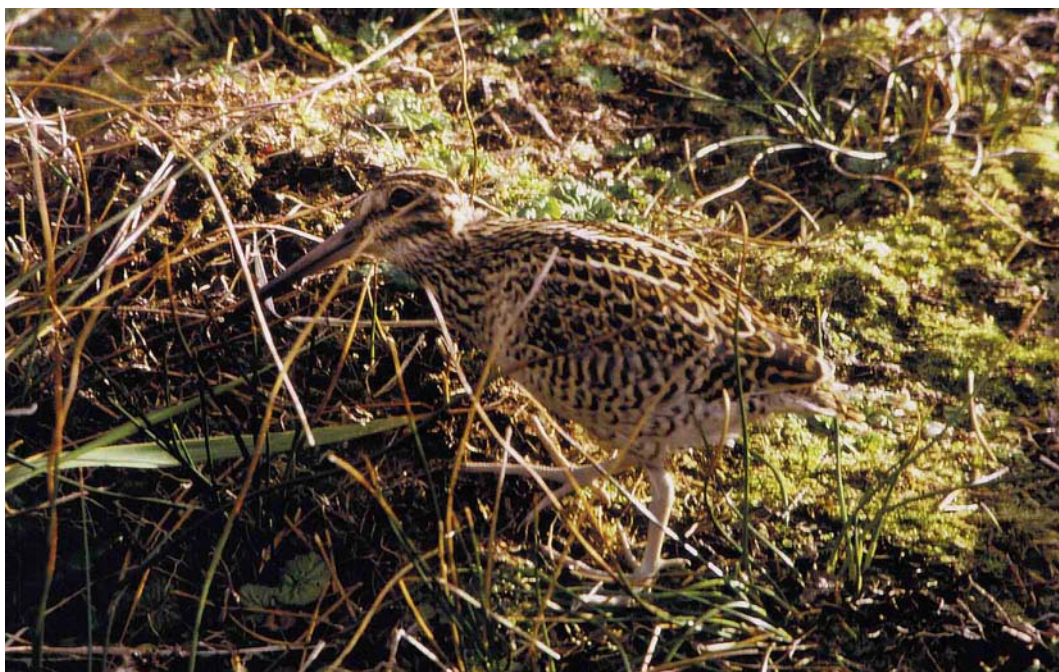
221 Fuegan Snipe / Vuurlandsnip Gallinago stricklandii, Historic Cape Horn, Antártica Chilena, Chile, 8 December 1988