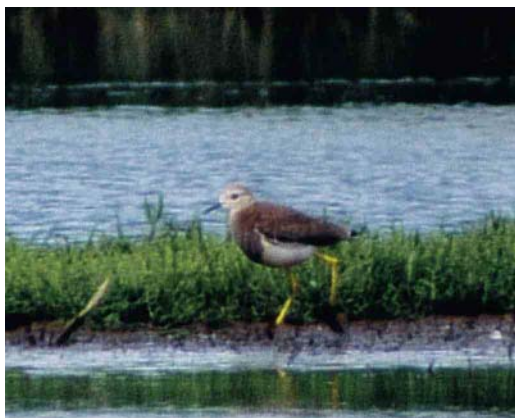
250 Witstaartkieveit / White-tailed Lapwing Vanellus leucurus , adult, Zeebrugge, West-Vlaanderen, 15 juli 1999 (Filip De Ruwe)