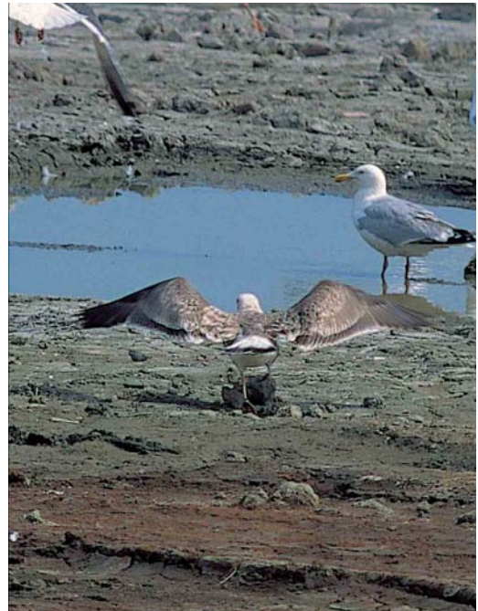
253-254 Heuglins Meeuw / Heuglin's Gull Larus heuglini, eerste-zomer, Groningen, Groningen, 15 juni 1999

lijk om eerste-zomer Kleine Mantelmeeuw of Geelpootmeeuw L. michahellis met zekerheid uitsluiten. Het hardste kenmerk was het ruipatroon: allemaal nieuwe armpennen, zes nieuwe binnenste en vier oude buitenste handpennen en een geheel uit tweede-generatie pennen bestaande staart. De vogel vertoonde bovendien geen actieve rui aan de arm-, hand- of staartpennen. Deze (zogenaamd versnelde) rui past, voor zover bekend, rond half juni alleen op Baltische Mantelmeeuw L. fuscus of Heuglins Meeuw. Voor Baltische Mantelmeeuw was de vogel onder meer veel te licht op de bovendelen.