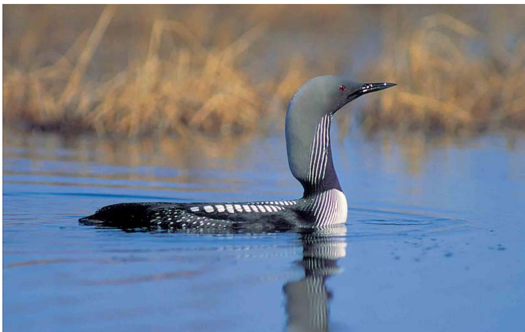
211 Pacific Loon / Pacifische Parelduiker Gavia pacifica , Churchill, Manitoba, Canada, June 1994