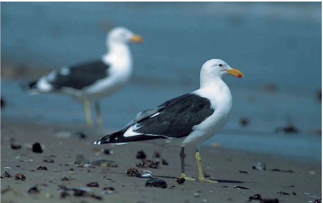
229 Cape Gull / Kaapse Meeuw Larus (dominicanus) vetula , Namibia, July 1997 (Peter Scova Righini)