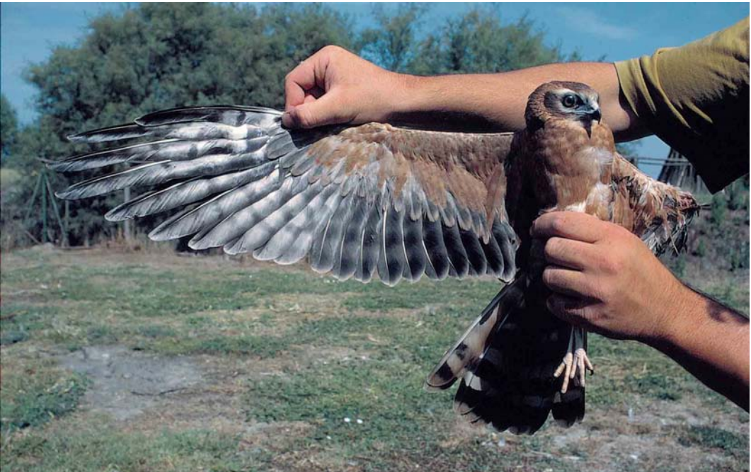
202 Montagu's Harrier / Grauwe Kiekendief Circus pygargus , juvenile male, Valli di Ferrara, Italy, September 1996 (Maurizio Azzolini & Andrea Corso)