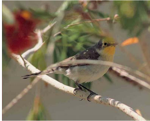
230 Lesser Whitethroat / Sylvia curruca , Kibbutz Lotan, Israel, March 1999 (René van Rossum)

So there is something wrong here. One of the features must not be what it seems to be, but which one? It is indeed the yellow present on throat, breast and head, which is not of the bird itself but actually caused by pollen from the flowers the bird has been foraging on! Once the confusion caused by the yellow is taken away, the pieces of the puzzle fall into place. Cold brown upperparts with brown edges to the wing-coverts, tertials and secondaries, whitish underparts, black legs, a dark, rather stubby bill, a blue-grey tinge to the head and a pale eye-ring