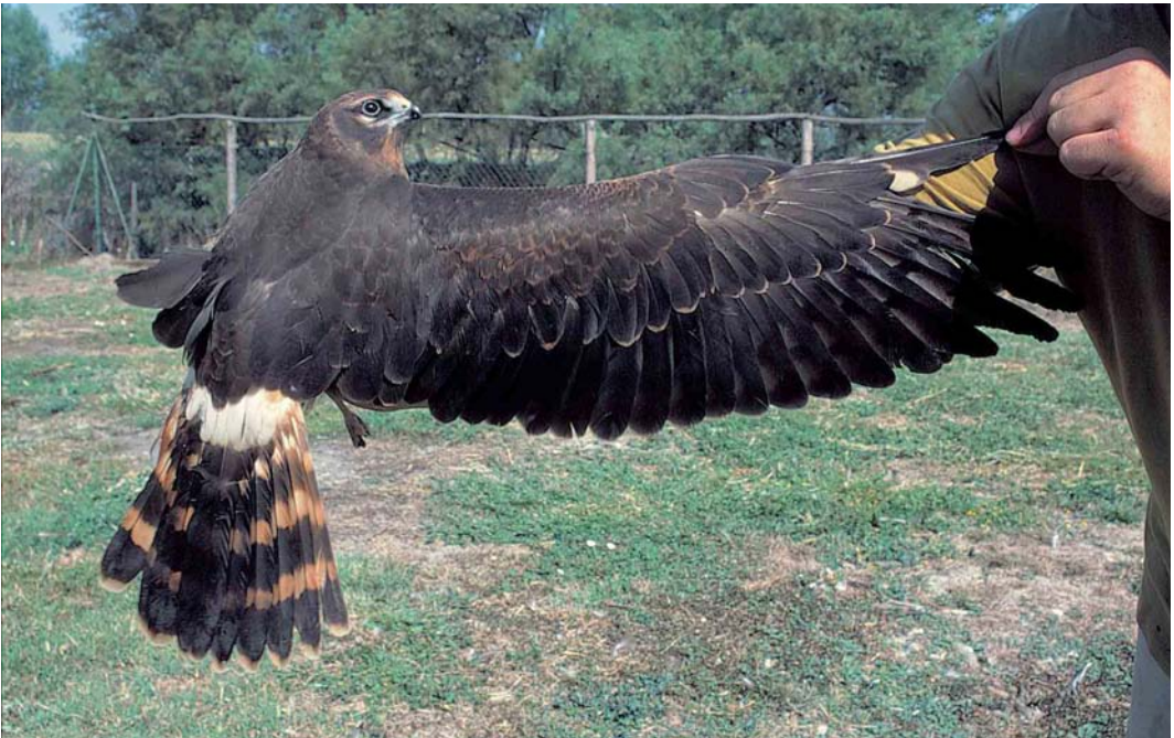
199 Montagu's Harrier / Grauwe Kiekendief Circus pygargus , juvenile female, Valli di Ferrara, Italy, September 1996 (Maurizio Azzolini & Andrea Corso)