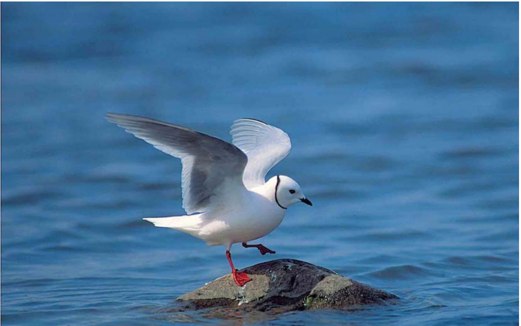
217 Ross's Gull / Ross' Meeuw Rhodostethia rosea , Churchill, Manitoba, Canada, June 1994