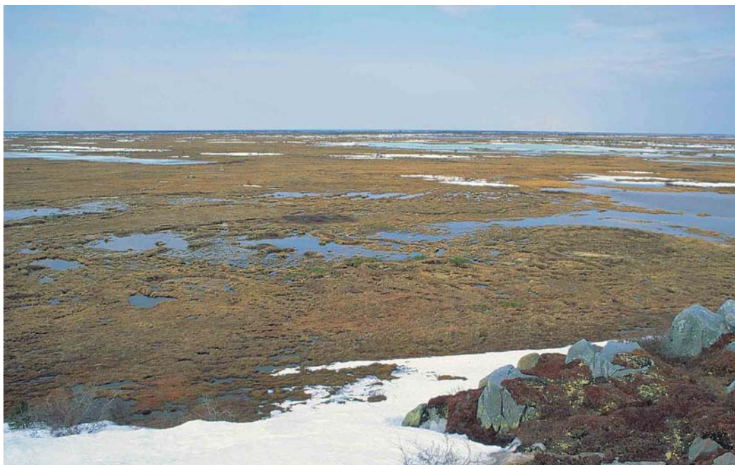
210 Tundra landscape near Churchill, Manitoba, Canada, June 1994 ( Chris Schenk )