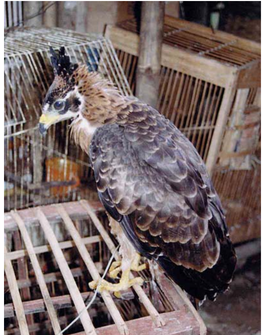
203-204 Javan Crested Honey Buzzard / Javaanse Wespendif Pernis ptilorhyncus ptilorhyncus , juvenile, roadside bird market between Pelabuhanratu and Bogor, West Java, Indonesia, 16 October 1995 (Rona Dennis) 205 Javan Crested Honey Buzzard / Javaanse Wespendif Pernis ptilorhyncus ptilorhyncus , adult, Taman Safari Zoo, Cisarua, West Java, Indonesia, 10 December 1994 (Bas van Balen) 206 Javan Hawk-eagle / Javaanse Havikarend Spizaetus bartelsi , immature, Taman Safari Zoo, Cisarua, West Java, Indonesia, 10 December 1994 (Bas van Balen)