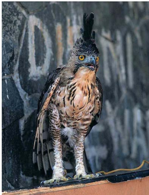
207 Javan Hawk-eagle / Javaanse Havikarend Spizaetus bartelsi , adult, Taman Safari Zoo, Cisarua, West Java, Indonesia, 10 December 1994 ( Bas van Balen ) 208-209 Javan Hawk-eagle / Javaanse Havikarend Spizaetus bartelsi , adult, bird market, Jakarta, Java, Indonesia, 5 July 1989 ( Arnoud B van den Berg )