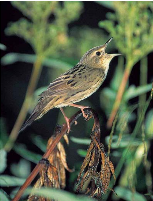
240 Lanceolated Warbler / Kleine Sprinkhaanzanger Locustella lanceolata , Pielavesi, Finland, 18 July 1999 (Henry Lehto)