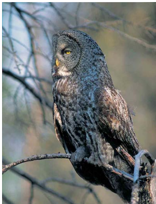
218 American Hawk Owl / Amerikaanse Sperweruil Surnia ulula caparoch , Churchill, Manitoba, Canada, June 1994 (Chris Schenk) 219 Great Grey Owl / Laplanduil Strix nebulosa , Churchill, Manitoba, Canada, June 1994 (Chris Schenk) 220 Bonaparte's Gull / Kleine Kokmeeuw Larus philadelphia , Churchill, Manitoba, Canada, June 1996 (Chris Schenk)