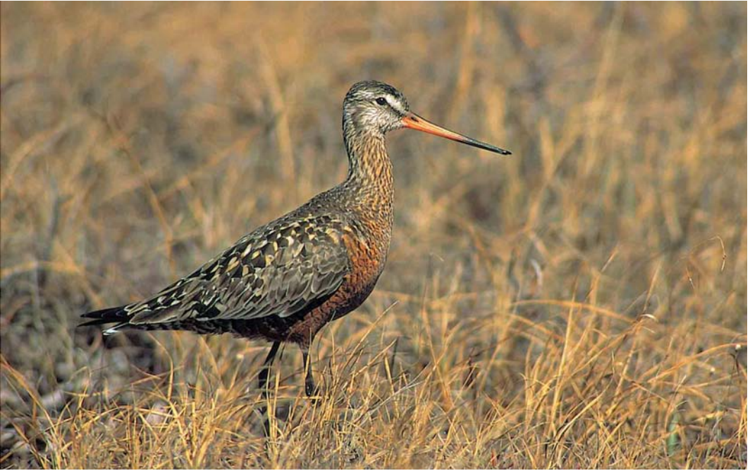
212 Hudsonian Godwit / Rode Grutto Limosa haemastica, Churchill, Manitoba, Canada, June 1996