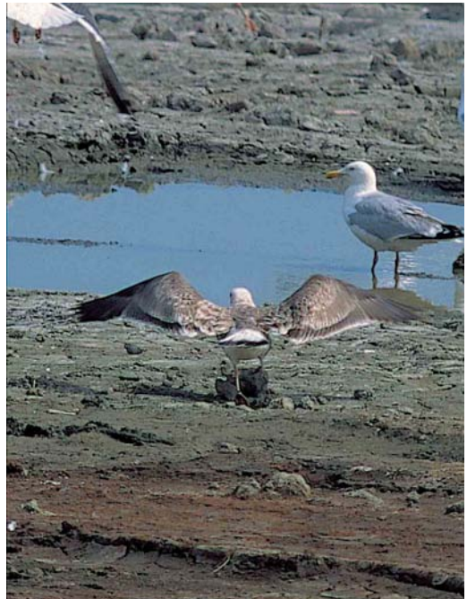
253-254 Heuglins Meeuw / Heuglin's Gull Larus heuglini, eerste-zomer, Groningen, Groningen, 15 juni 1999

lijk om eerste-zomer Kleine Mantelmeeuw of Geelpootmeeuw L. michahellis met zekerheid uitsluiten. Het hardste kenmerk was het ruipatroon: allemaal nieuwe armpennen, zes nieuwe binnenste en vier oude buitenste handpennen en een geheel uit tweede-generatie pennen bestaande staart. De vogel vertoonde bovendien geen actieve rui aan de arm-, hand- of staartpennen. Deze (zogenaamd versnelde) rui past, voor zover bekend, rond half juni alleen op Baltische Mantelmeeuw L. fuscus of Heuglins Meeuw. Voor Baltische Mantelmeeuw was de vogel onder meer veel te licht op de bovendelen.