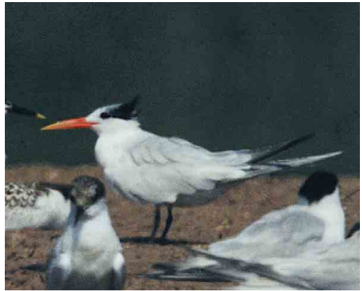
236 Lesser Yellowlegs / Kleine Geelpootruiter Tringa flavipes , adult, with Marsh Sandpiper / Poelruiter T stagnatilis , adult, and Common Snipe / Watersnip Gallinago gallinago , Lauwersmeer, Groningen, Netherlands, 7 August 1999 (Jan van Holten) 237 Black-winged Pratincole / Steppeworkstaartplevier Pratincola nordmanni , adult summer, Norfolk, England, July 1999 (Rob Wilson) 238 Black-headed Wagtail / Balkankwikstaart Motacilla feldegg , male, Mayland, Essex, England, June 1999 (Rob Wilson) 239 Elegant Tern / Sierlijke Stern Sterna elegans , adult, with Sandwich Terns / Grote Sterns S sandvicensis , Lady Island's Lake, Wexford, Ireland, July 1999 (Rob Wilson)

S dougallii for the Cape Verde Islands concerned a bird in exhausted condition that could be caught by hand on the beach at Santa Maria, Sal, on 14 April 1998; it was released after photographs were taken. In England, a second-calendar-year Forster's Tern S forsteri remained from 29 May to at least 22 August at Tollesbury Fleet, Kent. The first Bridled Tern S anaethetus for Sweden was an adult at Söskär, Orust, Bohuslän, from 30 June to 4 July and again on 9-10 July. The second for Denmark was an adult at Langli and Herting Lob, Esbjerg, Vestjylland, from 28 July to 4 August. (A previous report from Sweden was on 30 June near Göteborg; in Germany, one or two singles were seen during 1-4 June in northern Niedersachsen and on Helgoland, Schleswig-Holstein; cf Dutch Birding 21: 176, 1999; Limicola 13: 141, 1999). In Cyprus, a Tawny Owl Strix