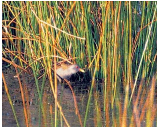
245 Kleine Vliegenvanger / Red-breasted Flycatcher Ficedula parva , onvolwassen mannetje, Epen, Limburg, juni 1999 246 Bonapartes Strandloper / White-rumped Sandpiper Calidris fuscicollis , adult, Den Oever, Noord-Holland, 5 augustus 1999 247 Witwangsterns / Whiskered Terns Chlidonias hybridus met jong, Soerendonks Goor, Noord-Brabant, 3 juli 1999 248 Klein Waterhoen / Little Crane Porzana parva , mannetje, Kampina, Noord-Brabant, 14 juni 1999

waren er de gehele periode in de Oostvaardersplassen en omgeving (maximaal vier), op 11 juni bij Wageningen, Gelderland, op 18 en 19 juni bij Alphen aan den Rijn, op 27 juni bij Bleskensgraaf, Zuid-Holland, op 4 juli bij Hazerswoude, Zuid-Holland, en op 24 juli bij Gouderak, Zuid-Holland. In totaal werden 19 Zwarte Ooievaars Ciconia nigra waargenomen, waarvan het merendeel in juli. De grootste groep Ooievaars C. ciconia die gemeld werd omvatte 26 exemplaren en vloog op 29 juli over Kampen, Overijssel. Zomerse Zwarte Vrouwen Milvus migrans werden gezien op 3 juni bij Gulpen, Limburg, op 5 juni in de Marnewaard, Groningen, op 13 juni over de Kampina en op 31 juli langs Huisduinen, Noord-Holland. Tot de eerste dagen van juni werden nog enkele Rode Vrouwen M. milvus vastgesteld en vanaf eind juni alweer 10. Ook dit jaar liet de Lammergier Gypaetus barbatus niet verstek gaan; op 25 juli vloog