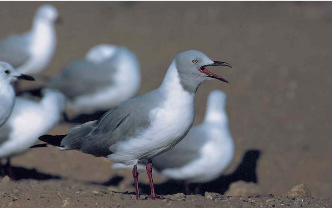
228 African Grey-headed Gull / Afrikaanse Grijskopmeeuw Larus (cirrocephalus) poiocephalus , Namibia, July 1997 (Peter Scova Righini)