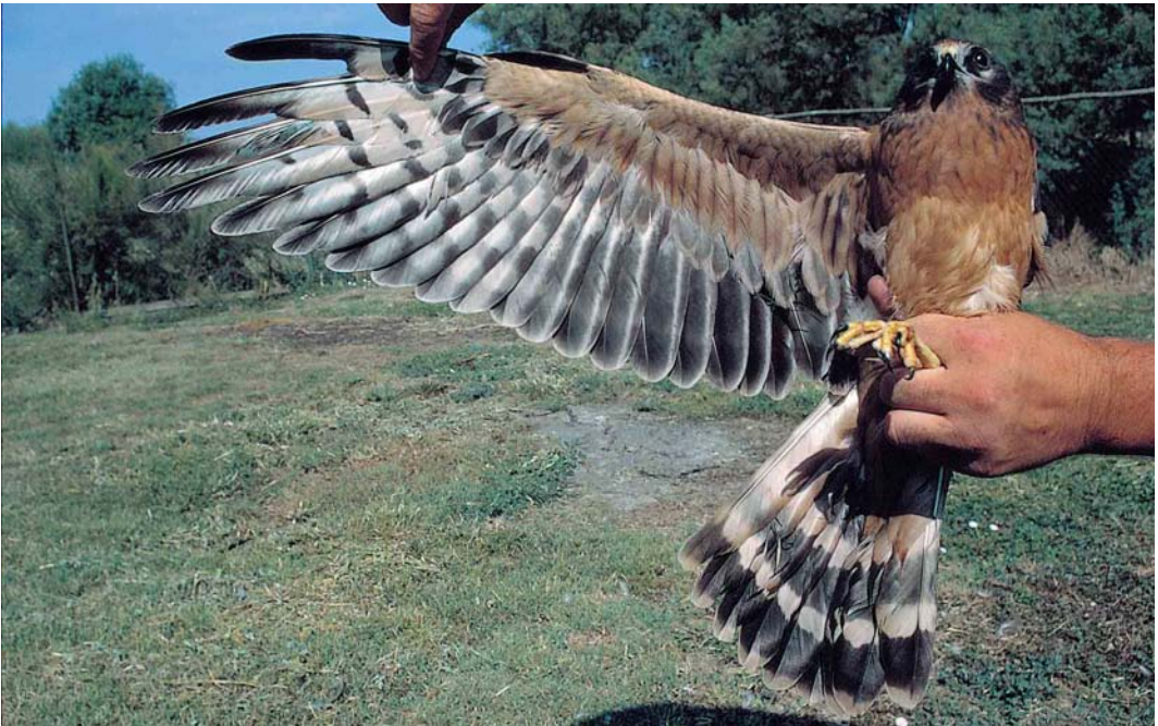
200 Montagu's Harrier / Grauwe Kiekendief Circus pygargus , juvenile female, Valli di Ferrara, Italy, September 1996 (Maurizio Azzolini & Andrea Corso)