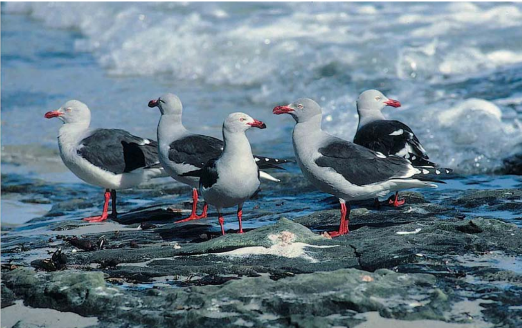
222 Dolphin Gulls / Dolfijnmeeuwen Larus scoresbii , Falkland Islands, December 1990

Voous' list and other contemporary classifications of gulls were not based on the phylogenetic methods that later became dominant in avian systematics. The recognition of several monotypic or otherwise small genera was based on the presence of unique characters (such as a collar or elongated central tail-feathers) and differences that were judged to be 'important' in these species (such as a forked tail or a strong and thick bill). However, groupings resulting from this procedure do not necessarily represent natural, monophyletic units. Wolters (1971) was among the first ornithologists to recognize the problems of placing some distinctive species in monotypic