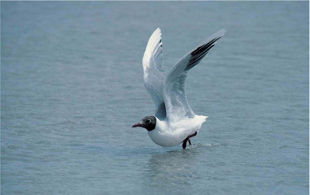
223 Brown-hooded Gull / Patagonische Kokmeeuw Larus maculipennis , Falkland Islands, December 1990 (René Pop)