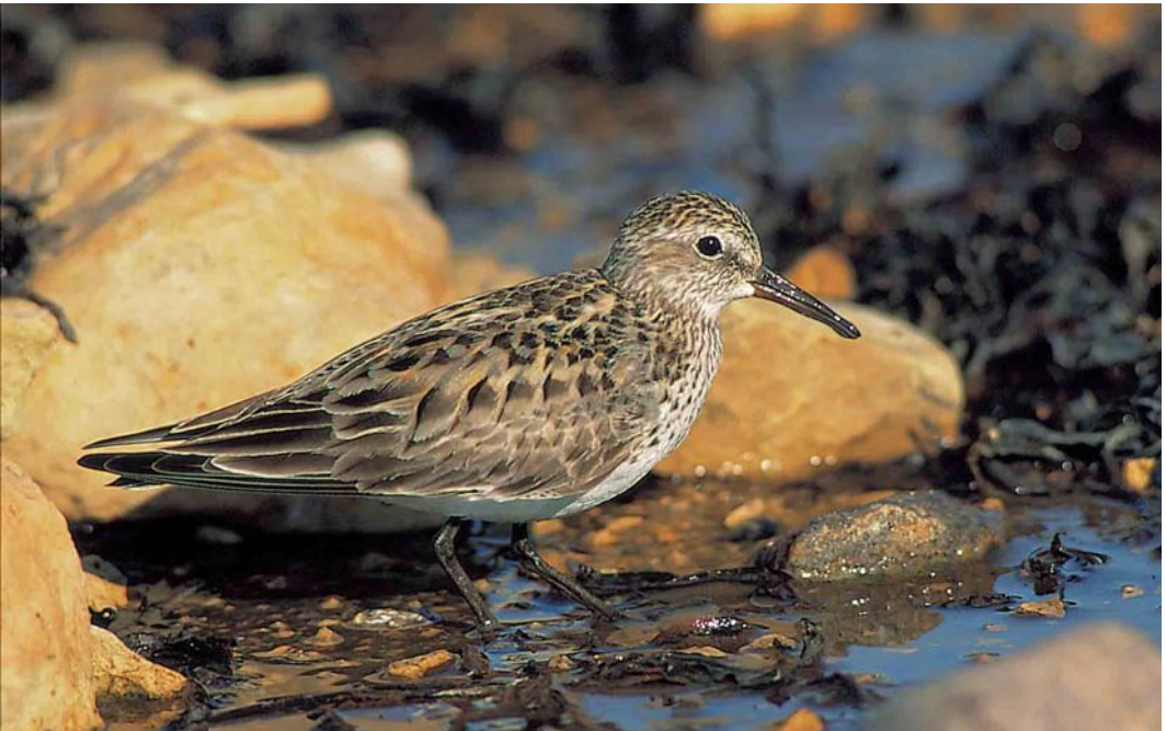
213 White-rumped Sandpiper / Bonapartes Strandloper Calidris fuscicollis , Churchill, Manitoba, Canada, June 1996 (Chris Schenk)