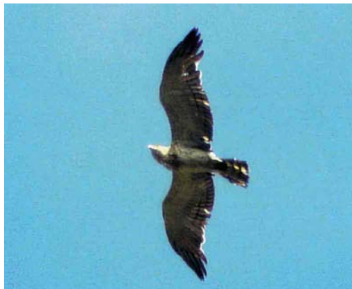
251 Slangenarend / Short-toed Eagle Circaetus gallicus , Ben-Ahin, Liège, 2 juli 1999 (Johan Buckens)

Harelbeke op 30 juli. Op acht waarnemingsplaatsen werden in totaal 25 Ooievaars Ciconia geteld, met als maximum zes over Dessel-Retie, Antwerpen, op 26 juli. Er waren waarnemingen van Rode Wouwen Milvus milvus te Brecht (1 juni); te Bredene (30 juli); te Kuringen-Hasselt, Limburg (31 juli); te Muizen, Antwerpen (29 juli); en in de Uitkerkse Polders (31 juli). Op 23 juni vloog een (of de) Slangenarend Circaetus gallicus over het Schietveld te Brecht, op 30 juni verbleef hij op het Klein Schietveld te Brasschaat, Antwerpen, en op 9 en 10 juli verscheen hij weer kortstondig te Brecht. Verrassend genoeg was in de Steengroeve te Ben-Ahin, Liège, van 6 juni tot 11 juli een zeer bleek exemplaar aanwezig dat vaak zeer goed (en ook in zit) te zien was. Nog een andere pleisterde vermoedelijk reeds vanaf mei te Helchteren-Meeuwen, Limburg, en was daar in elk geval op 11 juli nog present. Op 17 juni werd te Rulles, Luxembourg, een laag overvliegende, lichte Dwergarend Hieraetus pennatus waargenomen. Telkens één Visarend Pandion haliaetus werd gemeld te Belzele, Evergem, Oost-Vlaanderen, op 5 juni; te Willebroek op 10 juni en 27 juli; over de Kalkense Meersen, Oost-Vlaanderen, op 15 juni; en te Neerpelt, Limburg, op 10 juli. Eerste-zomer mannetjes Roodpootvalk Falco vespertinus vlogen op 1 juni over de Kalmthoutse Heide, Antwerpen, op 26 juni over Bredene, en op 10 juli over Hensies, Hainaut.