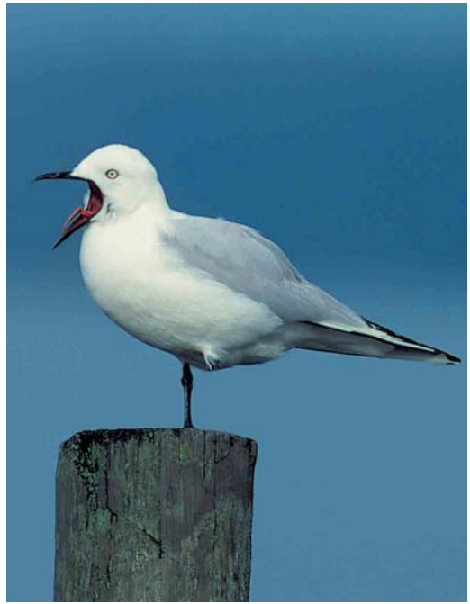
225 Red-billed Gull / Roodsnavelmeeuw Larus scopulinus , New Zealand, January 1997 (Theo Roersma) 226 Black-billed Gull / Zwartsnavelmeeuw Larus bulleri , New Zealand, January 1997 (Theo Roersma) 227 King Gull / Hartlaubs Meeuw Larus hartlaubii , Namibia, 30 March 1999 (Arnoud B van den Berg)