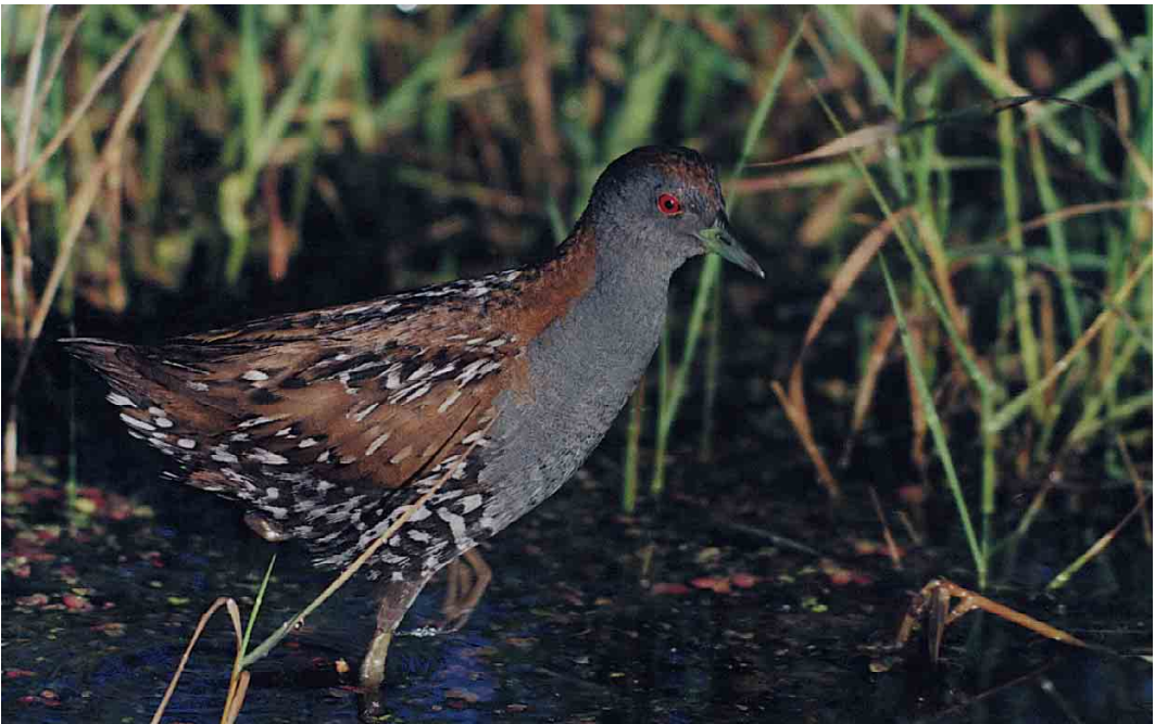
235 Baillon's Crake / Kleinst Waterhoen Porzana pusilla , Grove Ferry, Kent, England, July 1999 (Rob Wilson)