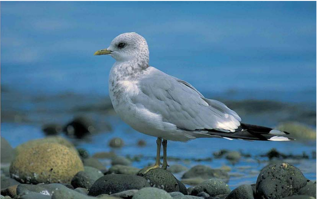
224 Short-billed Gull / Amerikaanse Stormmeeuw Larus (canus) brachyrhynchus , Vancouver Island, Canada, 17 September 1998 (René Pop)