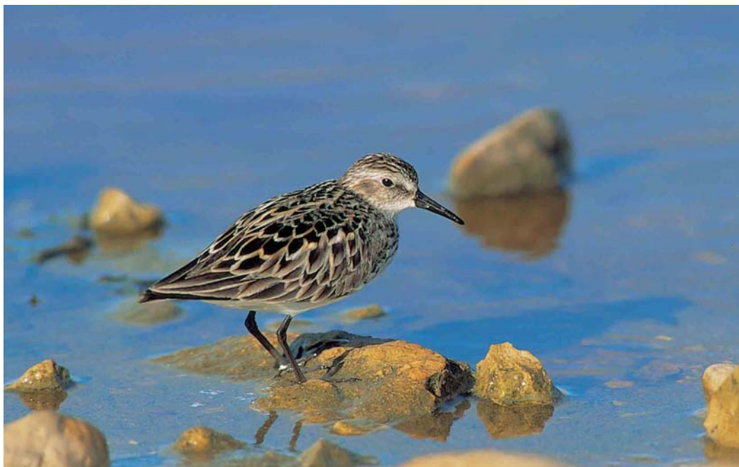
214 Semipalmated Sandpiper / Grijze Strandloper Calidris pusilla , Churchill, Manitoba, Canada, June 1996 (Chris Schenk)