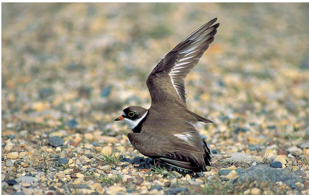
215 Semipalmated Plover / Amerikaanse Bontbekplevier Charadrius semipalmatus , Churchill, Manitoba, Canada, June 1994 (Chris Schenk)