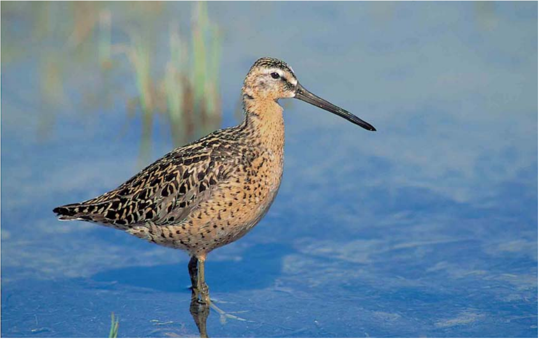
216 Short-billed Dowitcher / Kleine Grijze Snip Limnodromus griseus , Churchill, Manitoba, Canada, June 1996 (Chris Schenk)