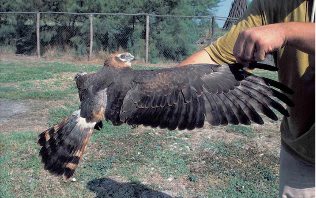
201 Montagu's Harrier / Grauwe Kiekendief Circus pygargus , juvenile male, Valli di Ferrara, Italy, September 1996 (Maurizio Azzolini & Andrea Corso)