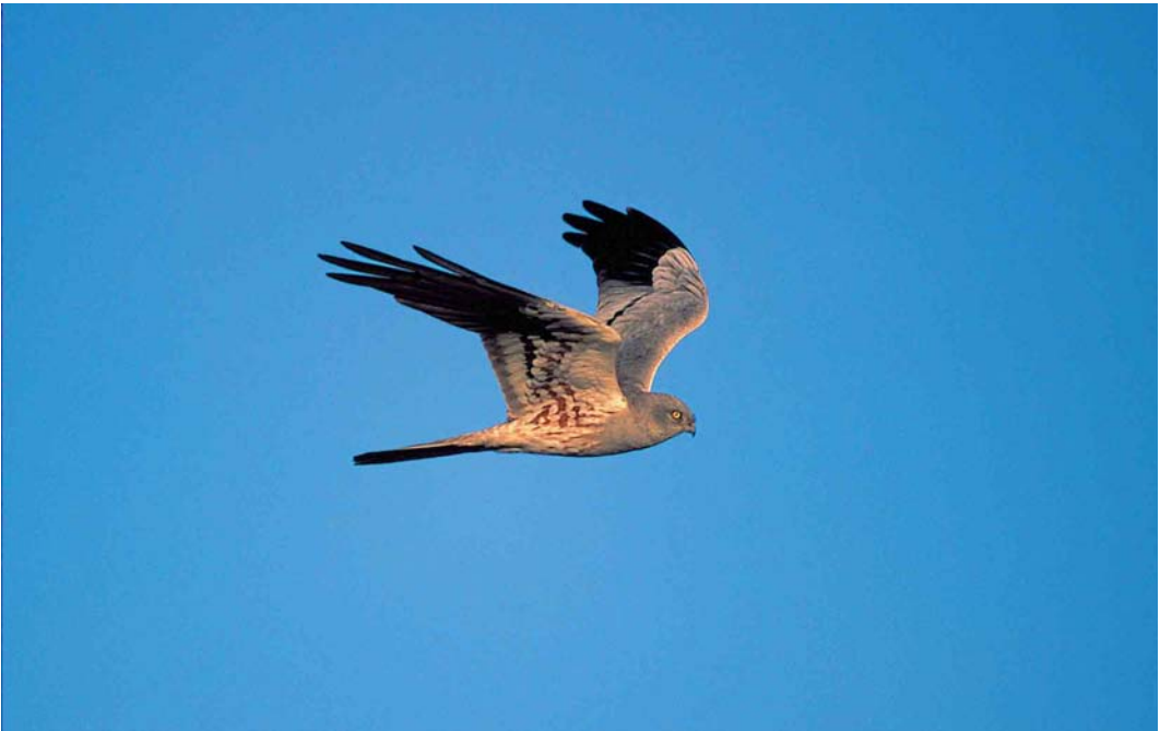
242 Grauwe Kiekendief / Montagu's Harrier Circus pygargus , mannetje, Flevoland, mei 1999 243 Koereiger / Cattle Egret Bubulcus ibis , adult, Meers, Limburg, 10 juli 1999 244 Baardgrasmus / Subalpine Warbler Sylvia cantillans , mannetje, Berkheide, Wassenaar, Zuid-Holland, 18 juli 1999