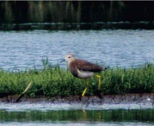
250 Witstaartkievit / White-tailed Lapwing Vanellus leucurus , adult, Zeebrugge, West-Vlaanderen, 15 juli 1999