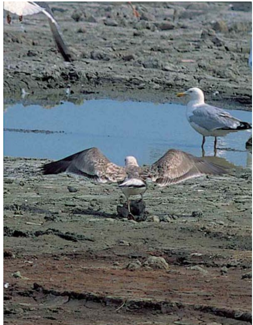
253-254 Heuglins Meeuw / Heuglin's Gull Larus heuglini, eerste-zomer, Groningen, Groningen, 15 juni 1999

lijk om eerste-zomer Kleine Mantelmeeuw of Geelpootmeeuw L. michahellis met zekerheid uitsluiten. Het hardste kenmerk was het ruipatroon: allemaal nieuwe armpennen, zes nieuwe binnenste en vier oude buitenste handpennen en een geheel uit tweede-generatie pennen bestaande staart. De vogel vertoonde bovendien geen actieve rui aan de arm-, hand- of staartpennen. Deze (zogenaamd versnelde) rui past, voor zover bekend, rond half juni alleen op Baltische Mantelmeeuw L. fuscus of Heuglins Meeuw. Voor Baltische Mantelmeeuw was de vogel onder meer veel te licht op de bovendelen.