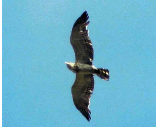
251 Slangenarend / Short-toed Eagle Circaetus gallicus , Ben-Ahin, Liège, 2 juli 1999 (Johan Buckens)

Harelbeke op 30 juli. Op acht waarnemingsplaatsen werden in totaal 25 Ooievaars Ciconia geteld, met als maximum zes over Dessel-Retie, Antwerpen, op 26 juli. Er waren waarnemingen van Rode Wouwen Milvus milvus te Brecht (1 juni); te Bredene (30 juli); te Kuringen-Hasselt, Limburg (31 juli); te Muizen, Antwerpen (29 juli); en in de Uitkerkse Polders (31 juli). Op 23 juni vloog een (of de) Slangenarend Circaetus gallicus over het Schietveld te Brecht, op 30 juni verbleef hij op het Klein Schietveld te Brasschaat, Antwerpen, en op 9 en 10 juli verscheen hij weer kortstondig te Brecht. Verrassend genoeg was in de Steengroeve te Ben-Ahin, Liège, van 6 juni tot 11 juli een zeer bleek exemplaar aanwezig dat vaak zeer goed (en ook in zit) te zien was. Nog een andere pleisterde vermoedelijk reeds vanaf mei te Helchteren-Meeuwen, Limburg, en was daar in elk geval op 11 juli nog present. Op 17 juni werd te Rulles, Luxembourg, een laag overvliegende, lichte Dwergarend Hieraetus pennatus waargenomen. Telkens één Visarend Pandion haliaetus werd gemeld te Belzele, Evergem, Oost-Vlaanderen, op 5 juni; te Willebroek op 10 juni en 27 juli; over de Kalkense Meersen, Oost-Vlaanderen, op 15 juni; en te Neerpelt, Limburg, op 10 juli. Eerste-zomer mannetjes Roodpootvalk Falco vespertinus vlogen op 1 juni over de Kalmthoutse Heide, Antwerpen, op 26 juni over Bredene, en op 10 juli over Hensies, Hainaut.