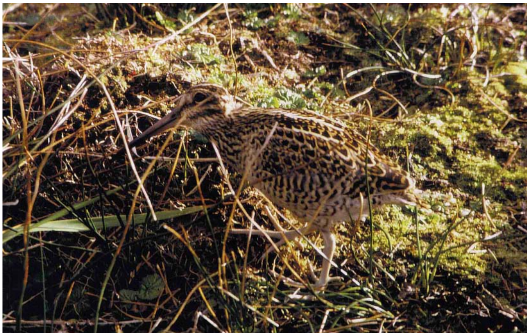
221 Fuegan Snipe / Vuurlandsnip Gallinago stricklandii, Historic Cape Horn, Antártica Chilena, Chile, 8 December 1988