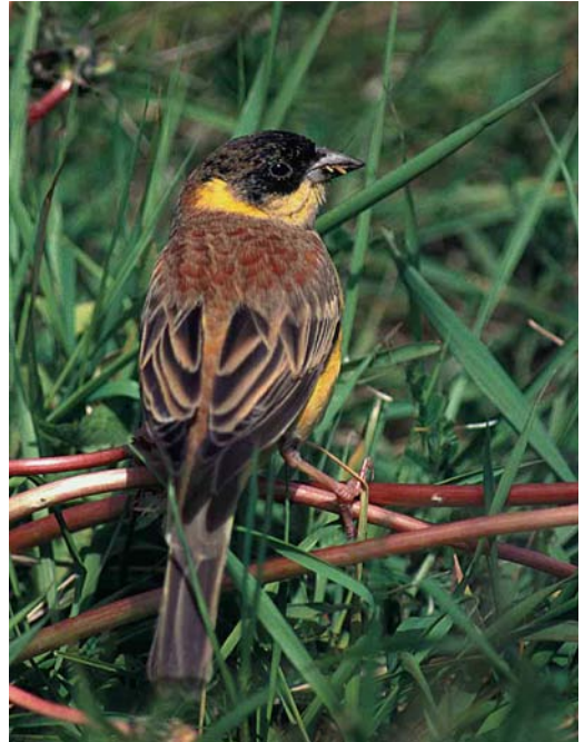
77 Black-headed Bunting / Zwartkopgors Emberiza melanocephala , first-summer male, Den Helder , Noord-Holland, 5 May 1997

Hutchins's Canada Goose Branta hutchinsii hutchinsii 3 March, Brakel , Gelderland, five (description does not