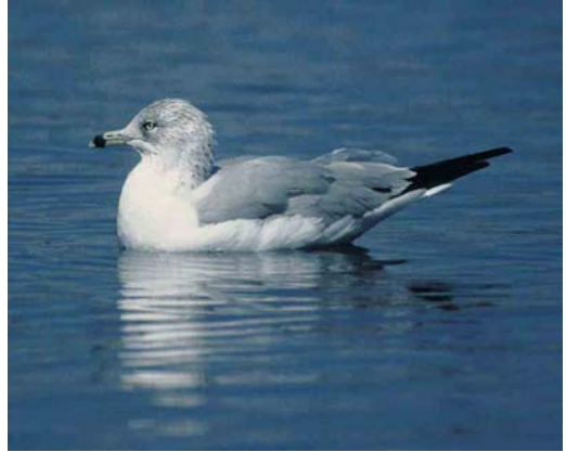
97 Ring-billed Gull / Ringsnavelmeeuw Larus delawarensis , second-winter, Quinta do Lago, Algarve, Portugal, 14 March 1999

lan, Cork, Ireland, until at least 20 April; in Scilly, England, until at least 20 March; and at Ashford, Kent, until at least 23 March. In England, other individuals were seen in Surrey on 16 March, in Norfolk on 17-29 March and in Cornwall in early April. A Black-browed Albatross Diomedea melanophris was seen off Ouessant, Finistère, France, on 1-2 April. A Red-billed Tropicbird Phaethon aethereus was reported off Playa Santiago, La Gomera, Canary Islands, on 11 March. On 20 February, the first White-tailed Tropicbird P lepturus for the Cape Verde Islands was an adult seen at Ilhéu de Curral Velho, Boavista. On 9 March, a Great White Pelican Pelecanus onocrotalus occurred at Hyères, Var, France. A Little Bittern Ixobrychus minutus at Sint Maartensvlotbrug, Noord-Holland, on 13 April may be one of the earliest arrivals ever for the Netherlands. In the Cape Verde Islands, dark-morph Western Reef Egrets Egretta gularis were seen on São Vicente from 19 January until at least 14 March, at Baía da Gata, Boavista, on 21 February, and at Praia, Santiago, on 11 March. The first Great Egret Casmerodius albus for the Cape Verde Islands was photographed at Rabil lagoon, Boavista, on 9 March.