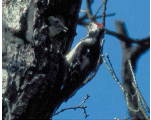
66 Middle Spotted Woodpeckers / Middelste Bonte Spechten Dendrocopos medius , Posterholt, Ambt Montfort, Limburg, June 1997