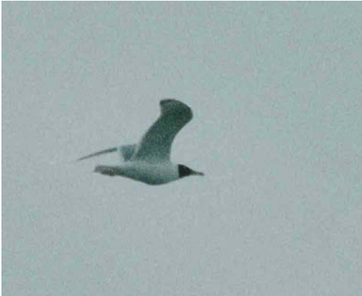
101 Reuzenzwartkopmeeuw / Pallas's Gull Larus ichthyaetus , adult, Gullegem, West-Vlaanderen, 18 maart 1999 (Nicolas Selosse)