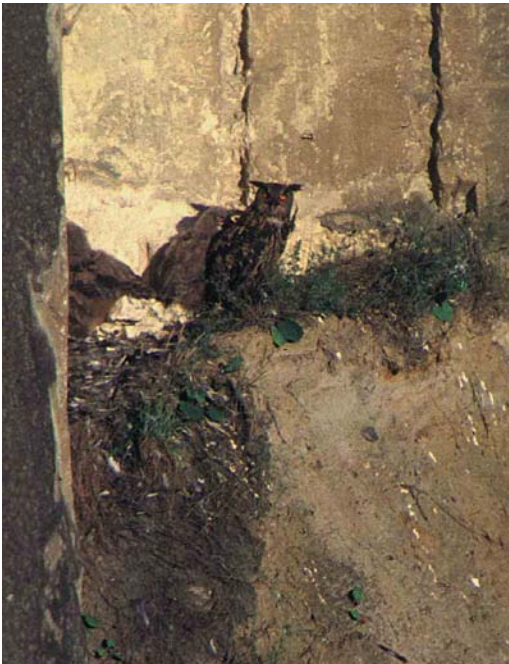
67 Eurasian Eagle Owl / Oehoe Bubo bubo , Sint Pietersberg, Maastricht, Limburg, mei 1997