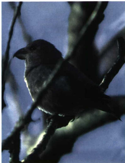
25 Grote Kruisbek / Parrot Crossbill Loxia pytyopsittacus , vrouwtje, Kennemerduinen, Bloemendaal, Noord-Holland, 31 januari 1998 (Arnoud B van den Berg)

spreidden deze vogels zich verder over Limburg en volgden waarnemingen te Helchteren-Meeuwen (11 januari); Schulin (10 en 23 januari); Neerpelt (maximaal drie op 22 en 24 januari); en Bokrijk (twee op 25 januari). Op 17 december verbleven er twee te Tienen, Vlaams-Brabant; op 24 december één te La Hulpe, Waals-Brabant, en op 26 december één te Ploegsteert, Hainaut. Te Harchies-Hensies, Hainaut, werden tot in februari nog één tot twee vogels waargenomen en ook te Geel, Antwerpen, was de gehele periode een exemplaar aanwezig. Van 24 tot 28 december verbleef een Ooievaar Ciconia ciconia in het centrum van Tournai, Hainaut; verder werden exemplaren waargenomen te Tessenderlo, Limburg, op 5 januari; te Warchin, Hainaut, op 7 en 8 januari; over Gent op 9 januari; over Heule, West-Vlaanderen, op 22 januari; te Geel op 25 januari; en hetzelfde exemplaar vloog over Geel, Herentals, en Brecht, Antwerpen, op 26 januari. De enige Rode Wouwen Milvus milvus in Laag-België vlogen op 14 december over Mendonk, Oost-Vlaanderen, en op 18 december over Kallo-Doel. Op 1 en 2 december werd een mogelijke Sakervalk Falco cherrug waargenomen te Lovendegem-Oosterzele, Oost-Vlaanderen.