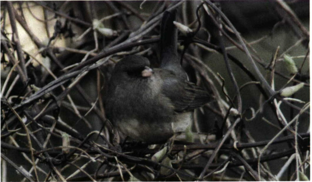
20 Dark-eyed Junco / Grijze Junco Junco hyemalis , Chester, Cheshire, England, January 1998 (Iain H Leach)

Siracusa, south-eastern Sicily, on 21-30 December. In Israel, one Olive-backed Pipit A hodgsoni , three Buff-bellied Pipits A rubescens and two Citrine Wagtails Motacilla citreola were seen in December-January near Eilat. A Blue-headed Wagtail M flava at Læsø, Nordjylland, during the third week of January constituted the first winter record for Denmark.