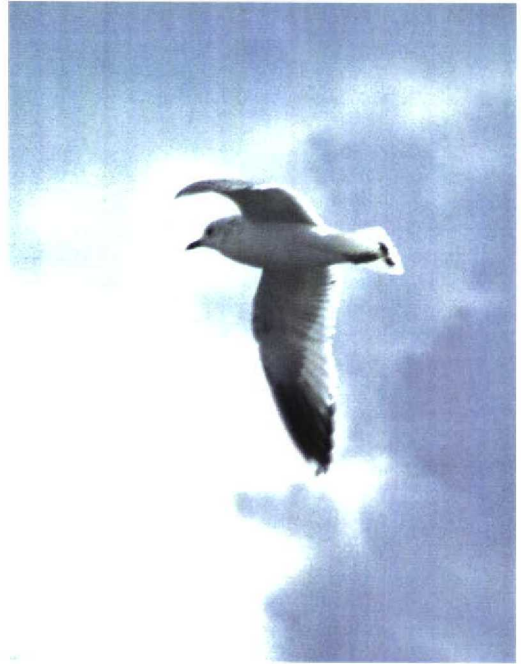
11 Hobby / Boomvalk Falco subbuteo , juvenile, Alphen aan den Rijn, Zuid-Holland, Netherlands, August 1995 12 Common Gull / Stormmeeuw Larus canus , second-winter, Woerden, Utrecht, Netherlands, 31 March 1996 13 Cirl Bunting / Cirlgors Emberiza cirlus , juvenile with adult male, Porto, Corsica, France, 11 July 1990