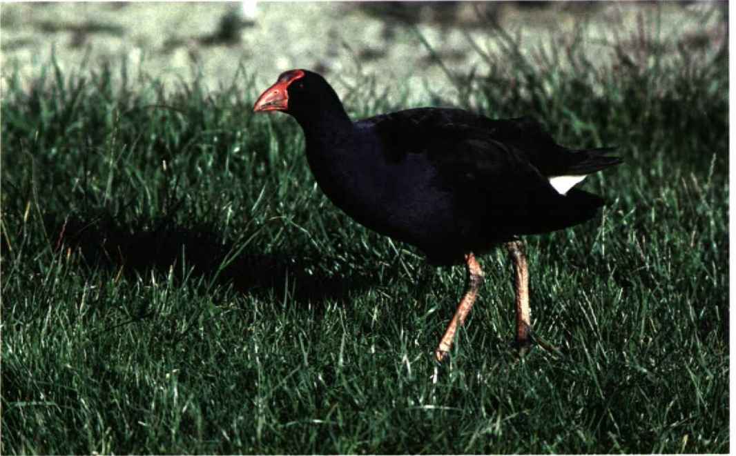
3 Australian Swamp-hen / Australische Purperkoet Porphyrio melanotus , Auckland, South Island, New Zealand, 24 October 1995 (Theo Roersma)