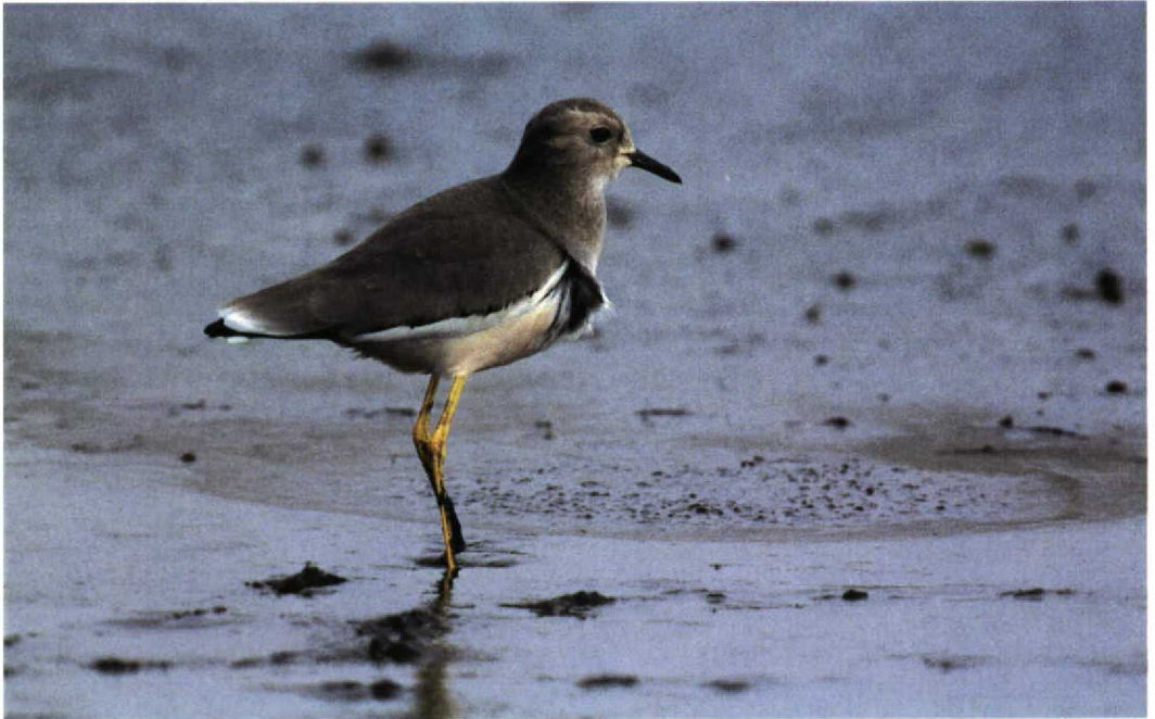
26 Witstaartkievit / White-tailed Lapwing Vanellus leucurus , Krommenie, Noord-Holland, 23 februari 1998

Witstaartkievit bij Krommenie Op zaterdag 21 februari 1998 was Martien Roos op zoek naar teruggekeerde Grutto's Limosa limosa in de voor toekomstige woningbouw gedeeltelijk met zand opgespoten weilanden ten zuiden van Krommenie en bij Assendelft, Noord-Holland. In een ondiepe plas vond hij drie steltlopers, waarvan hij er twee direct als Tureluur Tringa totanus determineerde; bij de derde vogel lukte dat echter niet zo gemakkelijk. De lange gele poten en witte staart vielen bij deze vogel het meest op. Even dacht MR aan een Goudplevier Pluvialis apricaria maar al snel concludeerde hij dat het die niet kon zijn. Thuisgekomen raadpleegde hij de 'Lars Jonsson' en kon hij geen andere conclusie trekken dan dat het om een Witstaartkievit Vanellus leucurus ging. Hoewel MR niet speciaal geïnteresseerd is in zeldzaamheden besefte hij dat anderen graag kennis zouden nemen van deze bijzondere waarneming; daarom belde hij zijn kennis Peter Meijer, die het nieuws direct verspreidde. Ongeveer een uur later werd de waarneming bevestigd en konden de massaal toegestroomde (en aanvankelijk veelal ongelovige) vogelaars dit ornithologische mirakel met eigen ogen aanschouwen. Nadat de vogel zich over een flinke afstand verplaatst had en daarmee nog even voor wat spanning zorgde, liet hij zich tot donker bekijken in