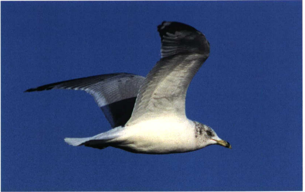
22 Ringsnavelmeeuw / Ring-billed Gull Larus delawarensis , adult, Goes, Zeeland, januari 1998 (Carl Derks)