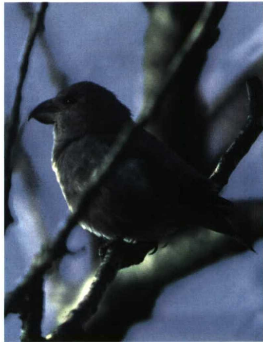
25 Grote Kruisbek / Parrot Crossbill Loxia pytyopsittacus , vrouwtje, Kennemerduinen, Bloemendaal, Noord-Holland, 31 januari 1998 (Arnoud B van den Berg)

spreidden deze vogels zich verder over Limburg en volgden waarnemingen te Helchteren-Meeuwen (11 januari); Schulin (10 en 23 januari); Neerpelt (maximaal drie op 22 en 24 januari); en Bokrijk (twee op 25 januari). Op 17 december verbleven er twee te Tienen, Vlaams-Brabant; op 24 december één te La Hulpe, Waals-Brabant, en op 26 december één te Ploegsteert, Hainaut. Te Harchies-Hensies, Hainaut, werden tot in februari nog één tot twee vogels waargenomen en ook te Geel, Antwerpen, was de gehele periode een exemplaar aanwezig. Van 24 tot 28 december verbleef een Ooievaar Ciconia ciconia in het centrum van Tournai, Hainaut; verder werden exemplaren waargenomen te Tessenderlo, Limburg, op 5 januari; te Warchin, Hainaut, op 7 en 8 januari; over Gent op 9 januari; over Heule, West-Vlaanderen, op 22 januari; te Geel op 25 januari; en hetzelfde exemplaar vloog over Geel, Herentals, en Brecht, Antwerpen, op 26 januari. De enige Rode Wouwen Milvus milvus in Laag-België vlogen op 14 december over Mendonk, Oost-Vlaanderen, en op 18 december over Kallo-Doel. Op 1 en 2 december werd een mogelijke Sakervalk Falco cherrug waargenomen te Lovendegem-Oosterzele, Oost-Vlaanderen.