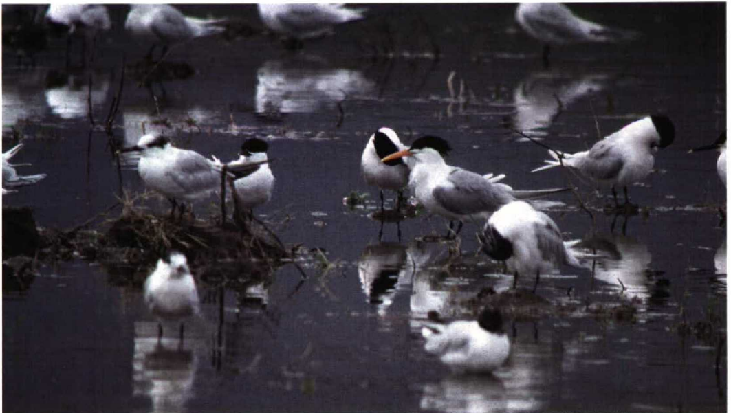
1 Elegant Tern / Sierlijke Stern Sterna elegans with Sandwich Terns / Grote Sterns S. sandvicensis , Llobregat delta, Barcelona, Spain, 24 April 1993

back, rump and tail is also important. Lesser Crested has a similar colour on the lower part of the mantle, back, scapulars, tertials and all the coverts as Common Tern, and darker than in Sandwich Tern. This was not the case in the Llobregat tern. Besides, in Lesser Crested, rump and tail have the same colour as the back and mantle or are sometimes slightly paler, but there is no contrast with the back and they are never whitish. Although the Llobregat tern had a pale grey rump and tail (typical for Elegant, Malling Olsen & Larsson 1995), not pure white, it did show an evident contrast with the darker grey back and mantle. The head showed a small white spot over the bill which may have been a remnant of winter plumage. The bird seen in Ireland in summer 1982 also showed this character (Anthony McGeehan in litt). In the Llobregat tern, the crest was long and shaggy, clearly fitting Elegant. A short crest has been reason to reject other records of Elegant (Arnoud van den Berg in litt, Anthony McGeehan in litt). However, it should be remembered that crest length does not reach its maximum until maturity (Gantlett 1987) and that there are differences in length between male and female (Malling Olsen & Larsson 1995).