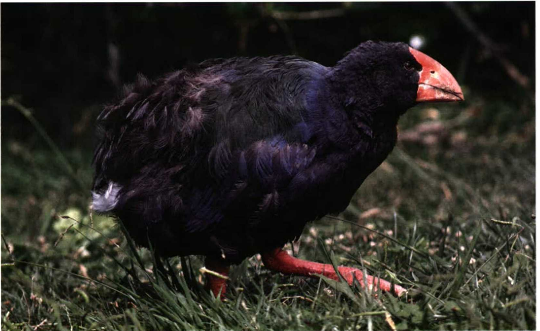
4 South Island Takahē / Zuidereilandtakahē Porphyrio hochstetteri , Tiritiri Matangi, New Zealand, 9 February 1997 (Ed Opperman)