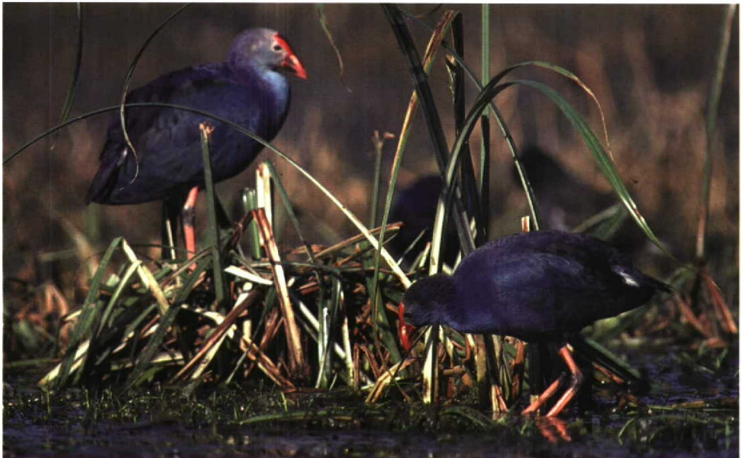
6 Grey-headed Swamp-hens / Grijskoppurperkoeten Porphyrio poliocephalus , Bharatpur, India, 10 February 1998

The poliocephalus -group, which breeds in southern Asia west to southern Turkey and the western shores of the Caspian Sea, is characterized by a distinct cerulean-blue or grey head and may thus be called Grey-headed Swamp-hen. Based on differences in size, taxonomists have recognized two (Ripley 1977, Potapov & Flint 1989) or three subspecies (Cramp & Simmons 1980) in this group. The form ' seistanicus ', which occurs in the Middle East, differs from poliocephalus in being larger (Cramp & Simmons 1980). On the basis of differences in size, Hartert (1917) described the populations in the Caspian region as a separate form which he named ' caspius '. However, he subsequently did not recognize ' caspius ' and included it as a synonym of ' seistanicus ' (Hartert 1921-22). Roselaar (in Cramp & Simmons 1980) later resurrected ' caspius ', based on size differences. On the basis of three museum specimens (C S