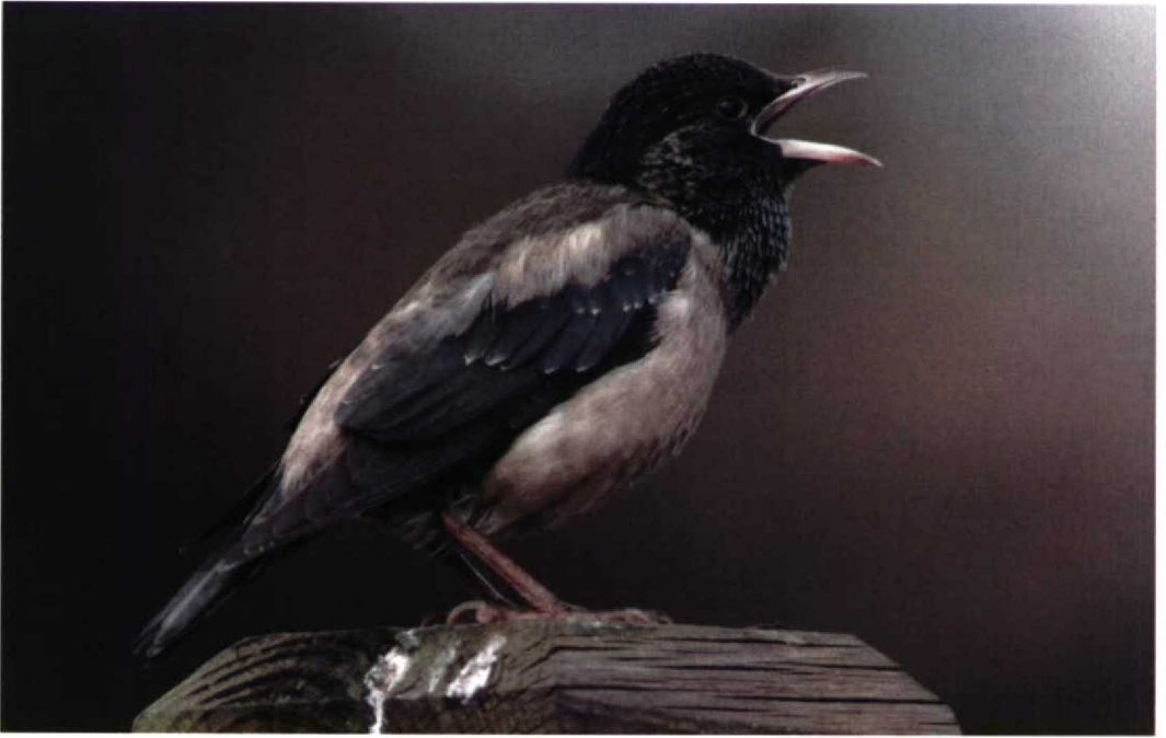
14 Rosy Starling / Roze Spreeuw Sturnus roseus , Beeston, Norfolk, England, January 1998