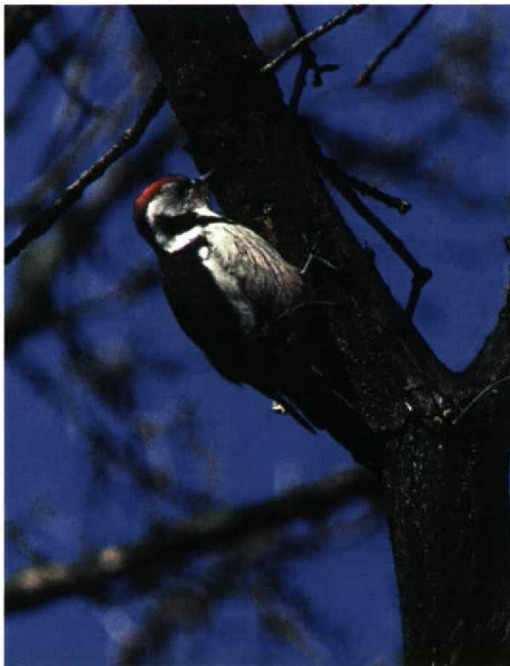
24 Middelste Bonte Specht / Middle Spotted Woodpecker Dendrocopos medius , Enschede, Overijssel, januari 1998 (Carl Derks)