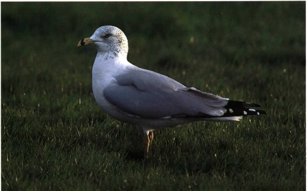
23 Ringsnavelmeeuw / Ring-billed Gull Larus delawarensis , adult, Goes, Zeeland, 20 januari 1998