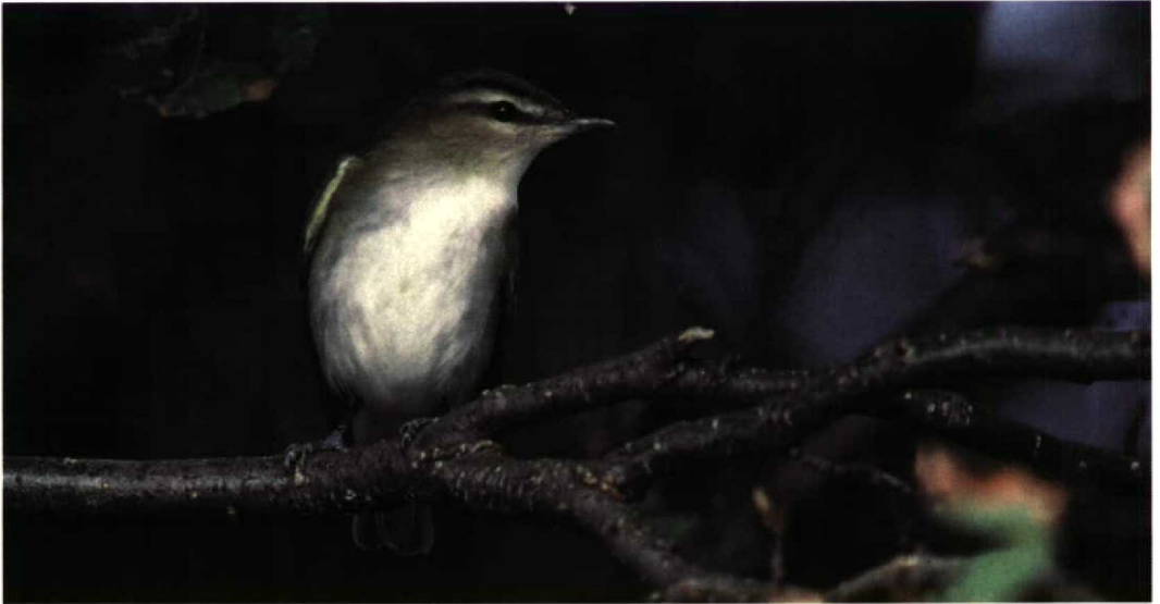
2 Roodoogvireo / Red-eyed Vireo Vireo olivaceus , Vlieland, Friesland, 6 oktober 1996 (Hans Gebuis)

groene bovendelen en vleugel, witte keel, borst en buik, gelige onderstaartdekveren en loodgrijze poten sloot alle Euraziatische grasmussen en boszangers Phylloscopus uit en paste eigenlijk alleen op Roodoogvireo. Philadelphiavireo, de enige soort waarmee nog enige verwarring mogelijk is, kon onder meer worden uitgesloten op grond van de witte borst en buik (bij Philadelphiavireo vaak uniform lichtgeel tot geel), de zwarte wenkbrauwbegrenzing (afwezig bij Philadelphiavireo) en het forse formaat (National Geographic Society 1987, Bradshaw 1992). Het rode vlekje dat zich twee dagen lang op de keel bevond, was waarschijnlijk afkomstig van bessen. Het op leeftijd brengen van de vogel leverde meer problemen op. Eerstejaars vogels kunnen worden herkend op grond van hun bruine iris. Echter, veel eerstejaars ontwikkelen reeds een rode iris (cf Pyle et al 1987, Glutz von Blotzheim et al 1993, Cramp & Perrins 1994). Deze exemplaren zijn dan zelfs in de hand uiterst moeilijk op leeftijd te determineren. De gelige onderstaartdekveren vormen geen betrouwbaar leeftijdskenmerk (contra National Geographic Society 1987; cf Pyle et al 1987, Glutz von Blotzheim et al 1993, Cramp & Perrins 1994). Er zijn geen andere betrouwbare leeftijdskenmerken in het verenkleed bekend (Pyle et al 1987). Resumerend lijkt het dus in dit geval niet mogelijk om de leeftijd te bepalen.