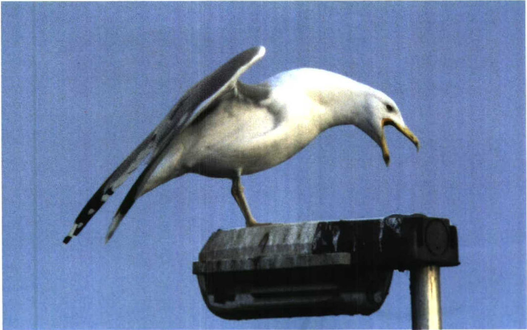
21 Pontische Meeuw / Pontic Gull Larus cachinnans cachinnans , adult, Huizen, Noord-Holland, januari 1998 (Jan Mulder)

ari bij Hollum op Ameland, Friesland. Het heeft er alle schijn van dat dit dezelfde vogel was die op 17-22 mei 1997 bij het Naardermeer, Noord-Holland, verbleef en daarna tot 10 januari (!) in Kent, Engeland. Er was een melding van een Regenwulp Numenius phaeopus op 27 januari bij Zoetermeer, Zuid-Holland. Rosse Franjepoten Phalaropus fulicaria pleisterden van 28 december tot 3 januari bij de Brouwersdam en op 1 januari bij Scharendijke, en op 24 januari vlogen er twee langs Scheveningen. De zevende Ringsnavelmeeuw Larus delawarensis voor Nederland, een adult winter, verbleef vanaf 18 januari in de omgeving van Goes. Nu vogelaars blijkbaar precies weten hoe ze eruit zien worden er veel adulte Pontische Meeuwen L. cachinnans cachinnans waargenomen, in totaal ruim 25, waaronder minimaal vier in december te Arcen, Limburg, maximaal acht in december en januari te Oost-Maarland en Itteren, Limburg, en ten minste drie te Huizen, Noord-Holland. Er werden c. 15 Geelpootmeeuwen L. michahellis gemeld, zowel in het binnenland als aan de kust. Een Kleine Burgemeester L. glaucoides verbleef op 14 en 15 december te Arcen. Langsvliegende exemplaren werden opgemerkt op 26 december te Scheveningen en op 31 december te Huisduinen, Noord-Holland. Grote Burgemeesters L. hyperboreus waren er ook, en wel op 28 december op Terschelling, op 31 december bij De Putten bij Camperduin en langsvliegend bij Scheveningen, op 10