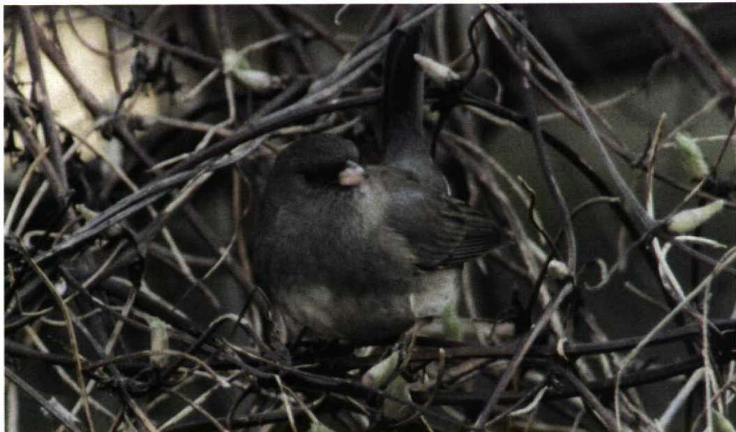
20 Dark-eyed Junco / Grijze Junco Junco hyemalis , Chester, Cheshire, England, January 1998

Siracusa, south-eastern Sicily, on 21-30 December. In Israel, one Olive-backed Pipit A hodgsoni , three Buff-bellied Pipits A rubescens and two Citrine Wagtails Motacilla citreola were seen in December-January near Eilat. A Blue-headed Wagtail M flava at Læsø, Nordjylland, during the third week of January constituted the first winter record for Denmark.