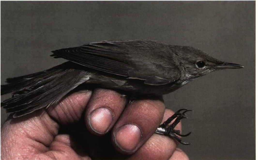
8 Caspian Reed Warbler / Kaspische Karekiet Acrocephalus fuscus , Jubail, Saudi Arabia, 16 April 1991