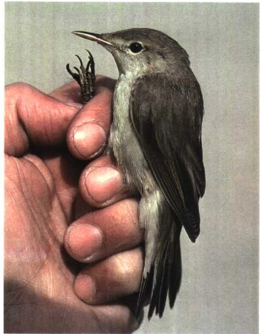
9 Olivaceous Warbler / Vale Spotvogel Acrocephalus pallidus , Jubail, Saudi Arabia, 16 April 1991 (Arnoud B van den Berg) 10 Caspian Reed Warbler / Kaspische Karekiet Acrocephalus fuscus , Jubail, Saudi Arabia, 16 April 1991 (Arnoud B van den Berg)

species of falcon with a barred closed uppertail (for example juvenile Red-footed Falcon F vesperinus ). Juvenile Sooty Falcon F concolor has a uniform closed uppertail, but another important feature of the mystery bird, the dark upperparts, do not fit this species (paler blue-grey in Sooty). As is visible on the outermost left tail feather, the barring is restricted to the inner web. This pattern on the tail feathers is typical for juvenile Hobby F subbuteo , although there are often some small spots present on the outer webs. In the very similarly plumaged juvenile Eleonora's Falcon F eleonora , the barring of the tail feathers is denser and continues further onto the outer web (the central pair of tail feathers being unbarred in both species).