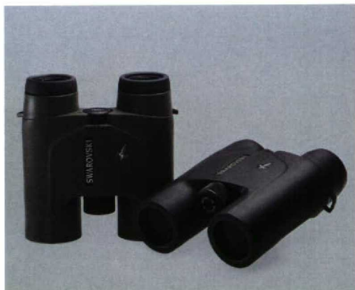
Swarovski SLC 8x30 WB binoculars

Plates I-II represent the first two mystery photographs. Please, carefully study the rules below and identify the birds in the photographs. Solutions can be submitted in three different ways: