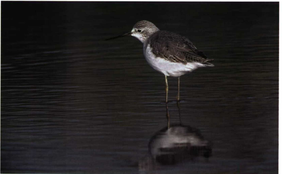
15 Marsh Sandpiper / Poelruiter Tringa stagnatilis , adult winter, Tavira, Algarve, Portugal, 24 January 1998 (Ray Tipper)