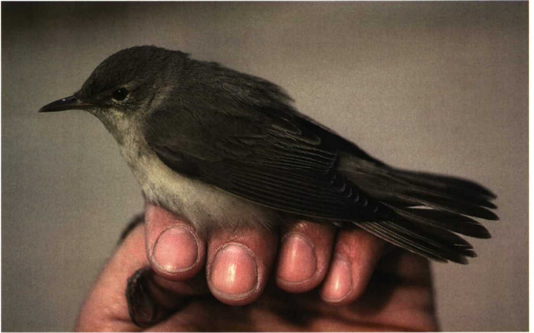
7 Marsh Warbler / Bosrietzanger Acrocephalus palustris , Jubail, Saudi Arabia, 5 May 1991