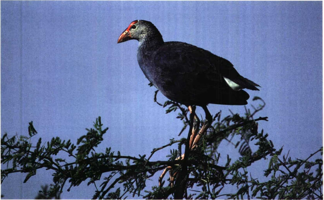
5 Grey-headed Swamp-hen / Grijskopperperkoet Porphyrio poliocephalus , Bharatpur, India, 11 April 1996 (René Pop)