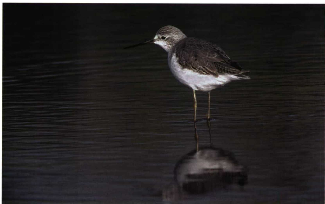
15 Marsh Sandpiper / Poelruiter Tringa stagnatilis , adult winter, Tavira, Algarve, Portugal, 24 January 1998 (Ray Tipper)