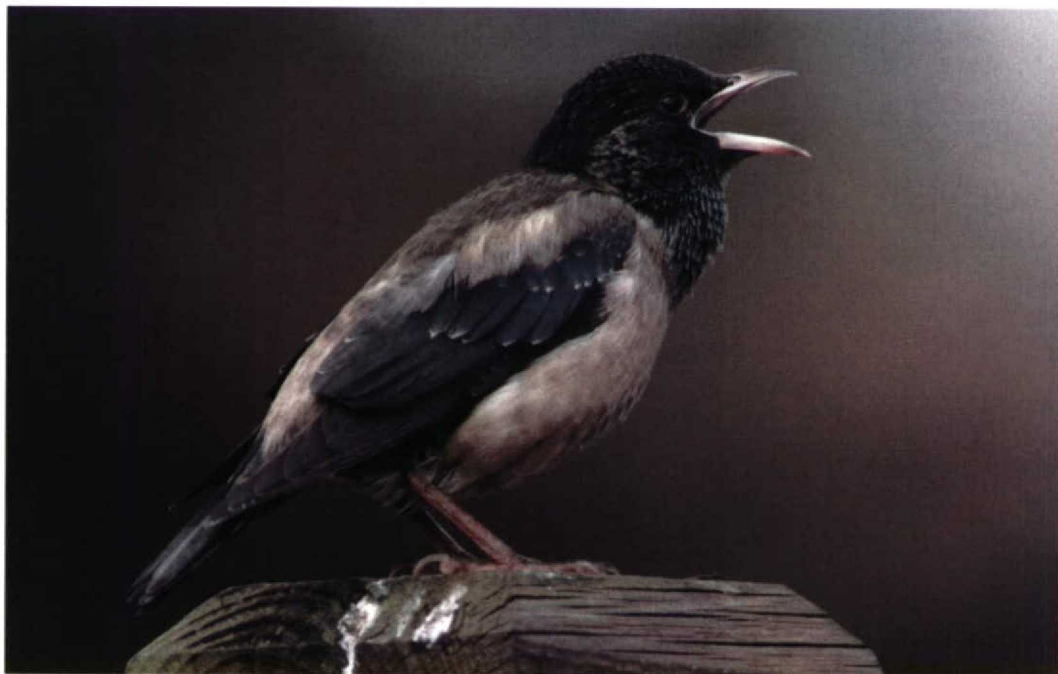
14 Rosy Starling / Roze Spreeuw Sturnus roseus , Beeston, Norfolk, England, January 1998