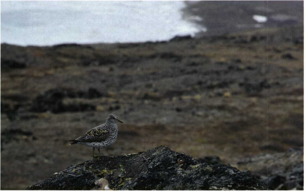
191 Surfbird / Brandingloper Aphriza virgata, territorial bird, Turquoise Lake, Alaska, USA, 21 May 1997