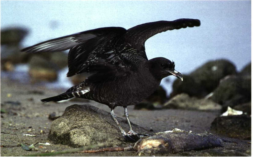
202 Long-tailed Skua / Kleinste jager Stercorarius longicaudus , Altmühlsee, Bayern, Germany, August 1998