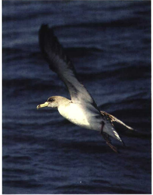
181 Cory's Shearwater / Kuhls Pijlstormvogel Calonectris borealis , off Lajes do Pico, Pico, Azores, 26 July 1997 (Ricard Gutiérrez). Even in bad conditions, underwing pattern is clearly visible. Note also almost uniformly coloured upperside in this bird (unlike Cory's Shearwater depicted in plate 176) 182 Scopoli's Shearwaters / Scopoli's Pijlstormvogels Calonectris diomedea , off Palamós, Girona, 6 April 1997 (Ricard Gutiérrez). Note slim proportions (pitfall of Balearic Shearwater Puffinus mauretanicus for inexperienced observers) and white underwing panel 183 Cory's Shearwater / Kuhls Pijlstormvogel Calonectris borealis , picked up at Fijnaart, Noord-Brabant, Netherlands, 27 September 1996 (photographed on 4 October 1996) (Hans Westerlaken)