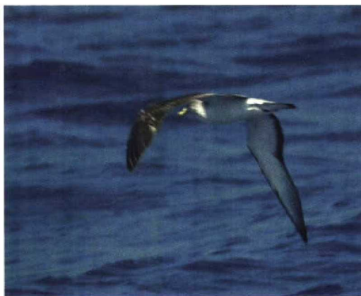
175 Scopoli's Shearwater / Scopoli's Pijlstormvogel Calonectris diomedea , off Arenys de mar, Barcelona, Spain, 14 April 1986 (Ricard Gutiérrez) 176 Cory's Shearwater / Kuhls Pijlstormvogel Calonectris borealis , off Lajes do Pico, Pico, Azores, 26 July 1997 (Ricard Gutiérrez). Note thicker bill than in Scopoli's Shearwater C. diomedea depicted in plate 175 177 Cory's Shearwater / Kuhls Pijlstormvogel Calonectris borealis , off Lajes do Pico, Pico, Azores, 26 July 1997 (Ricard Gutiérrez). In some light conditions, primaries show two tones, black and dark grey; however, white underwing panel never forms pointed shape (plate 178). Note also broad wings and heavy structure 178 Scopoli's Shearwater / Scopoli's Pijlstormvogel Calonectris diomedea , off Isla Cristina, Huelva, August 1996 (Xavier Laruy). Even in distant birds, shape of white underwing panel is clearly visible

(Sánchez Codoñer 1994, contra Thibault & Bretagnolle 1998). Another (nine-year-old) female borealis ringed as pullus on Selvagem Grande was present on Linosa, Pelagian Islands, Sicilian Channel, although not breeding (Lo Valvo & Massa 1988). An apparent case of mixed pairing in the Mediterranean Sea between a proven male borealis (identified through call analysis, body measurements and cytochrome-b sequence) and a presumed diomedea female (call atypical for diomedea but biometrics within the range of this taxon; however, no underwing pattern was described) was reported from a dio-