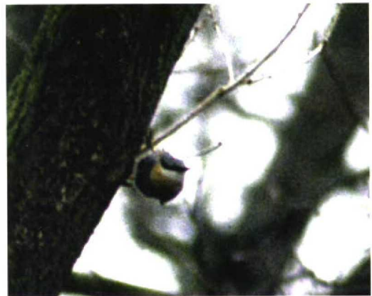
195 Aberrant European Nuthatch / afwijkende Boomkruiper Sitta europaea , Park Sansouci, Potsdam, Germany, 17 December 1996

There is no other species of nuthatch with the features shown in the photographs (cf Harrap & Quinn 1996) and no obvious hybrid candidate is available with blue-grey belly and flanks. Thus,