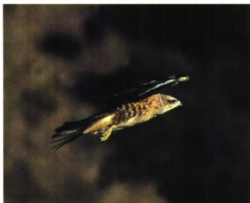
189 Hybrid Black Kite x Common Buzzard / hybride Zwarte Wouw x Buizerd Milvus migrans x Buteo buteo , juvenile, Tolfa Hills, Lazio, Italy, August 1996 (Daniele Ardizzone)