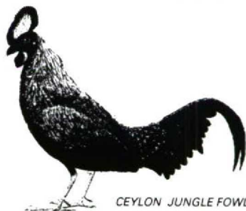
CEYLON JUNGLE FOWL

Experienced Tour Operator Delmege Forsyth Tours (Pvt) Ltd., 101, Vinayalankara Mawatha, Colombo 10. Sri Lanka.