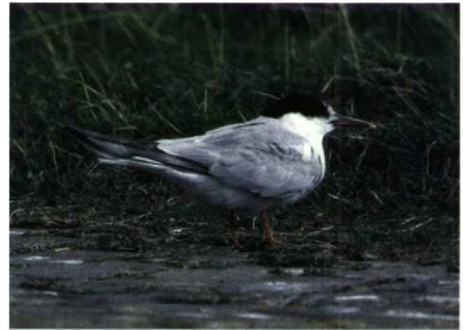
198 Common Tern / Visdief Sterna hirundo hirundo , adult summer, Stellendam, Zuid-Holland, Netherlands, 4 July 1994 (Klaus Malling Olsen). Note pale extreme tip to bill 199 Common Tern / Visdief Sterna hirundo hirundo , adult moulting to winter plumage, Lelystad, Flevoland, Netherlands, 9 September 1995 (Klaus Malling Olsen). Note extent of pale bill-tip, which gradually becomes more extensive in late summer and autumn before bill in winter becomes all black

would be even more out-of-range for the short-distance migrating tibetana . A further indication was that neither Kennerley nor me have ever seen the grey axillaries in any hirundo and tibetana , although I have noticed a slight grey wash in a bird ( hirundo or minussensis ) photographed in Kazakhstan in June. In that individual, the bill coloration was close to the Hong Kong tibetana (darker red with broader black bill-tip). Note also, that the 'mystery tern' photographs are rather dark, especially affecting the appearance of the upperparts – in my opinion this may well be a photographic effect rather than reality.