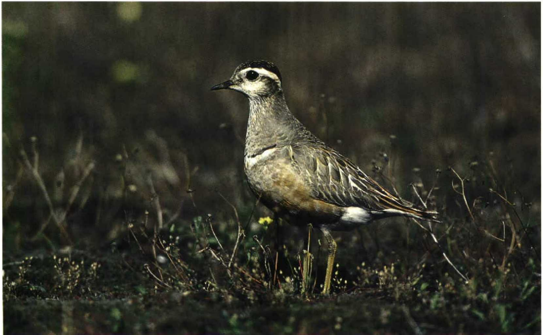
215 Morinelplevier / Dotterel Charadrius morinellus , Maasvlakte, Zuid-Holland, 5 september 1998