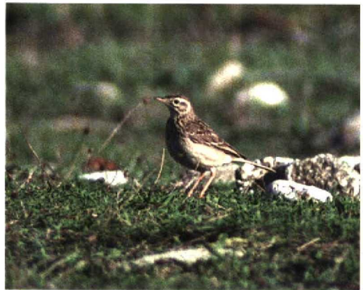
212 Blyth's Pipit / Mongoolse Pieper Anthus godlewskii , Sein, Finistère, France, October 1998 (Marc Duquet)