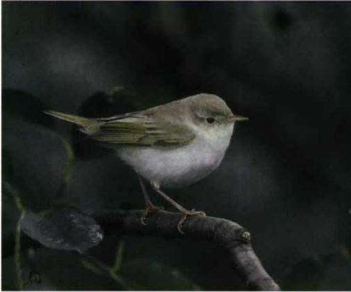
218 Bergfluitier / Western Bonelli's Warbler Phylloscopus bonelli , Texel, Noord-Holland, 15 september 1998 (Jan van Holten)