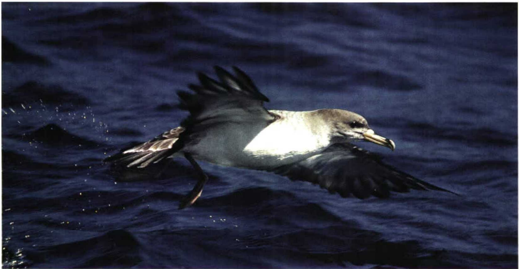
172 Scopoli's Shearwater / Scopoli's Pijlstormvogel Calonectris diomedea , off Palamós, Girona, Spain, 6 April 1997 (Ricard Gutiérrez). Note head proportions, slender bill and neck, pale neck and upperparts and pale inner webs of outermost primaries

On average, the upperside is noticeably darker in borealis . The head and, especially, the upperparts of diomedea are generally paler. Thus, individuals with little or no contrast between head, upperparts and upperwings are clearly borealis