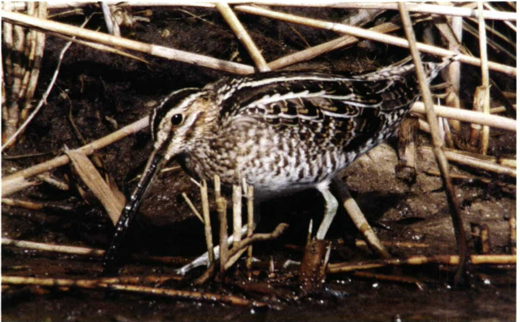
203 Wilson's Snipe / Wilsons Snip Gallinago delicata , Lower Moors, St Mary's, Scilly, England, October 1998