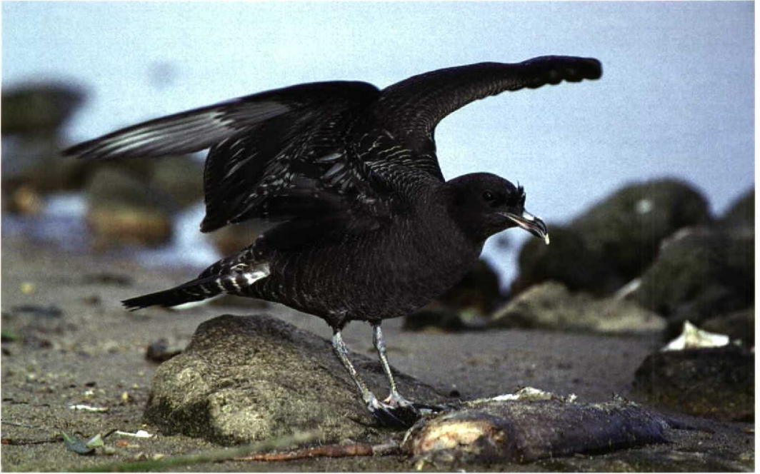
202 Long-tailed Skua / Kleinste jäger Stercorarius longicaudus, Altmühlsee, Bayern, Germany, August 1998