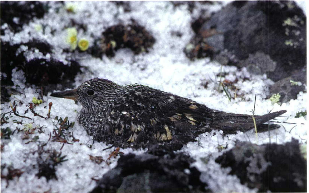
193 Surf-bird / Brandingloper Aphriza virgata, incubating female after hail, Turquoise Lake, Alaska, USA, 9 June 1997