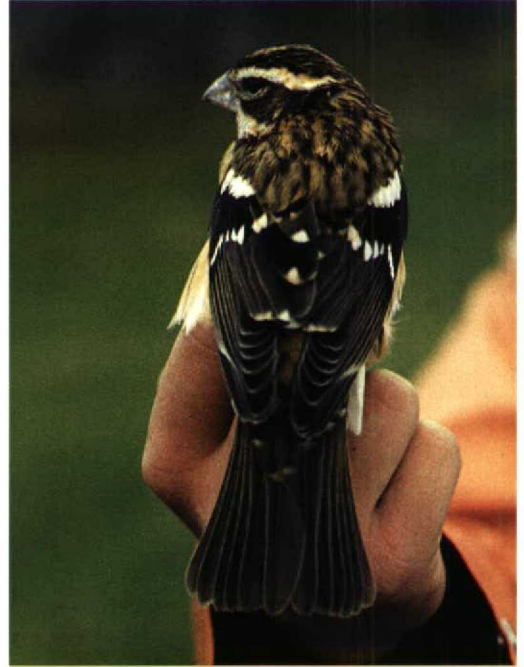
163 Eyebrowed Thrush / Vale Lijster Turdus obscurus , Utsira, Rogaland, Norway, October 1981 (Ove Bryne) 164 Rose-breasted Grosbeak / Roodborstkardinaal Pheucticus ludovicianus , Utsira, Rogaland, Norway, October 1977 (Ove Bryne) 165 Little Bunting / Dwerggors Emberiza pusilla and Yellow-breasted Bunting / Wilgengors E aureola , Utsira, Rogaland, Norway, September 1985 (Ove Bryne)