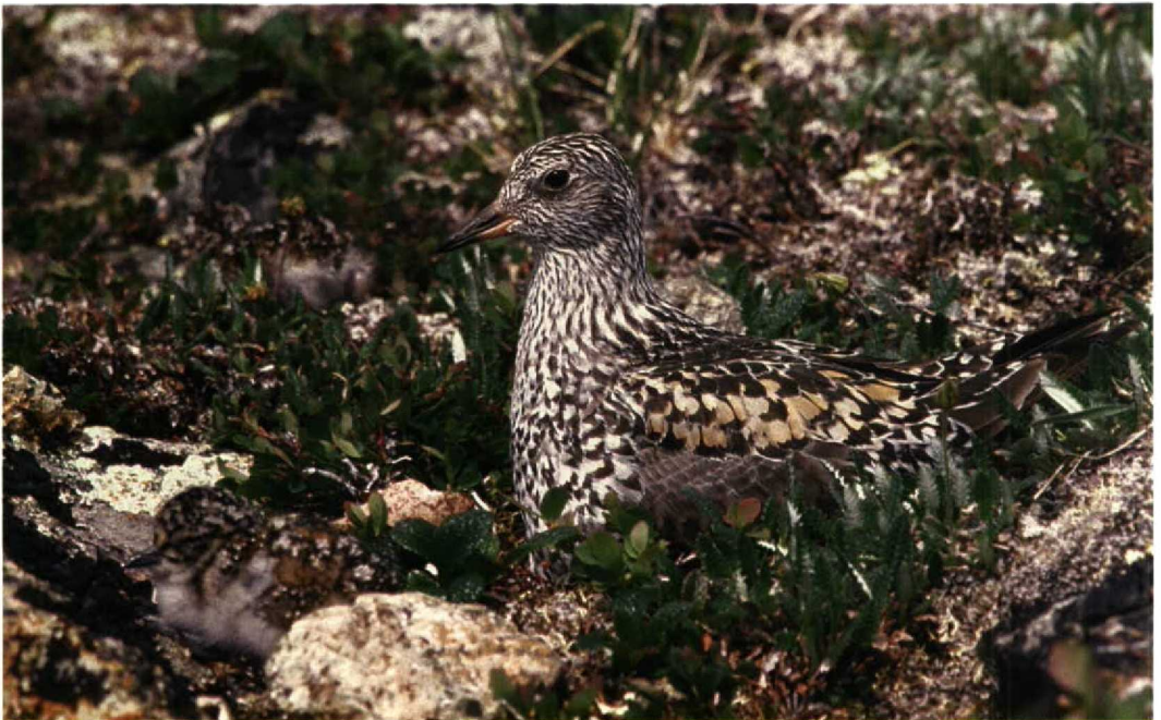
194 Surf-bird / Brandingloper Aphriza virgata, adult with downy young, Turquoise Lake, Alaska, USA, 11 June 1997. Tundra is getting green at hatching