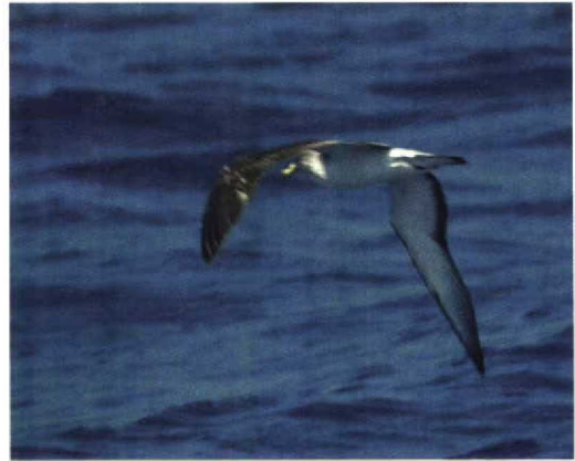
175 Scopoli's Shearwater / Scopoli's Pijlstormvogel Calonectris diomedea , off Arenys de mar, Barcelona, Spain, 14 April 1986 (Ricard Gutiérrez) 176 Cory's Shearwater / Kuhls Pijlstormvogel Calonectris borealis , off Lajes do Pico, Pico, Azores, 26 July 1997 (Ricard Gutiérrez). Note thicker bill than in Scopoli's Shearwater C. diomedea depicted in plate 175 177 Cory's Shearwater / Kuhls Pijlstormvogel Calonectris borealis , off Lajes do Pico, Pico, Azores, 26 July 1997 (Ricard Gutiérrez). In some light conditions, primaries show two tones, black and dark grey; however, white underwing panel never forms pointed shape (plate 178). Note also broad wings and heavy structure 178 Scopoli's Shearwater / Scopoli's Pijlstormvogel Calonectris diomedea , off Isla Cristina, Huelva, August 1996 (Xavier Laruy). Even in distant birds, shape of white underwing panel is clearly visible

(Sánchez Codoñer 1994, contra Thibault & Bretagnolle 1998). Another (nine-year-old) female borealis ringed as pullus on Selvagem Grande was present on Linosa, Pelagian Islands, Sicilian Channel, although not breeding (Lo Valvo & Massa 1988). An apparent case of mixed pairing in the Mediterranean Sea between a proven male borealis (identified through call analysis, body measurements and cytochrome-b sequence) and a presumed diomedea female (call atypical for diomedea but biometrics within the range of this taxon; however, no underwing pattern was described) was reported from a dio-