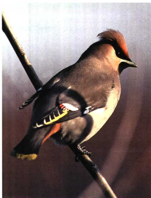
170 Pestvogel / Bohemian Waxwing Bombycilla garrulus , adult, Katwijk aan Zee, Zuid-Holland, 29 januari 1996

eeuw is in hoge mate gebaseerd op een door Frans Rijnja bijeengebracht en aan Peter de Knijff overgedragen archief waarin vrijwel alle gepubliceerde Pestvogelwaarnemingen in 1900-77 zijn opgenomen. Hoewel dit archief niet volledig is, betreft het hier de meest complete toegankelijke bron van historische informatie. Aanvullingen over het optreden van invasies (ook buiten Nederland) zijn ontleend aan met name Eykman et al (1937), Glutz von Blotzheim (1966), Haffer (1985) en Cramp (1988). De waarnemingen uit de periode 1978-83 zijn afkomstig uit de database van het Atlasproject voor winter- en trekvogels van SOVON en deels gepubliceerd in SOVON (1987). Omdat deze waarnemingen per maand werden ingezameld en exacte aantalsopgaven niet verplicht waren, sluiten ze niet geheel aan bij die uit eerdere tijden. Voor de globale schets van het voorkomen zijn ze echter voldoende gedetailleerd. Informatie omtrent het voorkomen in 1984-88 is in hoofdzaak ontleend aan de waarnemingenrubrieken in Dutch Birding en Vogeljaar en aan Eggenhuizen (1989). Informatie van na 1989 stamt uit de database van het BSP Niet-broedvogels.