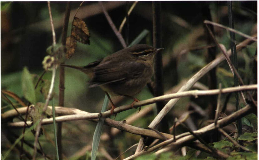
213 Radde's Warbler / Raddes Boszanger Phylloscopus schwarzi , Vlieland, Friesland, Netherlands, 11 October 1998 (Ran Schols)

On Fair Isle, Pallas's Grasshopper Warblers Locustella certhiola were seen on 30 September, 1-2 October and 3-7 October. Another turned up in Lincolnshire, England, on 3 October. In France, one stayed on Ouessant on 11-15 October. In Shetland, Lanceolated Warblers L. lanceolata were present on Unst on 22 September and five occurred on Fair Isle between 26 September and 10 October. The third Paddyfield Warbler Acrocephalus agricola for Ireland stayed in the only tree of East Town, Tory Island, Donegal, on 21 September; in the same tree, a Greenish Warbler Phylloscopus trochiloides was present that day. Both birds were also trapped and ringed; on 30 September, the East Town tree produced a Little Bunting Emberiza pusilla . In 1998, Cape Verde Warbler A. brevipennis was rediscovered as a breeding bird on São Nicolau, Cape Verde Islands (the only other known breeding population occurs on