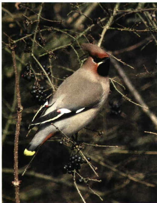
169 Pestvogel / Bohemian Waxwing Bombycilla garrulus , eerste-winter, Enschede, Overijssel, 16 maart 1996 (Paul Knolle)