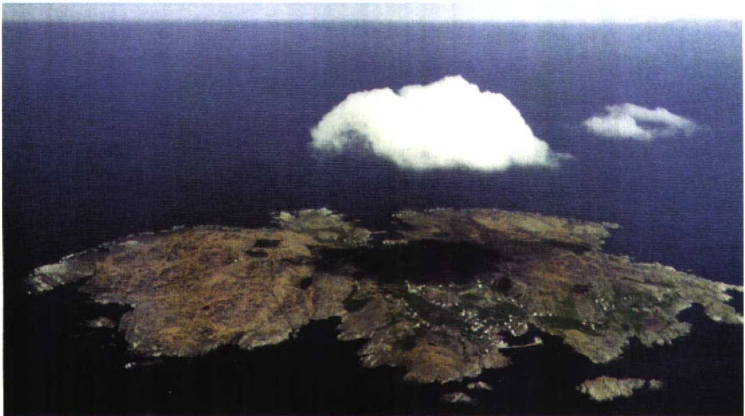
159 Utsira in bird's eye view ( Airspot )

diameter of c 3 km, covering c 6 km 2 . The grey, barren, mountainous rock that you see from the ferry is a sign of the rugged nature of Utsira. Yet, as you enter the north or south harbour, you will discover one of the island's secrets: a beautiful green valley that cuts across the diameter. In both harbours, old boat houses and wharf buildings line the shore whilst along the lanes joining north to south and up the short valleys many houses exhibit a bewildering variety of colours. The higher areas beyond the valley, which make up most of the eastern and western parts of the island, offer little but barren rock and sparse low vegetation. These moorlands, where the only suitable food sources and resting places for birds are heather and some spruce plantations, are not very good for birds and only host breeding Meadow Pipits Anthus pratensis and Northern Wheatears Oenanthe oenanthe . A few ponds are sometimes frequented by common dabbling ducks and the rough coastline can hold a few of the most common shorebirds. Thus, the main valley, Siradalen, and its near surroundings, is