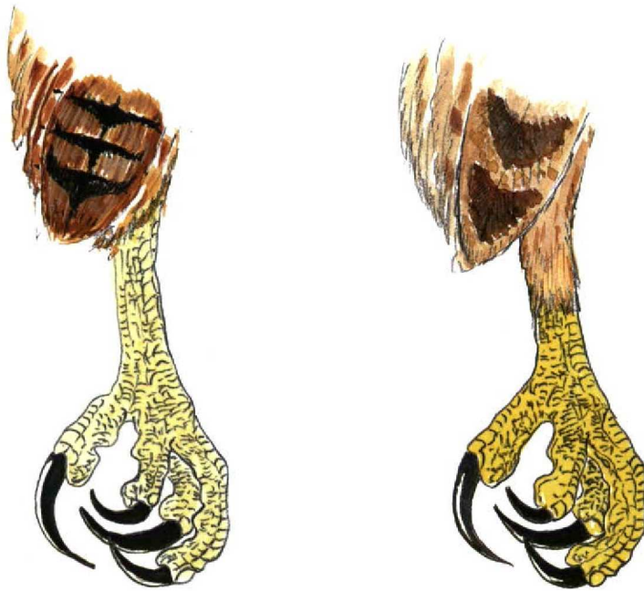
FIGURE 4 Legs and feet. Left: Tolfa Hills juvenile hybrid Black Kite x Common Buzzard / hybride Zwarte Wouw x Buizerd Milvus migrans x Buteo buteo ; right: European Honey-buzzard / Wespendifiel Pernis apivorus (Carmeluccia Cardelli)

Marsh Harrier or Montagu's Harrier (see overview in Forsman 1995 and references therein, Fairclough 1995; Dutch Birding 17: 119, 1995). The only successful hybridization in harriers was of a male Pallid paired with a female Montagu's raising three hybrid young in Finland in 1993 (Forsman 1995). Amongst European falcons, there are two known instances of copulating Common Kestrel F tinnunculus and Lesser Kestrel F naumanni but without nesting success (Andrea Corso pers obs).