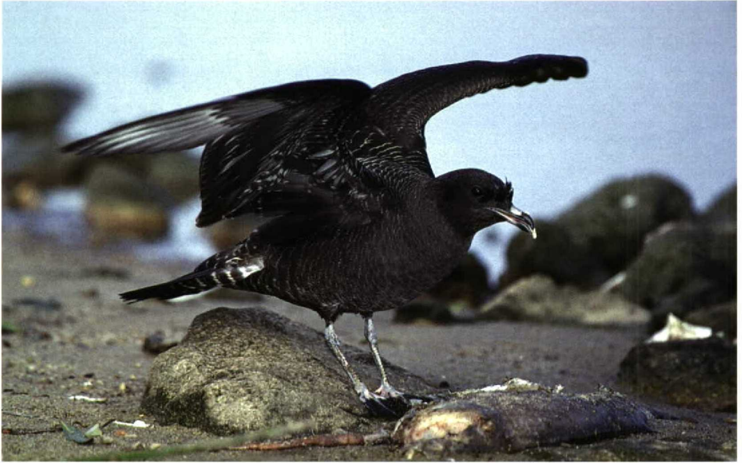
202 Long-tailed Skua / Kleinste jäger Stercorarius longicaudus, Altmühlsee, Bayern, Germany, August 1998