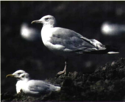
196 Pontic Gull / Pontische Meeuw Larus cachinnans cachinnans , adult, Mucking, Essex, England, 24 August 1996 (Bob Glover)