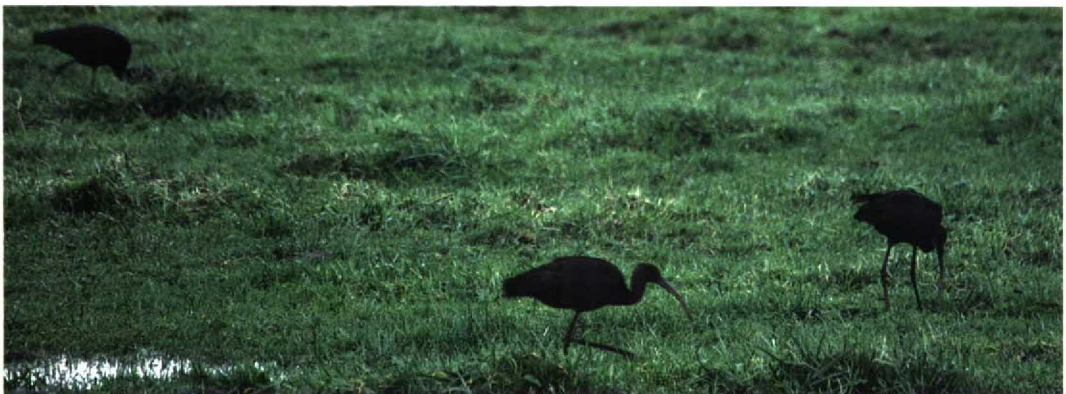
201 Glossy Ibises / Zwarte Ibissen Plegadis falcinellus , Gaast, Friesland, Netherlands, 11 October 1998 (Mark Zekhuis)