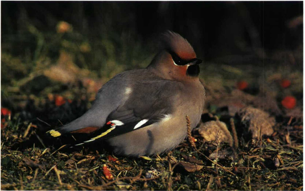
171 Pestvogel / Bohemian Waxwing Bombycilla garrulus , eerste-winter, Katwijk aan Zee, Zuid-Holland, 29 januari 1996

zijn, per invasie verschilt. In veel gevallen worden gedurende 3-5 maanden grote aantallen gezien. In enkele gevallen is deze periode kortstondiger geweest, met name in de vroege, respectievelijk late invasiewinters 1965/66 en 1956/57. In het eerste geval was eigenlijk sprake van doortrek en niet van overwintering. In het tweede geval werd het zeer late en plotselinge voorkomen waarschijnlijk gelanceerd door het volledig uitgeput raken van voedselbronnen ten noorden en/of oosten van Nederland (Glutz von Blotzheim 1966).