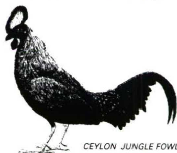
CEYLON JUNGLE FOWL

Experienced Tour Operator Delmege Forsyth Tours (Pvt) Ltd., 101, Vinayalankara Mawatha, Colombo 10. Sri Lanka.