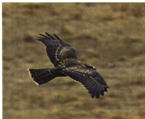
190 Hybrid Black Kite x Common Buzzard / hybride Zwarte Wouw x Buizerd Milvus migrans x Buteo buteo , juvenile, Tolfa Hills, Lazio, Italy, August 1996

Common Buzzard, eight characters of Black Kite, and five intermediate (see table 1).