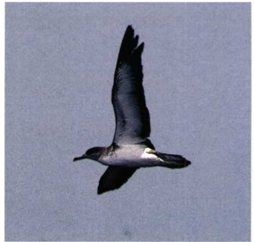
184-185 Cape Verde Shearwater / Kaapverdische Pijlstormvogel Calonectris edwardsii , off Senegal, October 1996

the northern winter in Argentine and Brazilian waters (eg, Mougin et al 1988, Cantos & Gómez-Manzanique 1996). Then, during the northern spring, they head north to Central and North American waters where they stay during the summer. Immature borealis return to their South American wintering grounds either via Central America or via Europe (Mougin et al 1988, Paterson 1997). Immature diomedea spend the northern winter in southern African waters. Then they return to the Mediterranean Sea and European Atlantic waters to spend the summer (Mougin et al 1988). The migration patterns of adult borealis and diomedea are less complicated. They migrate directly to and back from their South American and southern African wintering waters, respectively (Mougin et al 1988). Some diomedea overwinter in the Mediterranean Sea (Paterson 1997) and off the Atlantic coast of Morocco (Thibault et al 1997). Interestingly, diomedea has been recorded off New England, USA, and borealis off South Africa (Cramp & Simmons 1977). Vagrant borealis (and/or diomedea ) are regular in the Indian Ocean (Thibault et al 1997) and have been recorded as far as New Zealand (Tunncliffe 1982).