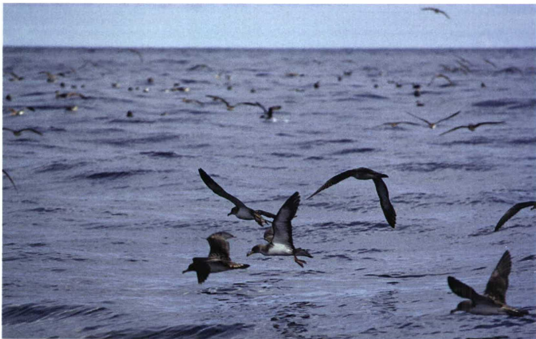
179 Cory's Shearwaters / Kuhls Pijlstormvogels Calonectris borealis , off Lajes do Pico, Pico, Azores, 26 July 1997 (Ricard Gutiérrez). Upperside of Cory's Shearwater tends to be darker than in Scopoli's Shearwater C diomedea . Note also underwing pattern and structure 180 Scopoli's Shearwaters / Scopoli's Pijlstormvogels Calonectris diomedea , off Palamós, Girona, Spain, 6 April 1997 (Ricard Gutiérrez). Head pattern is variable. However, note bill proportions in relation to head compared with Cory's Shearwater C borealis