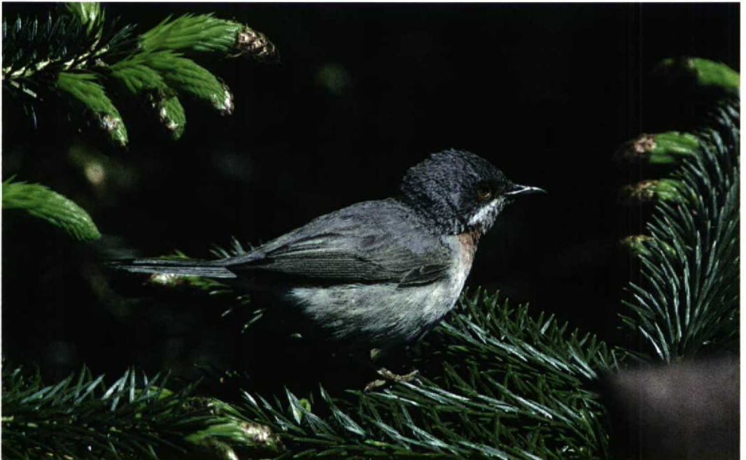
166 Subalpine Warbler / Baardgrasmus Sylvia cantillans , Utsira, Rogaland, Norway, May 1994 (Håkon Hegglund)

In early August, the first autumn migrants are seen heading south. The first wave involves com-