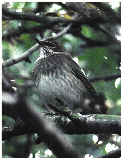
160 Myrtle Warbler / Mirtezanger Dendroica coronata , Utsira, Rogaland, Norway, 8 October 1996 (Håkon Heggland) 161 Black-throated Thrush / Zwartkeellijster Turdus ruficollis atrogularis , Utsira, Rogaland, Norway, 1 October 1991 (Håkon Heggland) 162 Swainson's Thrush / Dwerglijster Catharus ustulatus , Utsira, Rogaland, Norway, 20 September 1974 (Viggo Ree)