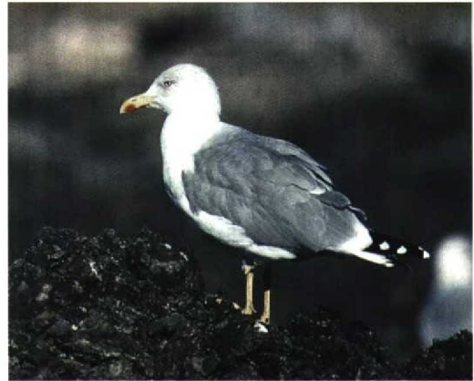
197 Yellow-legged Gull / Geelpootmeeuw Larus michahellis , adult, Mucking, Essex, England, October 1996

plate 117, 1997), and another photograph of the same individual is published here (plate 195).