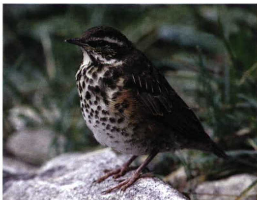
139 Sharp-tailed Sandpiper / Siberische Strandloper Calidris acuminata , adult, Ezumakeeg, Lauwersmeer, Friesland, Netherlands, 9 August 1998 140 Baird's Sandpiper / Bairds Strandloper Calidris bairdii , adult, and Dunlin / Bonte Strandloper C alpina , Lound Gravel Pits, Nottinghamshire, England, August 1998 141 Red-necked Stint / Roodkeelstrandloper Calidris ruticollis , adult, Ballycotton, Cork, Ireland, July 1998 142 Blue-cheeked Bee-eater / Groene Bijeneter Merops persicus , Husby Sø, Vestjylland, Denmark, 6 July 1998 143 Turkestan Shrike / Turkestaanse Klauwier Lanius phoenicuroides , Anglesey, Wales, July 1998 144 Redwing / Koperwiek Turdus iliacus , juvenile, Nuuk, Greenland, 15 August 1998