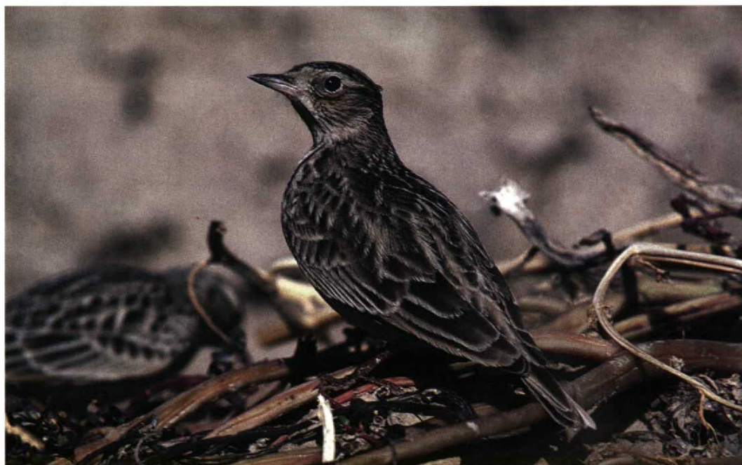
136 Oriental Lark / Kleine Veldleeuwerik Alauda gulgula , Eilat, Israel, 29 November 1992

The striking bill-shape of the mystery bird also does not fit many other lark species (including all members of the genera Calandrella and Melanocorypha ), because these species have shorter, thicker and less pointed bills. Bills more similar to that of the mystery bird are found in Crested Lark Galerida cristata (less so in Thekla Lark G theklae ), Wood Lark Lullula arborea , Sky Lark A arvensis and Oriental Lark A gulgula (also known as Small Skylark). Crested can be excluded as this species should show a distinct crest (which may seem absent occasionally), a darker