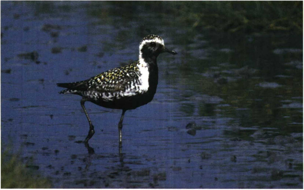
148 Aziatische Goudplevier / Pacific Golden Plover Pluvialis fulva , De Putten, Schoorl, Noord-Holland, 23 juli 1998