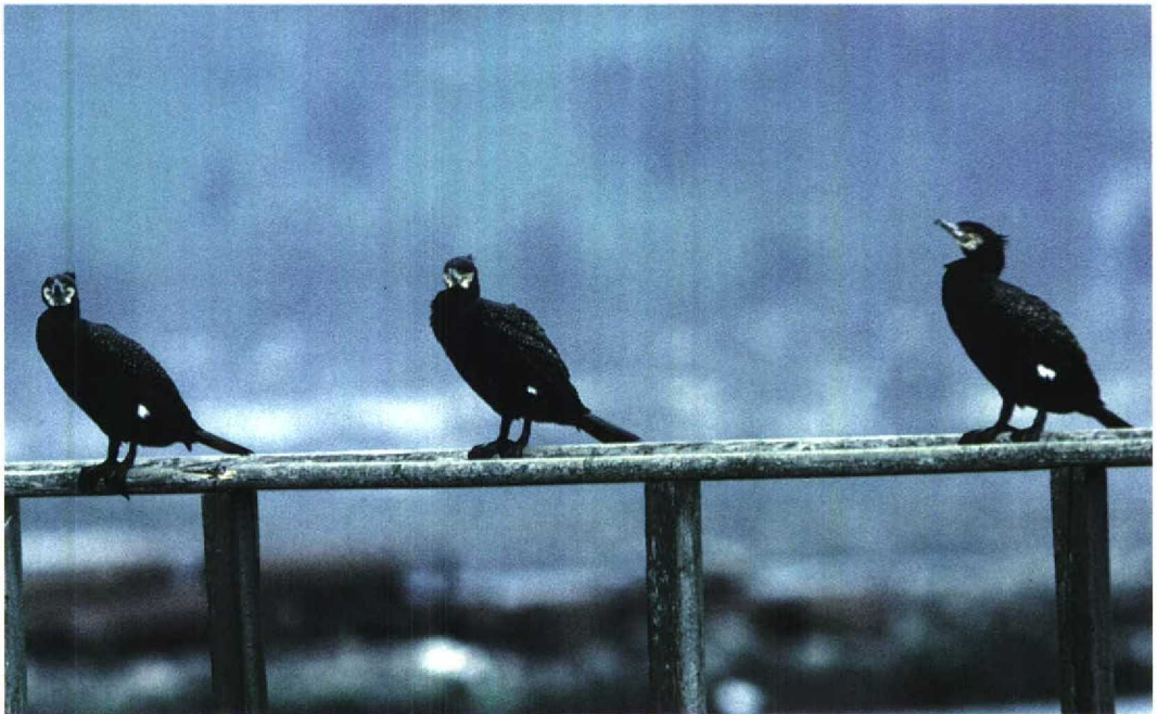
134 Atlantic Great Cormorants / Grote Aalscholvers Phalacrocorax carbo carbo , Belfast Lough, Northern Ireland, 20 March 1993