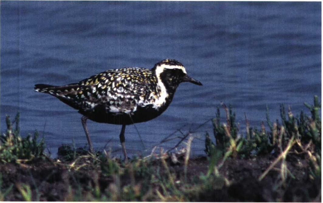
114 Pacific Golden Plover / Aziatische Goudplevier Pluvialis fulva , De Putten, Schoorl, Noord-Holland, 26 July 1996 (Arnoud B van den Berg)