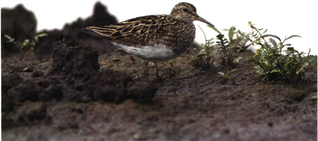
149 Gestreepte Strandloper / Pectoral Sandpiper Calidris melanotos , adult, Neer, Limburg, 4 augustus 1998 (Karel Lemmens)