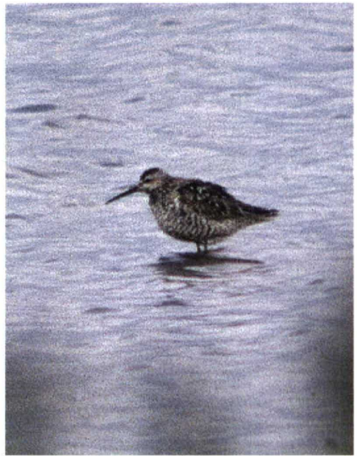
150 Steppekievit / Sociable Lapwing Vanellus gregarius , adult, Spaarndam, Noord-Holland, 25 juni 1998 ( Arnoud B van den Berg ) 151 Stelstrandloper / Stilt Sandpiper Micropalama himantopus , adult, Blauwe Kamer, Utrecht, 24 juli 1998 ( Arnoud B van den Berg ) 152 Huis kraai / House Crow Corvus splendens , adult, Kollumerland, Lauwersmeer, Friesland, 15 augustus 1998 ( Leo J R Boon/Cursorius )