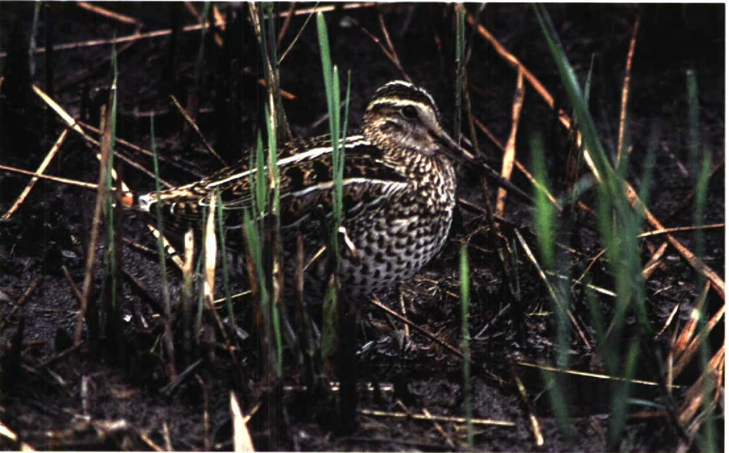
115 Great Snipe / Poelsnip Gallinago media , juvenile, West aan Zee, Terschelling, Friesland, 27 August 1996 (Hans Gebuis)