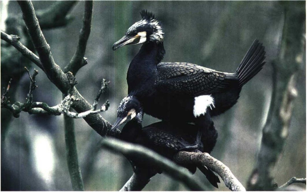
133 Continental Great Cormorants / Aalscholvers Phalacrocorax carbo sinensis , Naardermeer, Noord-Holland, Netherlands, 12 April 1986