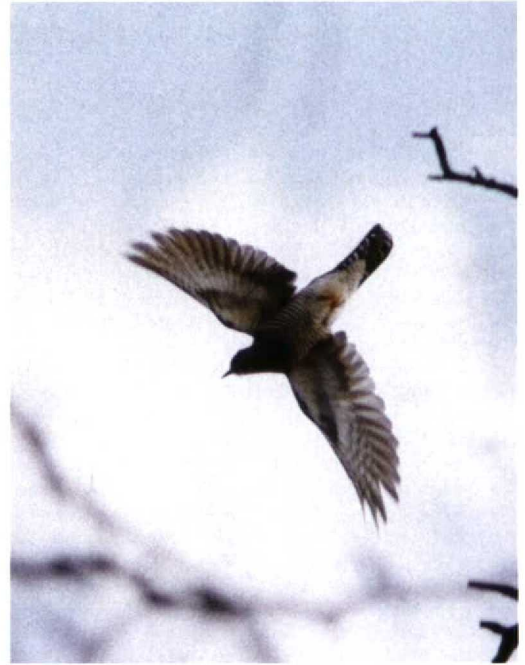
145 Oriental Cuckoo / Boskoekoek Cuculus saturator , Lieksa, Finland, 27 June 1998 146 Oriental Cuckoo / Boskoekoek Cuculus saturator , Lieksa, Finland, 27 June 1998 147 Great Black-headed Gull / Reuzenzwartkopmeeuw Larus ichthyaetus , first-year, Altwarmbüchener See, Hannover, Germany, 5 September 1998