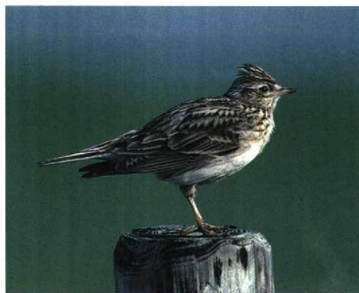
138 Sky Lark / Veldleeuwerik Alauda arvensis , Grevelingendam, Zuid-Holland, Netherlands, April 1993 (Hans Gebuis)

area on the lores, some dark malar striping and often a dark half-ring below the eye, which are all lacking in the mystery bird; Wood can be excluded because this species should show a different, more striking head-pattern with a longer supercilium. Therefore, the mystery bird must be either a Sky Lark or an Oriental Lark.