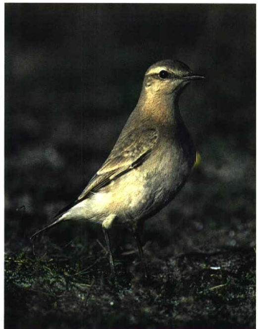
122 Desert Wheatear / Woestijntapuit Oenanthe deserti , first-winter male, Westernieland, Groningen, December 1996 (Rudy Offereins) 123 Isabelline Wheatear / Izabeltapuit Oenanthe isabellina , Maasvlakte, Zuid-Holland, 23 October 1996 (René Pop) 124 Booted Warbler / Kleine Spotvogel Acrocephalus caligatus , Katwijk aan Zee, Zuid-Holland, 10 September 1996 (Hans Gebuis)