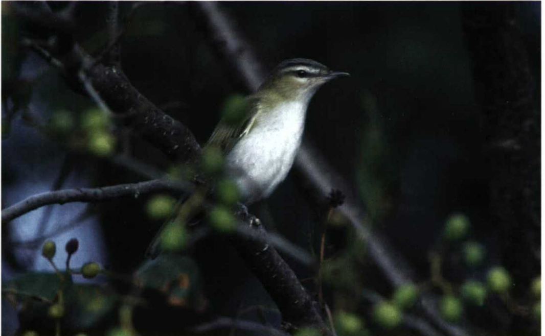
129 Red-eyed Vireo / Roodoogvireo Vireo olivaceus , Lange Paal, Vlieland, Friesland, 6 October 1996 (Hans Gebuis)