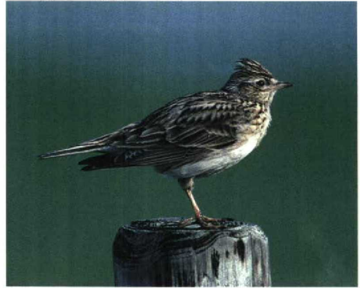
138 Sky Lark / Veldleeuwerik Alauda arvensis , Grevelingendam, Zuid-Holland, Netherlands, April 1993 (Hans Gebuis)

area on the lores, some dark malar striping and often a dark half-ring below the eye, which are all lacking in the mystery bird; Wood can be excluded because this species should show a different, more striking head-pattern with a longer supercilium. Therefore, the mystery bird must be either a Sky Lark or an Oriental Lark.