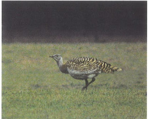
110 Collared Pratincole / Vorkstaartplevier Glareola pratincola , Lepelaarsplassen, Flevoland, 1 June 1996 111 White-rumped Sandpiper / Bonapartes Strandloper Calidris fuscicollis , adult, Wagejot, Texel, Noord-Holland, 13 August 1996 112 Pectoral Sandpiper / Gestreepte Strandloper Calidris melanotos , juvenile, Julianadorp, Noord-Holland, 28 September 1996 113 Great Bustard / Grote Trap Otis tarda , Rolde, Drenthe, January 1996

Baillon's Crane Porzana pusilla -,17,1 21-23 June, Singraven, Denekamp, Gelderland, singing, sound-recorded (O de Bruijn, P Knolle, C Derks). 1995 11 May to 13 June, Kleimeer, Langedijk, Noord-Holland, singing, sound-recorded (M Platteeuw, R E Brouwer, F Vogelzang); 3 to at least 7 July, Oude Waal, Nijmegen, Gelderland, male, sound-recorded (O van Hoorn, E A W Ernens). 1994 20-25 May, De Hamert, Bergen, Limburg, male, sound-recorded (H Alards).