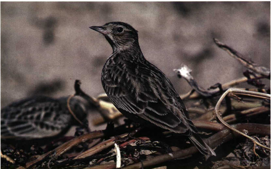
136 Oriental Lark / Kleine Veldleeuwerik Alauda gulgula , Eilat, Israel, 29 November 1992

The striking bill-shape of the mystery bird also does not fit many other lark species (including all members of the genera Calandrella and Melanocorypha ), because these species have shorter, thicker and less pointed bills. Bills more similar to that of the mystery bird are found in Crested Lark Galerida cristata (less so in Thekla Lark G theklae ), Wood Lark Lullula arborea , Sky Lark A arvensis and Oriental Lark A gulgula (also known as Small Skylark). Crested can be excluded as this species should show a distinct crest (which may seem absent occasionally), a darker