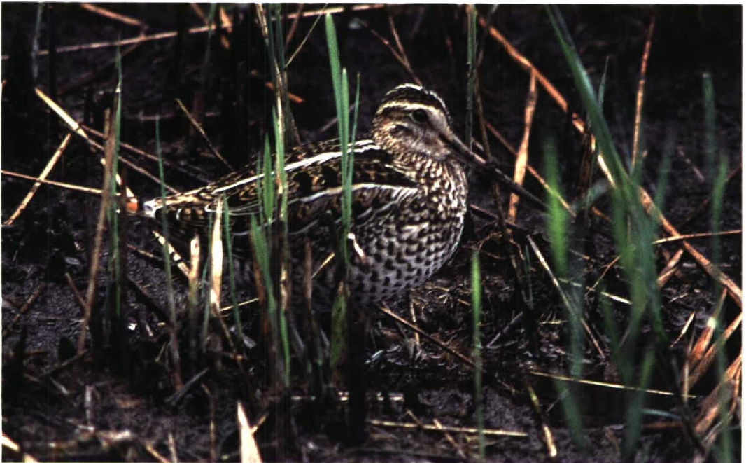
115 Great Snipe / Poelsnip Gallinago media , juvenile, West aan Zee, Terschelling, Friesland, 27 August 1996 (Hans Gebuis)