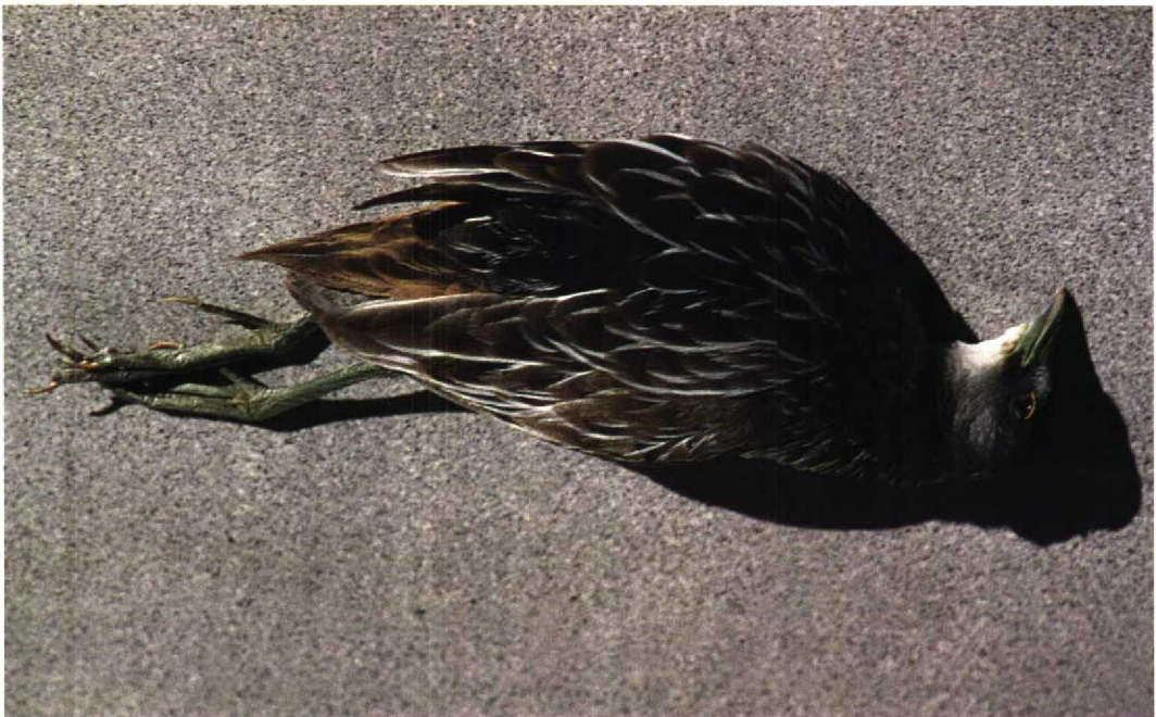
132 Striped Crake / Afrikaans Porseleinhoen Porzana marginalis (found at Livorno, Toscana, Italy, 4 January 1997), Istituto Nazionale Fauna Selvatica, Ozzano Emilia, Italy, March 1997

We are most grateful to Fernando Forzi for having attempted to rescue the Striped Crake and for the details which he provided. Information on shipping movements was kindly supplied by Massimo Moniga (harbour authority, Avvisatore