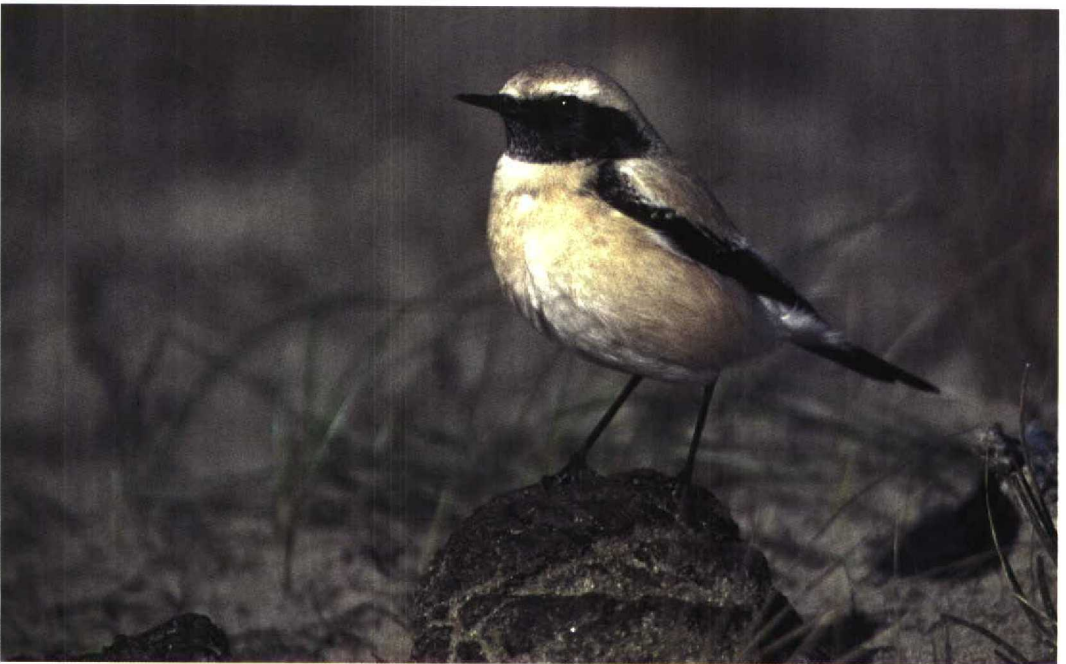
121 Desert Wheatear / Woestijntapuit Oenanthe deserti , adult male, Den Helder, Noord-Holland, 8 November 1996 (Diederik Kok)