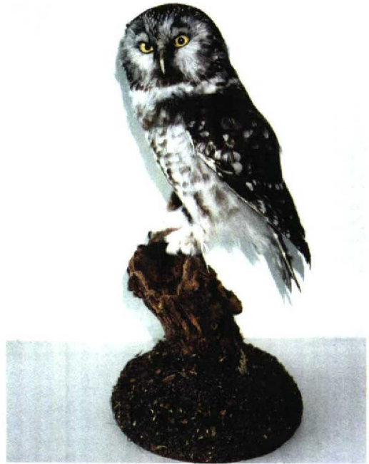
107 Short-toed Eagle / Slangenarend Circaetus gallicus , Hoge Veluwe, Gelderland, 5 August 1996 108 Tengmalm's Owl / Ruigpootuil Aegolius funereus (found dead at Zwolle, Overijssel, c 14 October 1996), Zwolle, Overijssel 109 Greater Sand Plover / Woestijnplevier Charadrius leschenaultii , first-summer female, De Cocksdorp, Texel, Noord-Holland, 1 August 1996