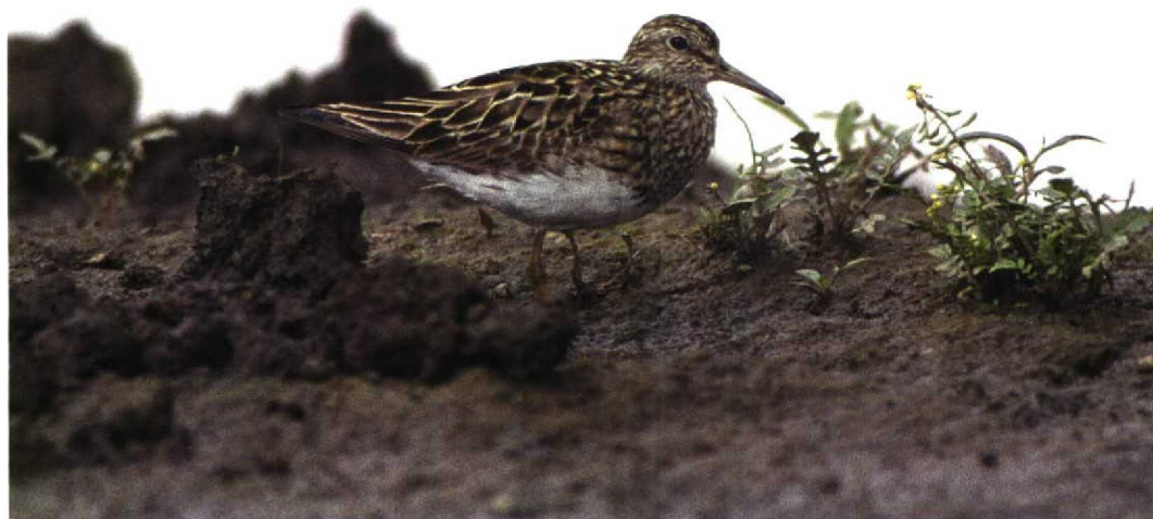
149 Gestreepte Strandloper / Pectoral Sandpiper Calidris melanotos , adult, Neer, Limburg, 4 augustus 1998