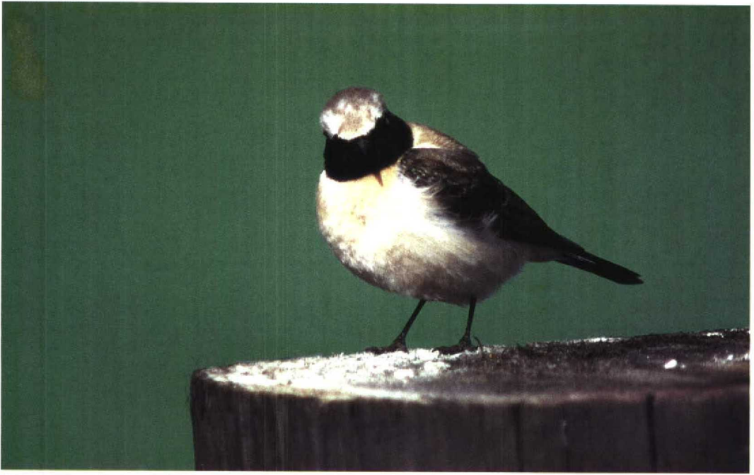
120 Western Black-eared Wheater / Westelijke Blonde Tapuit Oenanthe hispanica , first-summer male, Aagtekerke, Zeeland, 4 June 1996