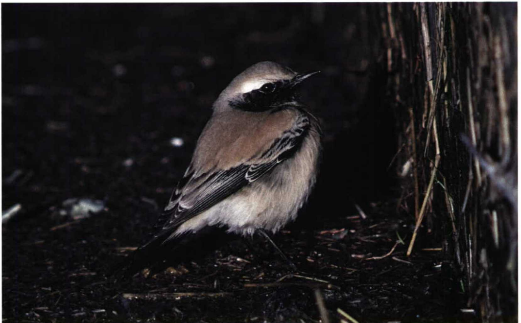
119 Desert Wheatear / Woestijntapuit Oenanthe deserti , first-winter male, Westernieland, Groningen, 23 December 1996