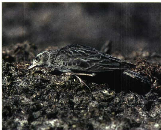
137 Oriental Lark / Kleine Veldleeuwerik Alauda gulgula , Eilat, Israel, 2 April 1993