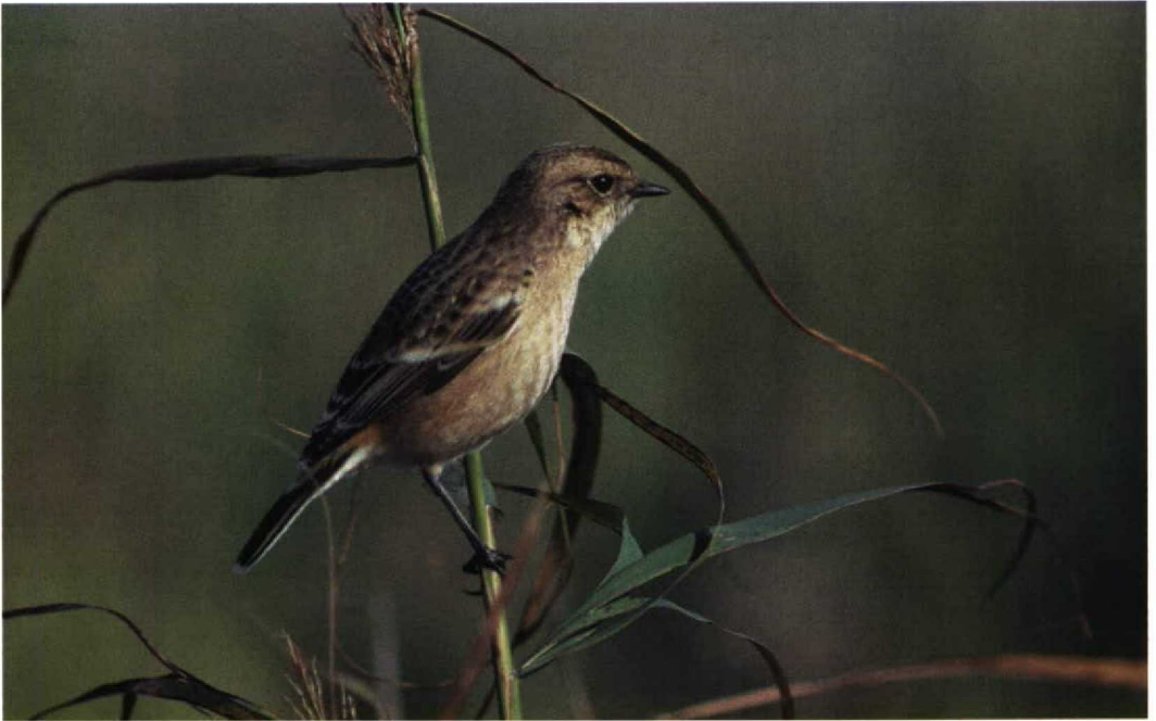
118 Siberian Stonechat / Aziatische Roodborsttapuit Saxicola maura , first-winter male, Den Helder, Noord-Holland, 12 October 1996 (Ruud E Brouwer)