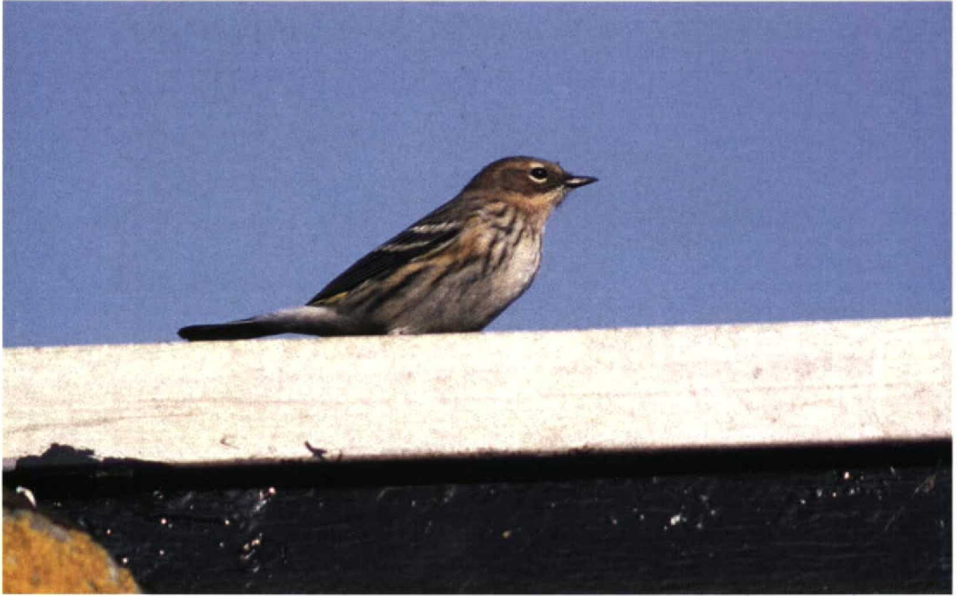
128 Myrtle Warbler / Mirtezanger Dendroica coronata , male, Oost-Vlieland, Vlieland, Friesland, 13 October 1996