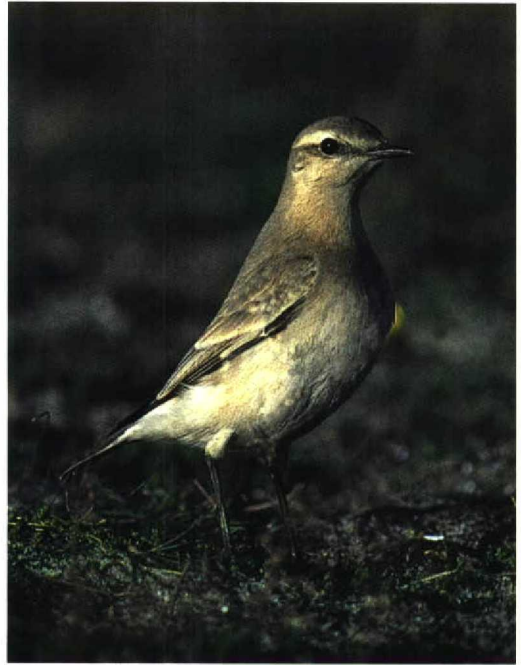
122 Desert Wheatear / Woestijntapuit Oenanthe deserti , first-winter male, Westernieland, Groningen, December 1996 123 Isabelline Wheatear / Izabeltapuit Oenanthe isabellina , Maasvlakte, Zuid-Holland, 23 October 1996 124 Booted Warbler / Kleine Spotvogel Acrocephalus caligatus , Katwijk aan Zee, Zuid-Holland, 10 September 1996