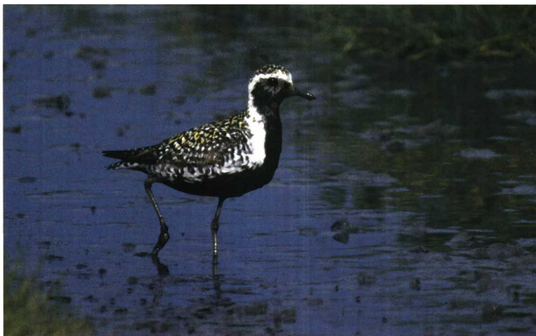
148 Aziatische Goudplevier / Pacific Golden Plover Pluvialis fulva , De Putten, Schoorl, Noord-Holland, 23 juli 1998