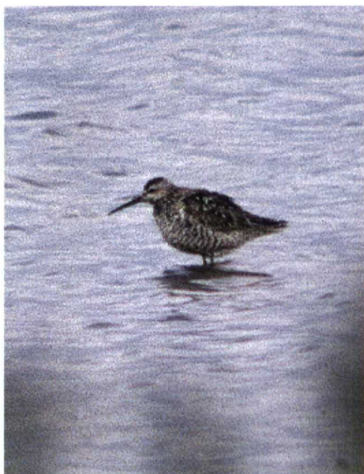
150 Steppekievit / Sociable Lapwing Vanellus gregarius , adult, Spaarndam, Noord-Holland, 25 juni 1998 ( Arnoud B van den Berg ) 151 Stelstrandloper / Stilt Sandpiper Micropalama himantopus , adult, Blauwe Kamer, Utrecht, 24 juli 1998 ( Arnoud B van den Berg ) 152 Huis kraai / House Crow Corvus splendens , adult, Kollumerland, Lauwersmeer, Friesland, 15 augustus 1998 ( Leo J R Boon/Cursorius )