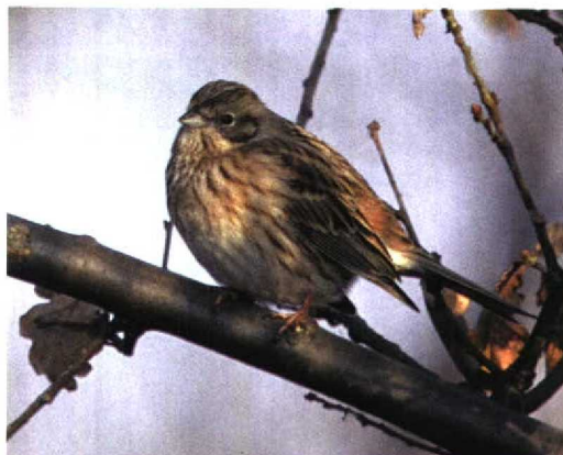
131 Pine Bunting / Witkopgors Emberiza leucocephalos , female, Katwijk, Zuid-Holland, November 1996