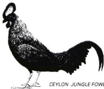
CEYLON JUNGLE FOWL