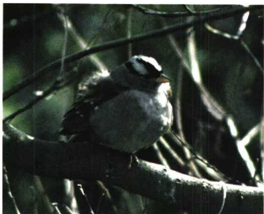
130 White-crowned Sparrow / Witkruingors Zonotrichia leucophrys leucophrys , adult, Spaarndam, Noord-Holland, January 1982 (Jan Kleiberg)