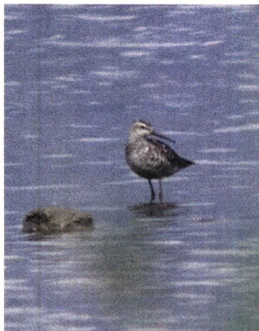
157 Steltstrandloper / Stilt Sandpiper Micropalama himantopus , adult, Blauwe Kamer, Utrecht, 24 juli 1998 (Arnoud B van den Berg)

Twee Siberische Strandlopers in Ezumakeeg Na de acht uur voor de baas in Leeuwarden voltooid te hebben besloot ik op donderdag 6 augustus de dag af te sluiten in de Ezumakeeg, aan de westkant van het Lauwersmeergebied nabij Ezumazijl, Friesland. Dit begin dit jaar ingerichte natuurgebied heeft in haar prille bestaan al het nodige aan zeldzame vogels opgeleverd. Zo zijn er al een Amerikaanse Smient Mareca americana , een Bronskopeend M. falcata , vier Steltkluten Himantopus himantopus , twee Gestreepte Strandlopers Calidris melanotos , een Grote Grijs Snip Limnodromus scolopaceus , vijf Poelruiters Tringa stagnatilis en drie Witwangsters Chlidonias hybridus waargenomen.