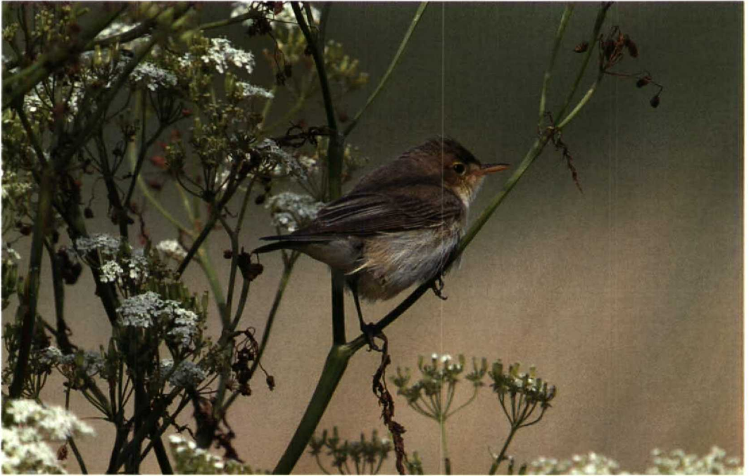
117 Orpheusspotvogel / Melodious Warbler Hippolais polyglotta , Rottumeroog, Groningen, 22 mei 1993 (Koen van Dijken) 118 Citroenkwikstaart / Citrine Wagtail Motacilla citreola , mannetje, Wilp, Gelderland, 5 mei 1993 (Arnaud B van den Berg) 119 Roodpootvalk / Red-footed Falcon Falco vespertinus , Sombrefte, Namen, 15 juni 1993 (Luc Verroken)