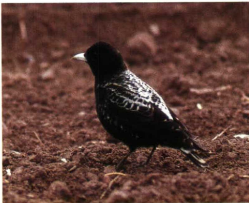
112 Black Lark / Zwarte Leeuwerik Melanocorypha yeltoniensis , male, Karlstad, Värmland, Sweden, May 1993

(two), Saarijärvi and Orivesi. On 25 May, a River Warbler L. fluviatilis was trapped on Fair Isle, Shetland, and was last seen on 27 May. In Belgium, one was singing at Schulen, Limburg, on 30-31 May. In south-eastern Norway, three singing birds were found from 31 May to mid-June. The second Paddyfield Warbler Acrocephalus agricola for Hong Kong was seen at Nam Sang