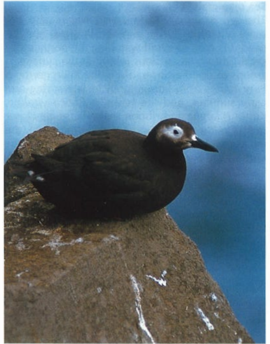
98 Short-tailed Albatross / Stellers Albatros Diomedea albatrus , off Torishima, Japan, March 1990 (Mark Brazil / Images of Japan) 99 Spectacled Guillemot / Brilzeekoet Cephus carbo , Teuri-jima Island, Hokkaido, Japan, June 1985 (Mark Brazil / Images of Japan) 100 Black-tailed Gulls / Sakhalinmeeuwen Larus crassirostris with Slaty-backed Gull / Kamtsjatkameeuw Larus schistisagus , Nemuro, Hokkaido, Japan, March 1984 (Mark Brazil / Images of Japan)