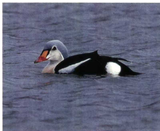
88 Pallid Harrier / Steppekiekendief Circus macrourus , third-year male, Vlissingen, Zeeland, 5 September 1991 89 Dusky Warbler / Bruine Boszanger Phylloscopus fuscatus , Friesland, 9 November 1990 90 Great Spotted Cuckoo / Kuiikoekoek Clamator glandarius , second-year, Lelystad, Flevoland, 4 April 1991 91 Black-eared Wheatear / Blonde Tapuit Oenanthe hispanica , female, Rottumeroog, Groningen, 6 June 1991 92 Lesser Yellowlegs / Kleine Geelpootruiter Tringa flavipes , adult winter, Flauwers Inlagen, Zeeland, 9 October 1991 93 King Eider / Koningseider Somateria spectabilis , Hoek van Holland, Zuidholland, 16 February 1991