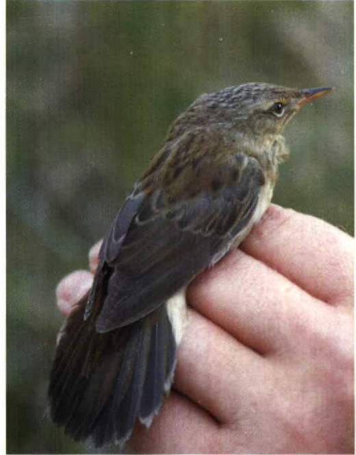
94 Pallas's Grasshopper Warbler / Siberische Snor Locustella certhiola , first-year, Castricum, Noordholland, 5 October 1991 (Henk-Jan Udding)

FLEVOLAND Oostvaardersdijk, 5 June, trapped (C M Liebrechts-Haaker, H Liebrechts).