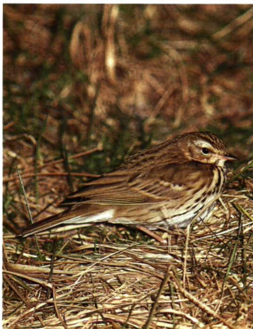
101-102 Siberische Boompieper / Olive-backed Pipit Anthus hodgsoni , Noordwijk, Zuidholland, 6 februari 1991 (Arnoud B van den Berg)

De Siberische Boompieper is een dwaalgast uit Siberië en is in de meeste Westeuropese landen vastgesteld, voornamelijk in het najaar (cf Lewington et al 1991). Het najaar van 1990 bracht een bijzonder groot aantal Siberische Boompiepers naar Westeuropa. Op de Britse Eilanden werden gedurende eind september en oktober tenminste 46 gevallen bekend. Dit betekende in één najaar meer dan de helft van het totaal in Groot-Brittannië en Ierland vastgestelde aantal Siberische Boompiepers tot 1990 (Rogers & Rarities Committee 1991-92). In Nederland werd in het najaar van 1990 slechts één geval bekend: een vangst in de Kennemerduinen te Bloemendaal, Noordholland, op 25 oktober; deze vogel bleef in het gebied aanwezig tot 29 oktober (Eggenhuizen & de Meijer 1991).