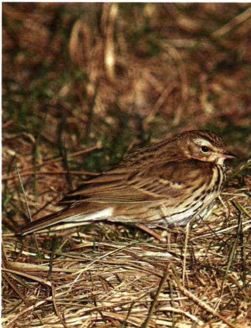
101-102 Siberische Boompieper / Olive-backed Pipit Anthus hodgsoni , Noordwijk, Zuidholland, 6 februari 1991 (Arnoud B van den Berg)

De Siberische Boompieper is een dwaalgast uit Siberië en is in de meeste Westeuropese landen vastgesteld, voornamelijk in het najaar (cf Lewington et al 1991). Het najaar van 1990 bracht een bijzonder groot aantal Siberische Boompiepers naar Westeuropa. Op de Britse Eilanden werden gedurende eind september en oktober tenminste 46 gevallen bekend. Dit betekende in één najaar meer dan de helft van het totaal in Groot-Brittannië en Ierland vastgestelde aantal Siberische Boompiepers tot 1990 (Rogers & Rarities Committee 1991-92). In Nederland werd in het najaar van 1990 slechts één geval bekend: een vangst in de Kennemerduinen te Bloemendaal, Noordholland, op 25 oktober; deze vogel bleef in het gebied aanwezig tot 29 oktober (Eggenhuizen & de Meijer 1991).