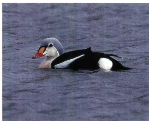
88 Pallid Harrier / Steppekiekendief Circus macrourus , third-year male, Vlissingen, Zeeland, 5 September 1991 89 Dusky Warbler / Bruine Boszanger Phylloscopus fuscatus , Friesland, 9 November 1990 90 Great Spotted Cuckoo / Kuiikoekoek Clamator glandarius , second-year, Lelystad, Flevoland, 4 April 1991 91 Black-eared Wheatear / Blonde Tapuit Oenanthe hispanica , female, Rottumeroog, Groningen, 6 June 1991 92 Lesser Yellowlegs / Kleine Geelpootruiter Tringa flavipes , adult winter, Flauwers Inlagen, Zeeland, 9 October 1991 93 King Eider / Koningseider Somateria spectabilis , Hoek van Holland, Zuidholland, 16 February 1991