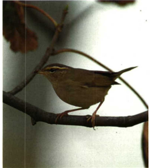
104-105 Raddes Boszanger / Radde's Warbler Phylloscopus schwarzi , Oosterend, Terschelling, Friesland, 10 oktober 1991 (Arie Ouwerkerk)

van Raddes Boszanger bekend waarvan dit de vijfde was: 9 oktober 1974, Texel, Noordholland (vangst) (Voous 1975); 8 oktober 1977, Castricum, Noordholland (vangst) (Slings 1979); 5 oktober 1981, Vlieland, Friesland (vangst) (van IJzendoorn 1981); 18 oktober 1981, Maasvlakte, Zuidholland (de Knijff & Schenk 1981); 10 oktober 1991, Terschelling; 12 oktober 1991, Meijndel, Zuidholland (vangst) (van den Berg et al 1993). Een geval op de Maasvlakte, Zuidholland, op 6-8 november 1990, dat aanvankelijk door de CDNA was aanvaard (van den Berg et al 1992), is alsnog afgewezen (van den Berg et al 1993). De foto's van deze vogel toonden bij nader inzien een Bruine Boszanger.