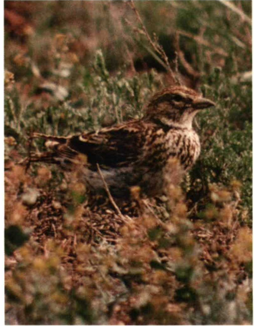
Mystery photograph 53. Solution in next issue.

even the primaries of L m hafizi show an obvious whitish fringe, it has paler whitish underparts and a distinctive pale supercilium. It also has longer wings (84-99 instead of 76-91 mm) and, especially, tail (74-90 instead of 58-76 mm). In fact, it is often easier to tell L m hafizi from L m megarhynchos than to identify Thrush Nightingale! For more information on the identification of Rufous