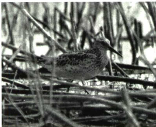
87 Great Knot / Grote Kanoet Calidris tenuirostris , Oostvaardersdijk, Flevoland, 21 September 1991 (Hans Gebuis)

1851, the second in November 1874, the third was a long-staying individual from November 1955 to March 1956 and the fourth in January-March 1965 (cf Eykman et al 1941, Voous 1957). (One collected in November 1913 could not be traced during review.) The pattern of records in central European countries shows that these birds originated from south-eastern rather than south-western Europe (Eigenhuis & Menkveld 1985). Some of the five birds recorded in 1985-91 might involve escapes. Apparently for the first time, a large number (24) was successfully raised in 1984 in captivity in the Netherlands at 't Zand, Noordholland, destined for re-introduction programmes elsewhere in Europe (Eigenhuis & Menkveld 1985). At least one bird staying with Ruddy Ducks O. jamaicensis at Abtskolk, Petten, Noordholland, in November-December 1987 is regarded as an escape from 't Zand (where Ruddy Duck is also bred) and was rejected (Blankert et al 1988, van der Burg et al 1988). The latter bird was possibly the same as the one at the same locality in January-March 1989 (cf van den Burg et al 1989).