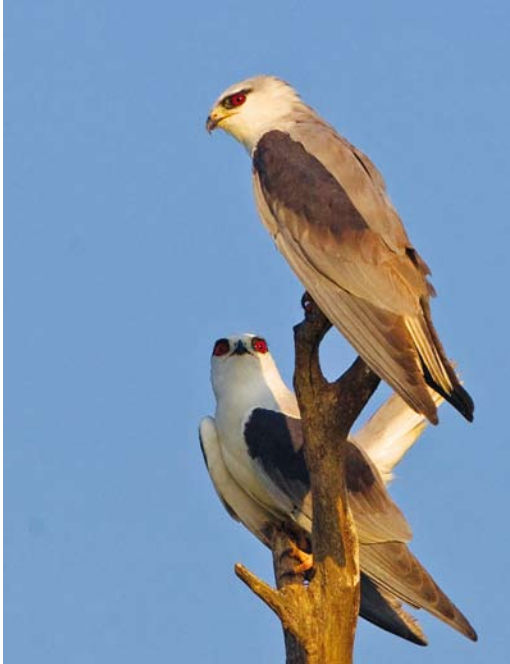
4 Black-winged Kites / Grijsze Wouwen Elanus caeruleus vociferus , pair, Hula valley, Israel, 27 November 2011