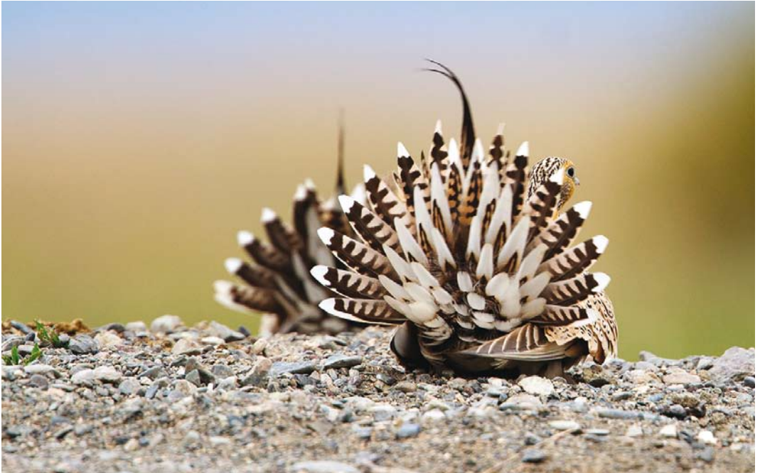
50 Pallas's Sandgrouse / Steppehoenders Syrrhaptes paradoxus , females, between Zaysan lake and Tarbagatai mountains, East Kazakhstan, Kazakhstan, 25 May 2014. Displaying vent and tail-feathers.