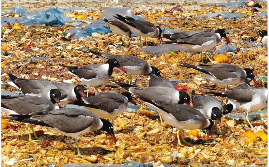
22 White-eyed Gulls / Witoogmeeuwen Larus leucophthalmus , adult summer, Hurghada, Egypt, 10 June 2014 (Mohamed I Habib). Feeding at rubbish tip.