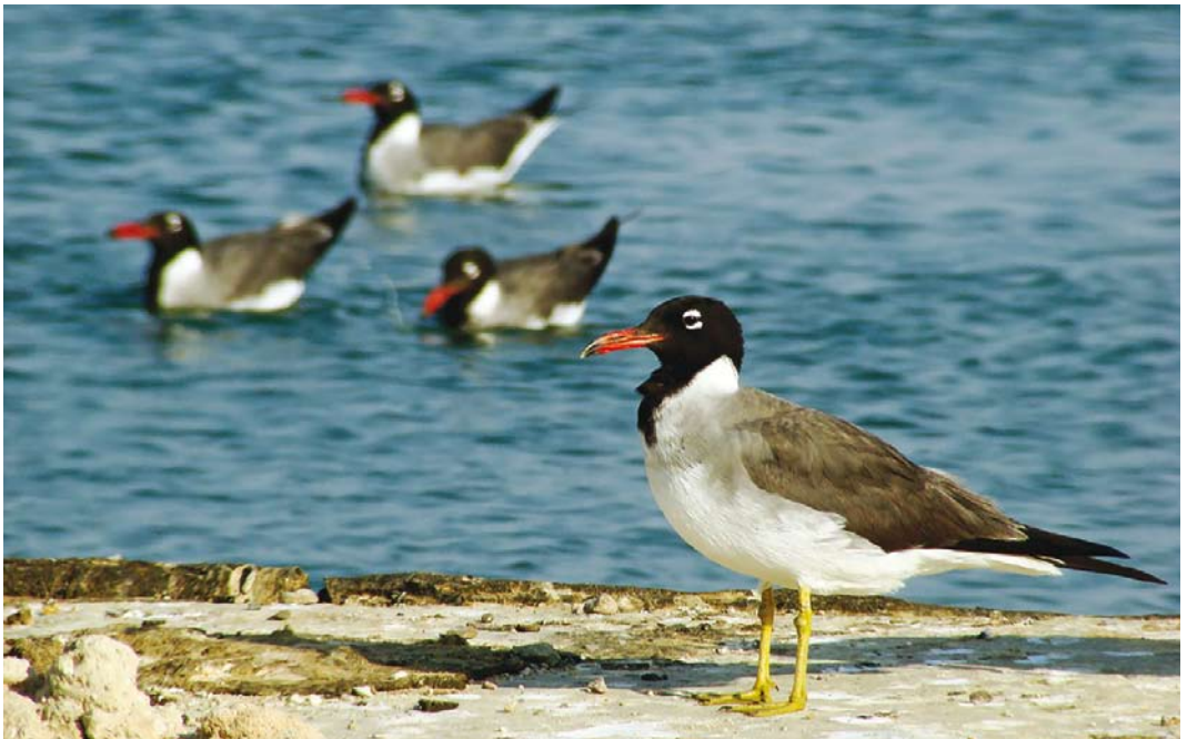
23 White-eyed Gulls / Witoogmeeuwen Larus leucophthalmus , adult summer, Hurghada, Egypt, 12 July 2008 (Mohamed I Habib)