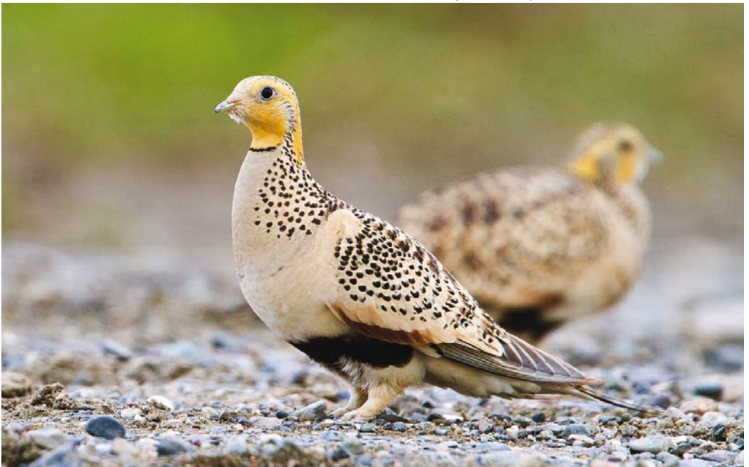
51 Pallas's Sandgrouse / Steppehoen Syrrhaptes paradoxus , females, between Zaysan lake and Tarbagatai mountains, East Kazakhstan, Kazakhstan, 25 May 2014 (Ralph Martin)