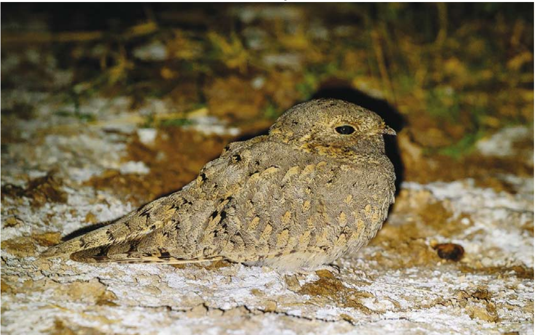
57 Sykes's Nightjar / Sykes' Nachtzwaluw Caprimulgus mahrattensis , Muntasar oasis, Oman, 12 December 2016 (Albert Burgas)