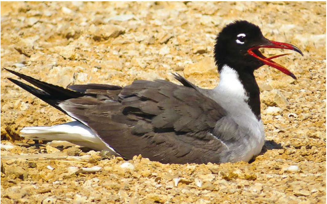
13 White-eyed Gull / Witoogmeeuw Larus leucophthalmus , adult summer, off Hurghada, Egypt, 8 June 2014. Fluffing feathers during hot day.

White-eyed Gulls choose remote islands for nesting in colonies with other marine birds. The islands are usually on sandy or fossilized coral substrate, undisturbed and free from land predators. Birds arrive at the breeding site from the second week of April and disperse widely from the end of October, when the breeding season has ended. Once they arrive on the islands, they start browsing the area to establish a territory and pair up. They then perform a special display and start building the nest, which takes three to four weeks. Nests are built in small depressions in sandy substrate and consist of old bones of dead chicks from previous seasons, dead shells and small fossil corals. Old twigs are only rarely used, except when the breeding site is close to shrubs.